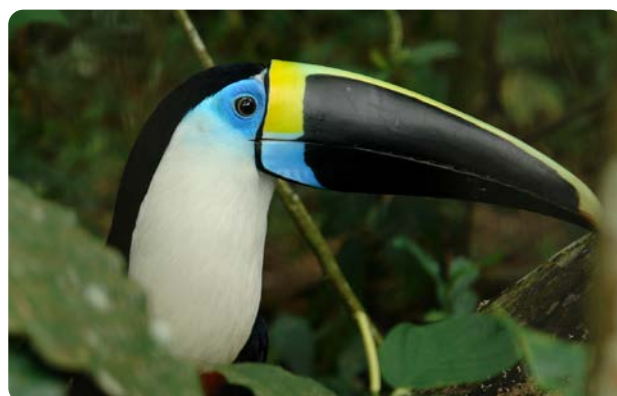
Inside a room at Sacha Lodge (top); A toucan in the Amazon (above)