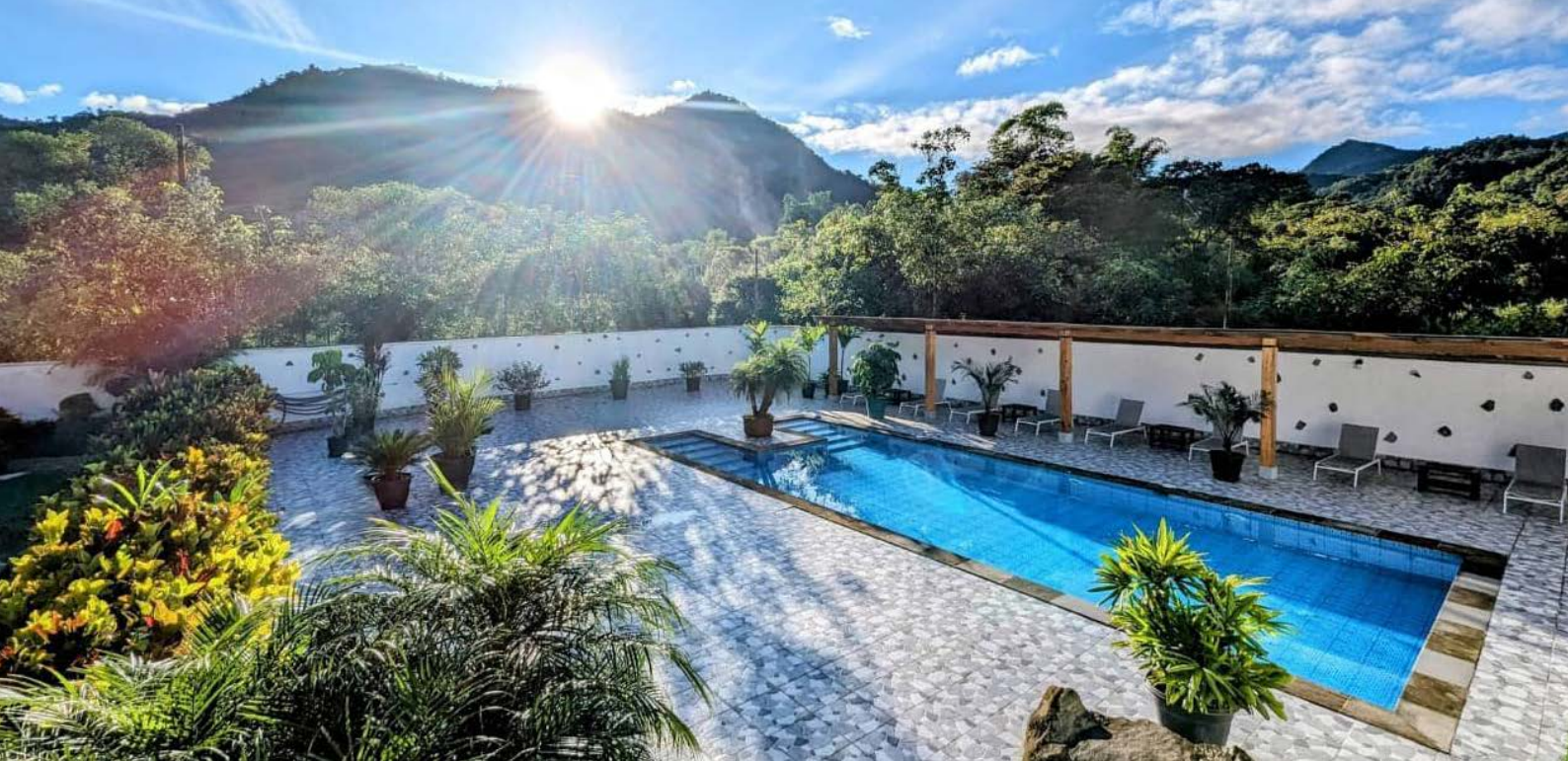
The pool at Las Terrazas de Dana Boutique Lodge Spa, Mindo