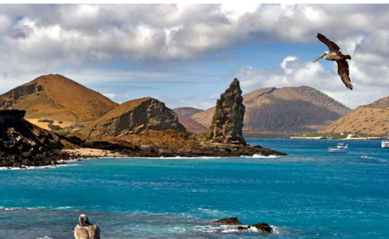
Traditional Andean market, Ecuador (top); Pinnacle Rock, Bartolomé Island, Galápagos (above)

The extension to Sacha Lodge costs AUD $3,998 per person sharing