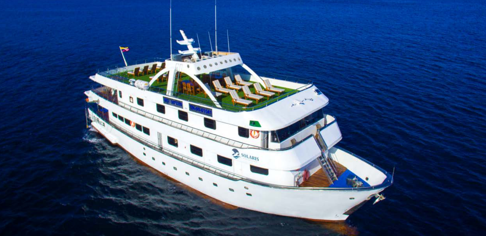
Solaris at sea