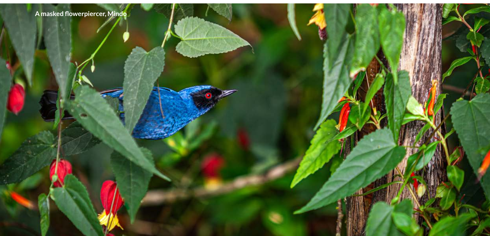
A masked flowerpiercer, Mindo

NB: All itineraries are subject to change according to local conditions.