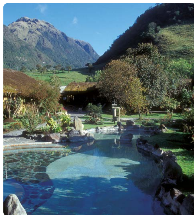
Termas de Papallacta Resort

If taking the pre-tour extension, there is one night in Quito before taking an onward flight to the Amazon. Using an airport hotel saves time with less traveling to and from the city.