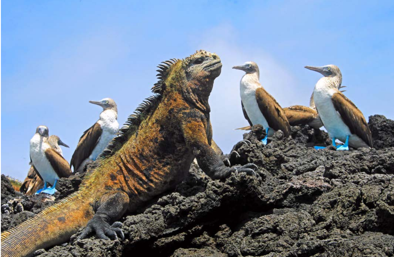
A marine iguana with blue-footed boobies in the Galápagos