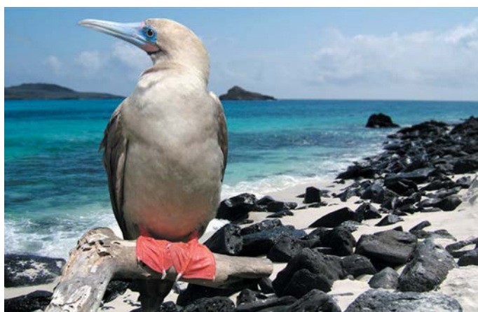
See condors in the Andes (top); Colourful colonial buildings in Quito; A Galápagos giant tortoise; Red footed booby, Galápagos © Mike Shepherd (top)