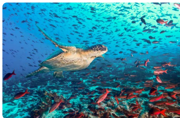
A turtle swimming with fish in Galápagos

petrels, with a higher chance of seeing whale sharks in the far northwest of the islands. November is particularly good for observing blue-footed boobies, being their breeding and nesting season. Mating season for green turtles commences and you can expect to see Galápagos penguins, flightless cormorants, and various seabirds.