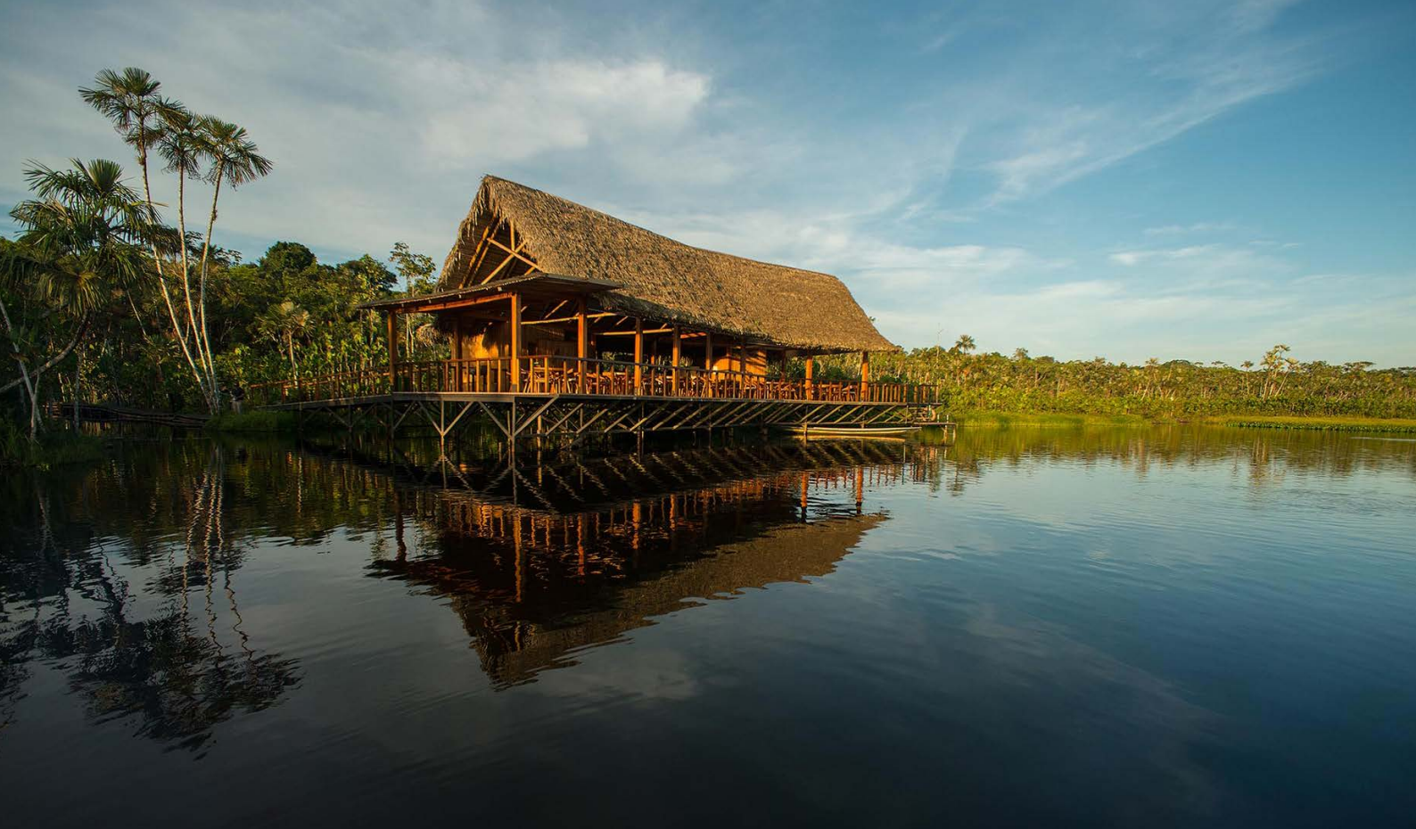
The Balsa, Sacha Lodge