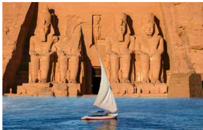
The Temple of Edfu (top); Learn about traditional Nubian medicine, Nubia Island; Spices in Khan el Khalili Bazaar, Cairo; Felucca and Abu Simbel (above)