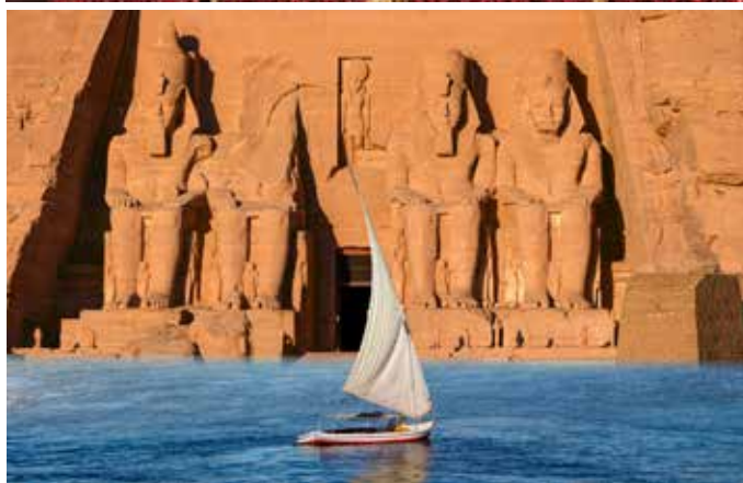
The Temple of Edfu (top); Learn about traditional Nubian medicine, Nubia Island; Spices in Khan el Khalili Bazaar, Cairo; Felucca and Abu Simbel (above)