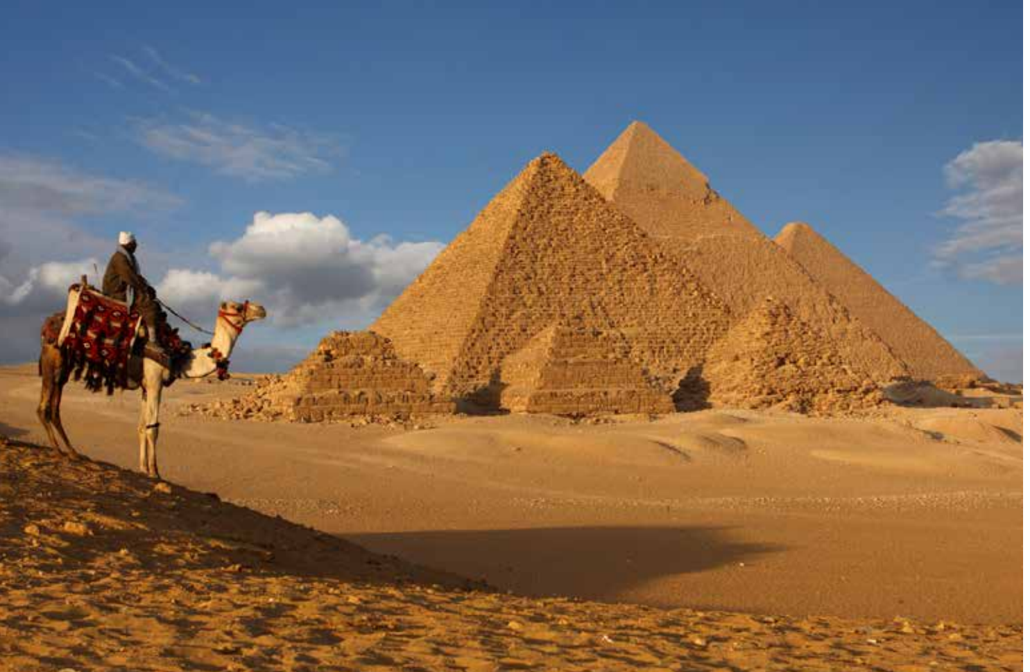
The Pyramids at Giza

The Nile has been a repository of stories for millennia. Begin on its western bank in historic Giza, home to the last surviving wonder of the ancient world. Fly to Luxor to explore the grandeur of ancient Thebes, then board the Jaz Regent for a four-night Nile cruise, travelling in comfort as the river unfolds around you and reveals its tales of antiquity.