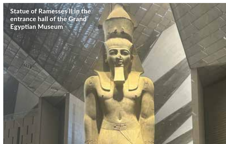
Statue of Ramesses II in the entrance hall of the Grand Egyptian Museum