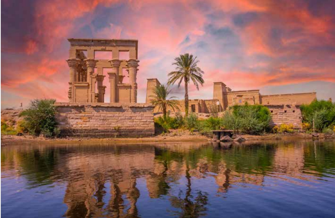
Temple of Philae Aswan