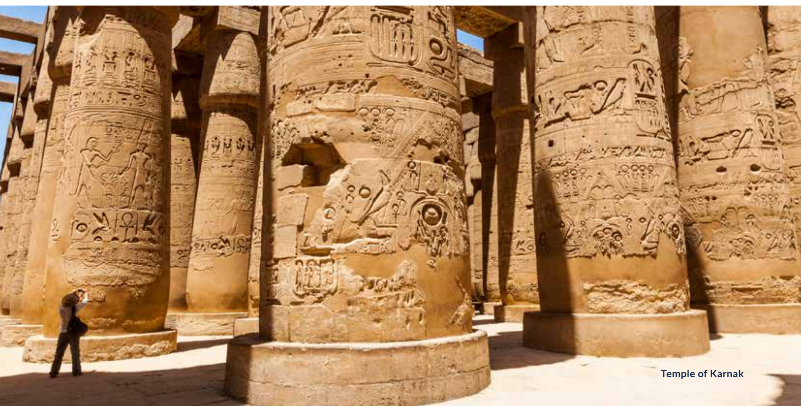
Temple of Karnak