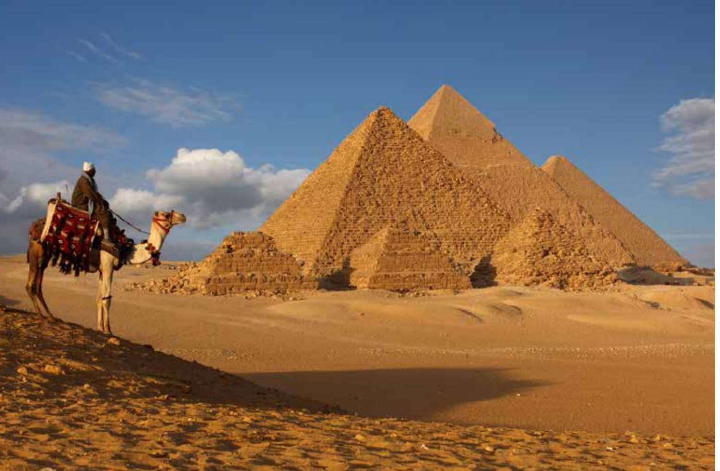
The Pyramids at Giza

The Nile has been a repository of stories for millennia. Begin on its western bank in historic Giza, home to the last surviving wonder of the ancient world. Fly to Luxor to explore the grandeur of ancient Thebes, then board the Jaz Regent for a four-night Nile cruise, travelling in comfort as the river unfolds around you and reveals its tales of antiquity.