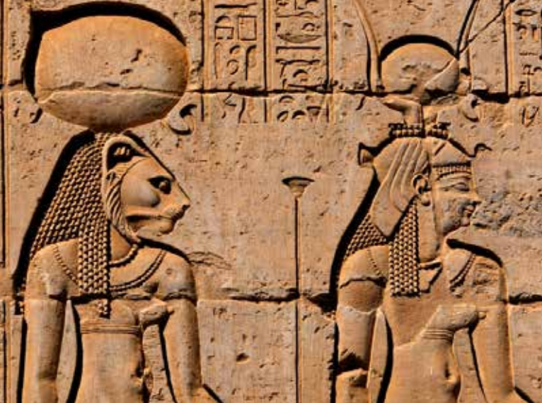
Hieroglyphics at Kom Ombo Temple