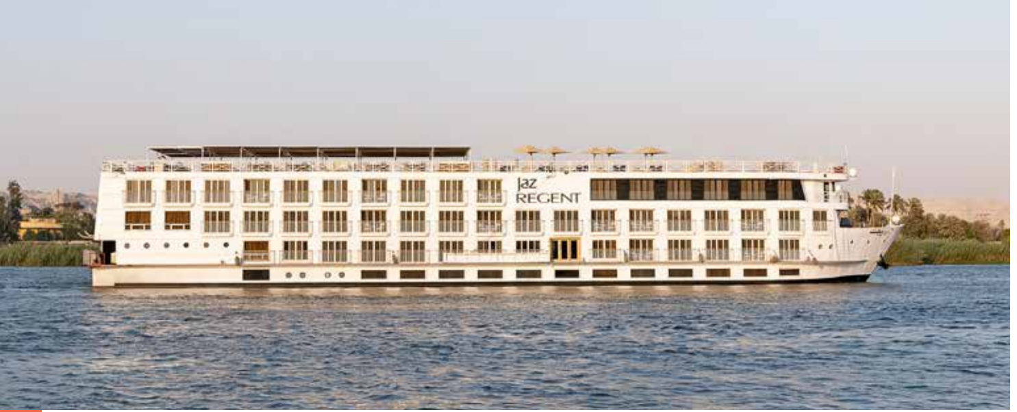
The Jaz Regent river cruise ship