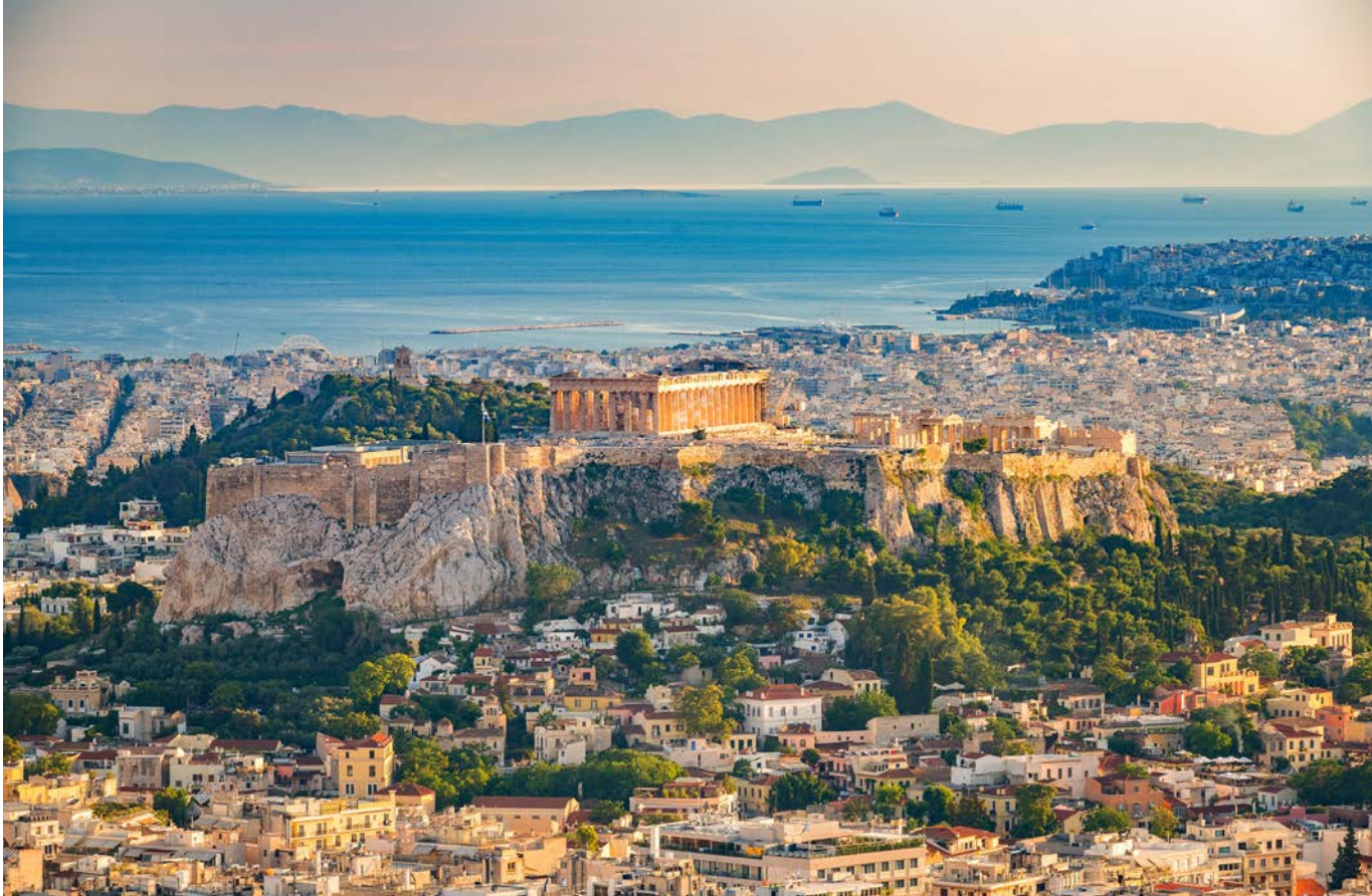
View over Athens