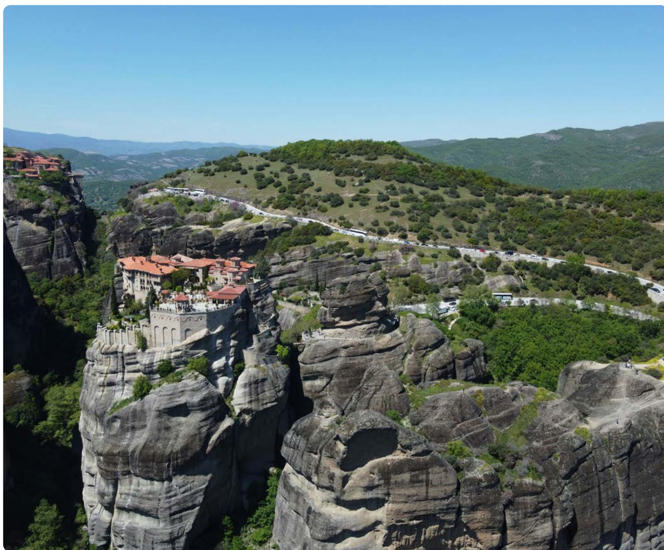
Majestic Meteora Monastery