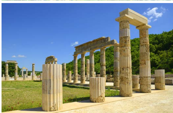
White tower, Thessaloniki (top); Plaka, Athens; Saint Paul cathedral in Thessaloniki; The Palace of Aigai, Vergina (above)