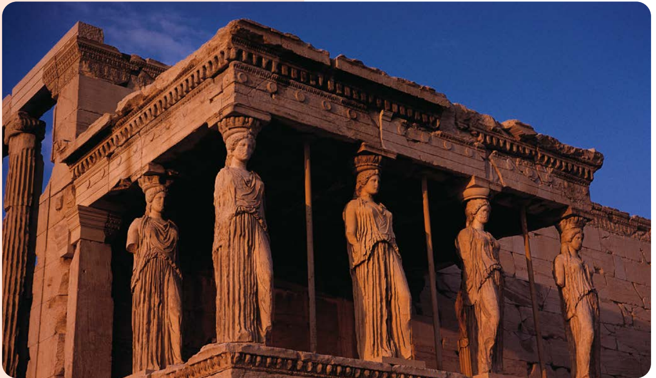
Erechtheion, Acropolis Hill

The cost of the tour sharing a room is £2,690 per person