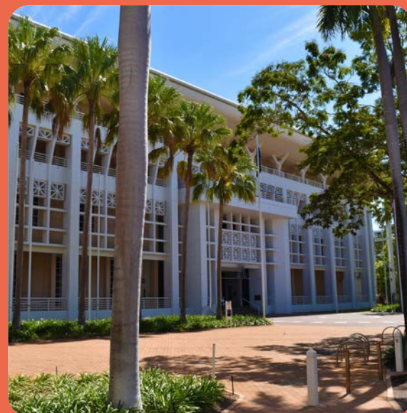
Parliament House, Darwin