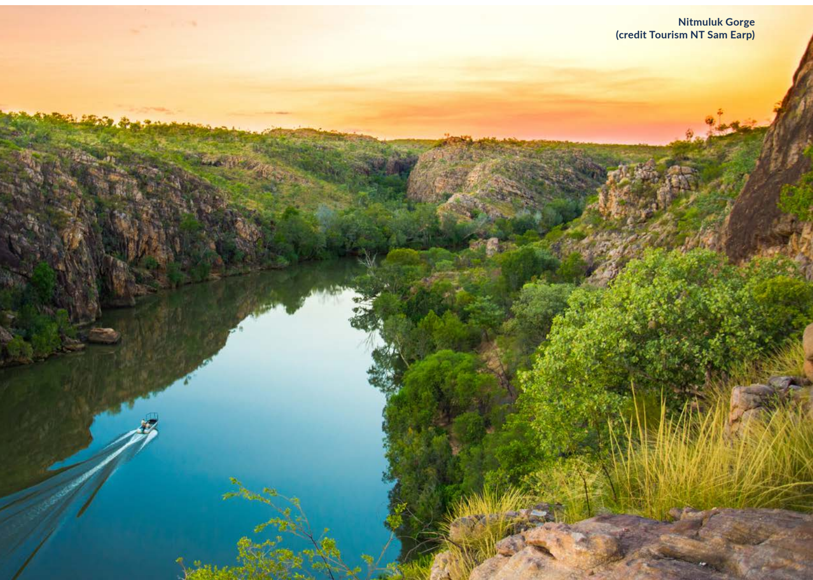
Nitmuluk Gorge