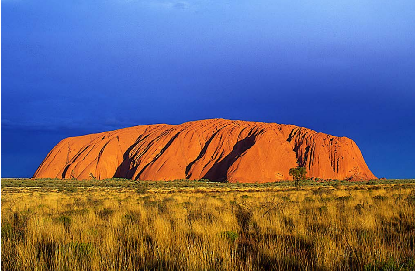
Magnificent Uluru in dramatic light