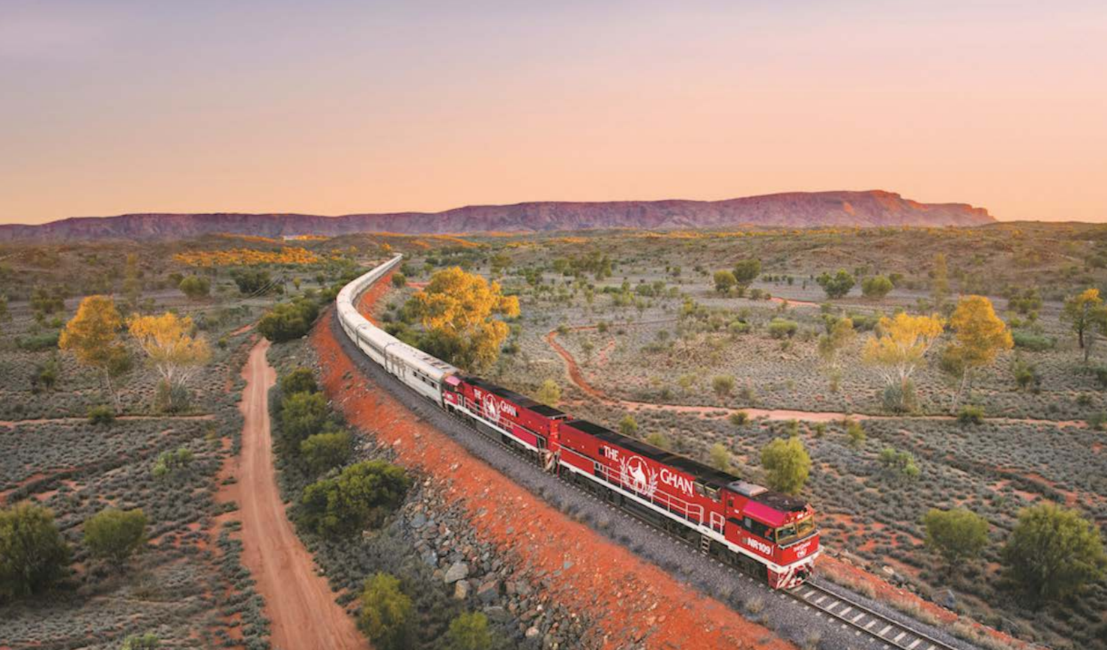
The Ghan and the MacDonnell Ranges