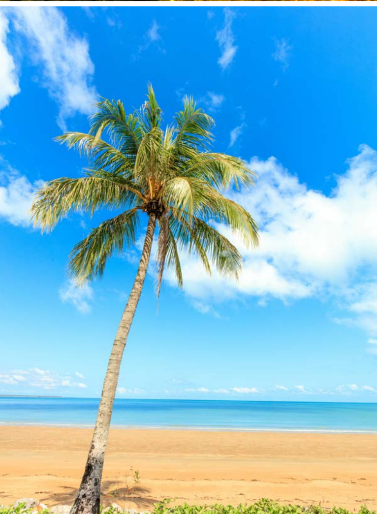
Florence Falls, Litchfield (top); Mindil Beach, Darwin (above)

The cost of the tour is €4,718 per person sharing