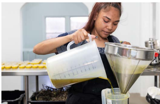
West MacDonnell Ranges (top); The Old Telegraph Station, Alice Springs; Kata Tjuta; Making bush balm, Purple House (above)