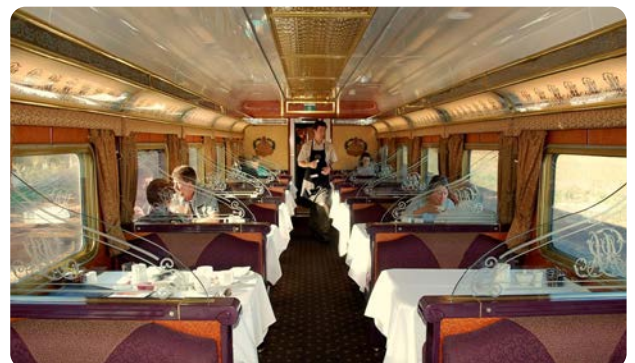
The Outback Explorer Lounge (left); The Queen Adelaide Restaurant (above)