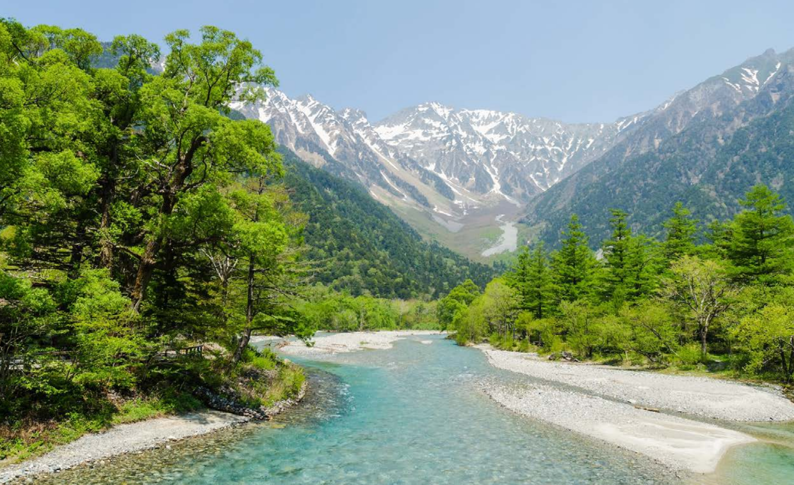
The Japanese Alps near Matsumoto