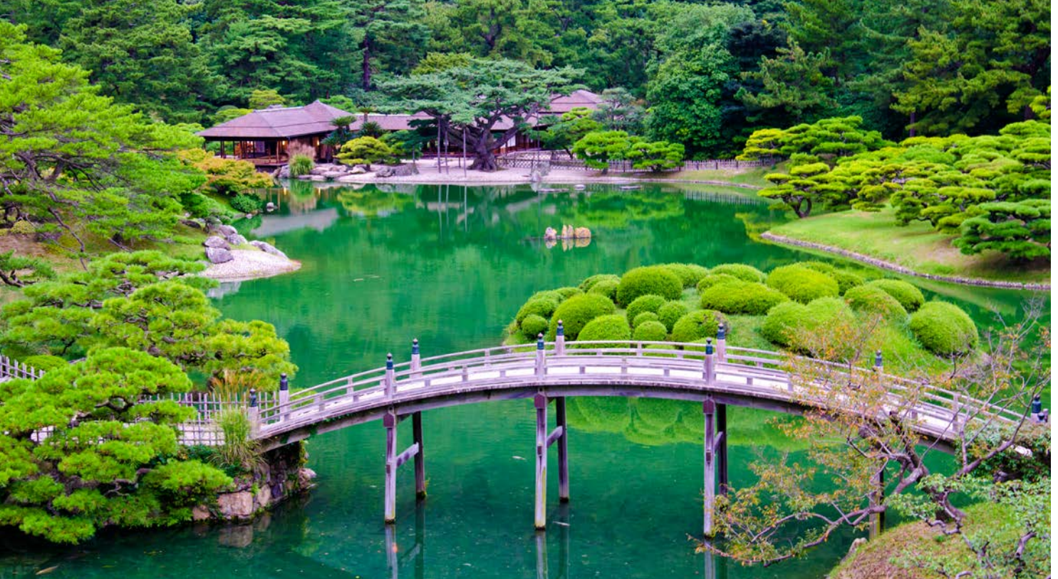
Ritsurin Garden, Takamatsu

Japanese design is a philosophy as much as an aesthetic. Traditional Japanese architecture strives to be in harmony with nature, incorporating minimalistic design and using lightweight, natural materials (like wood, bamboo, straw, and paper), with porous boundaries between inside and outside. In earthquake-prone Japan, these materials were also much easier to rebuild.