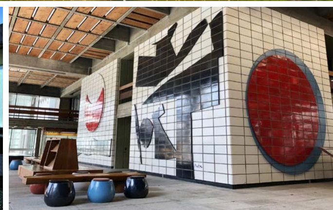
(Clockwise from top) Hundertwasser Waste-to-Energy facility in Maishima; The Golden Temple, Kyoto; Kagawa Prefectural Government Office East Building by Kenzo Tange; The hillside gallery at Awaji Yumebutai by Tadao Ando; Indigo dyeing (by Colin Bisset).