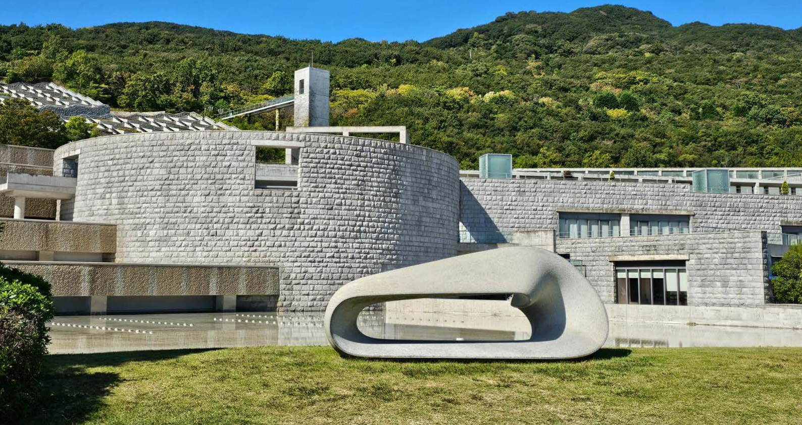
Contemporary architecture by Tadao Ando on Awachi Island