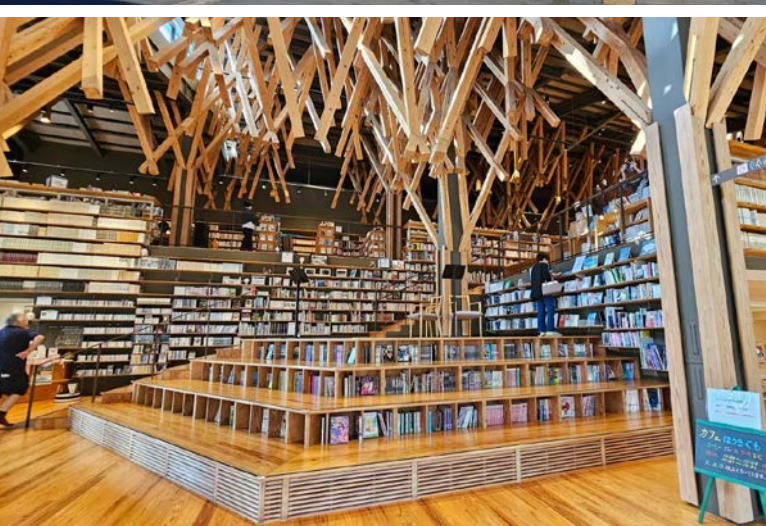
Akashi Bridge and whirlpools (top); George Nakashima Memorial Gallery; Takamatsu waterfront ; Community Library, Yusu-hara by Kengo Kuma (above)

The cost of the tour per person sharing is AUD $9,786