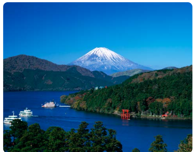
Fushimi Inari Shrine, Kyoto (top); Lake Ashi with a view of Mt Fuji (above)