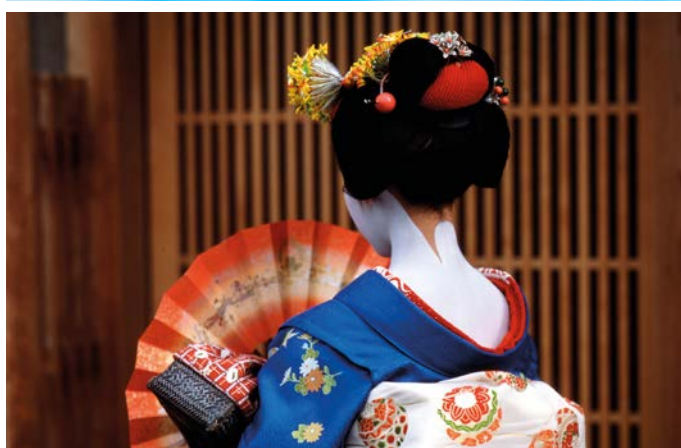
Welfare Facility Building, Yushara by Kengo Kuma (top); Double Vine Bridge; Tori Shrine; A traditional maiko, Kyoto (above)