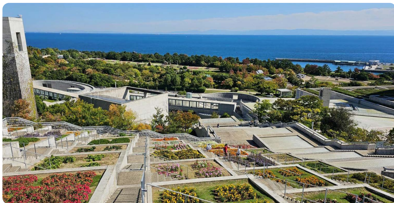
The 100-Step Garden by Tadao Ando on Awachi Island (by Colin Bisset)