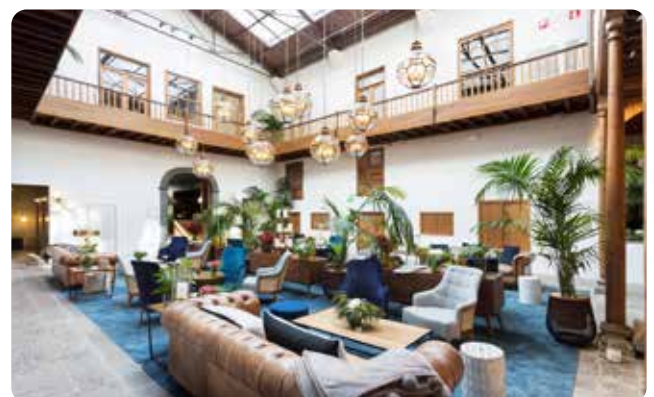
The pool at La Laguna Gran Hotel, Tenerife (top); The hall in La Laguna Gran Hotel, Tenerife (above)