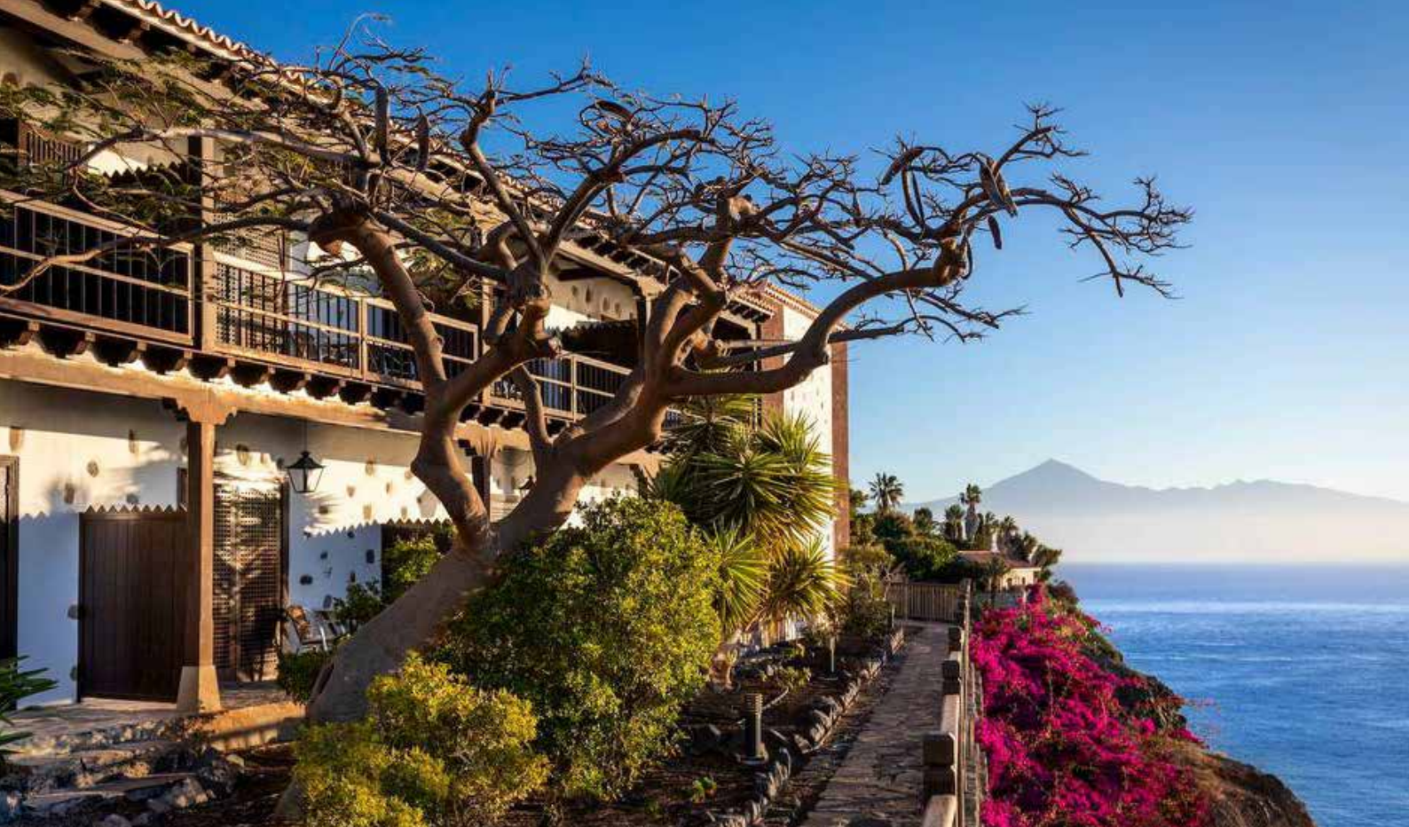
The view from Parador de La Gomera, La Gomera