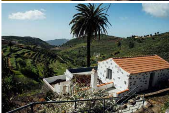
Magnificent Tenerife (top); La Laguna, Tenerife Agulo, La Gomera; Chipude, La Gomera (above)