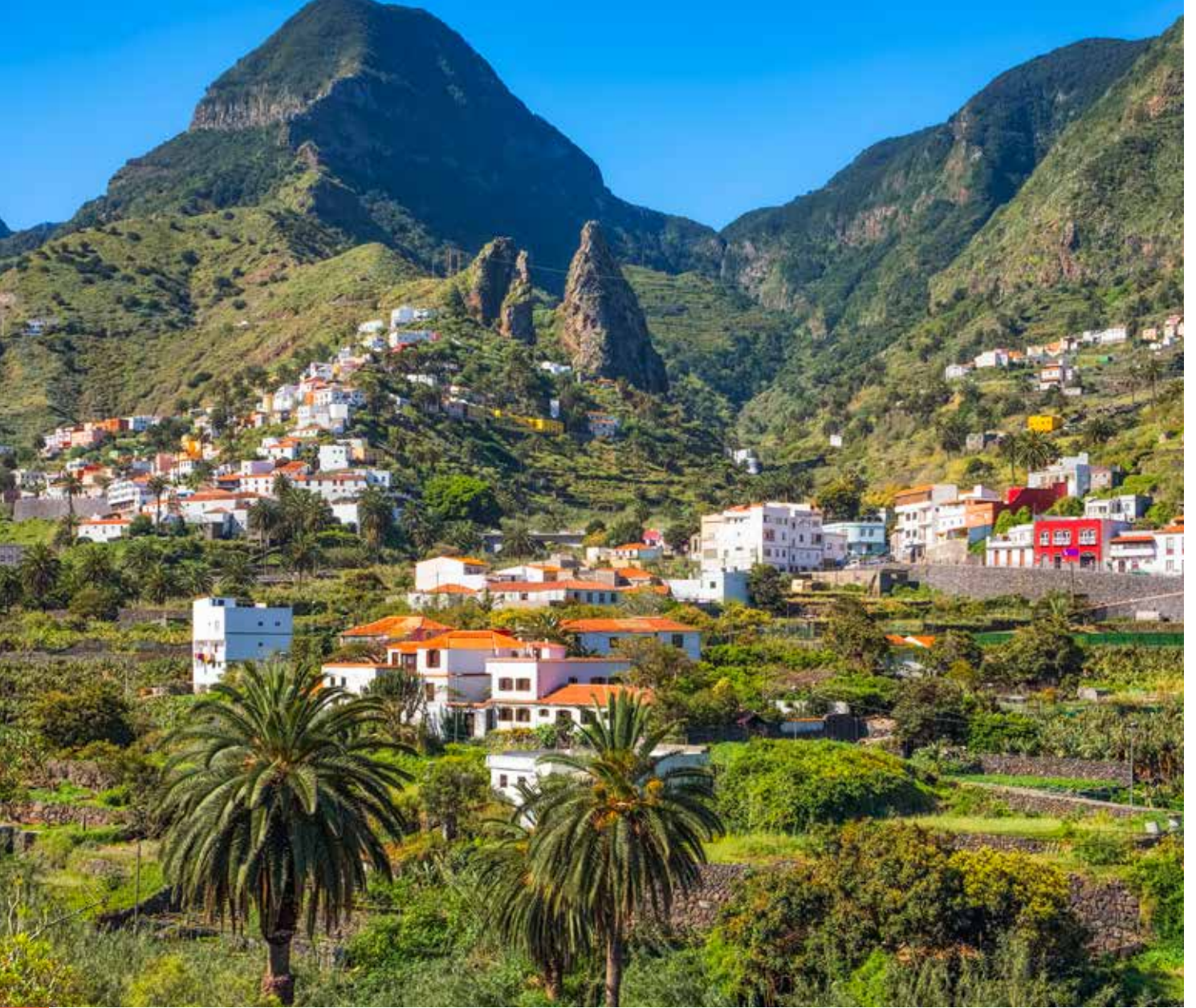
The town of Hermigua in La Gomera

The Canary Islands owe their rich horticultural heritage to the whims of a Spanish king. During the peak of Spain's naval power in the 1600's, plants, herbs and spices were collected from around the world to ship back to Spain. The strategically positioned, subtropical Canary Islands became the ideal cultivation point on the route back to Spain, forming some of Spain's oldest botanical gardens.