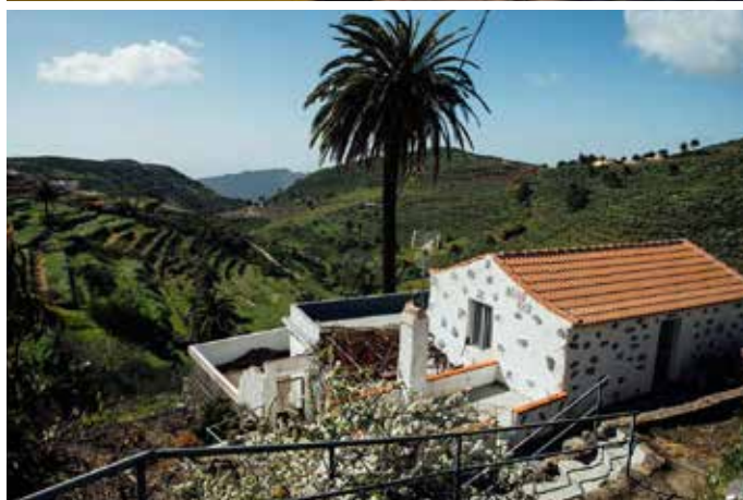
Magnificent Tenerife (top); La Laguna, Tenerife Agulo, La Gomera; Chipude, La Gomera (above)