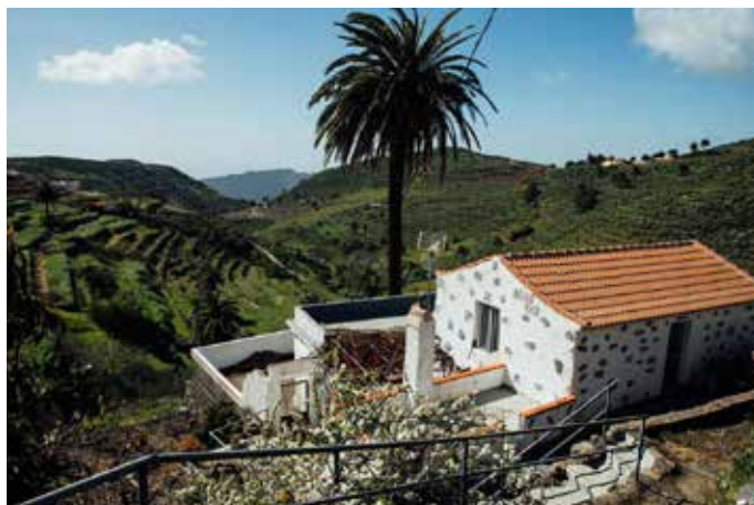
Magnificent Tenerife (top); La Laguna, Tenerife Agulo, La Gomera; Chipude, La Gomera (above)