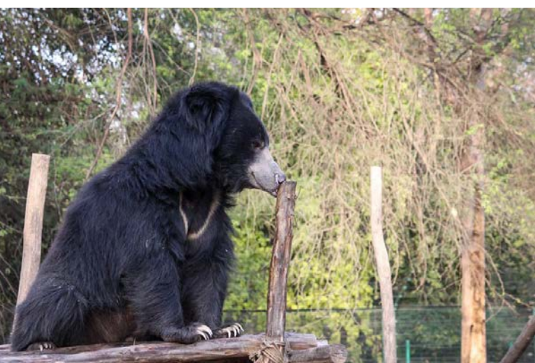
Humayun's Tomb, Delhi (top); Leopard, Jhalana Leopard Reserve (top); Palace of the Winds, Jaipur; Sloth bear, Agra Bear Rescue Facility (above)

The cost of the tour per person sharing is £3,590