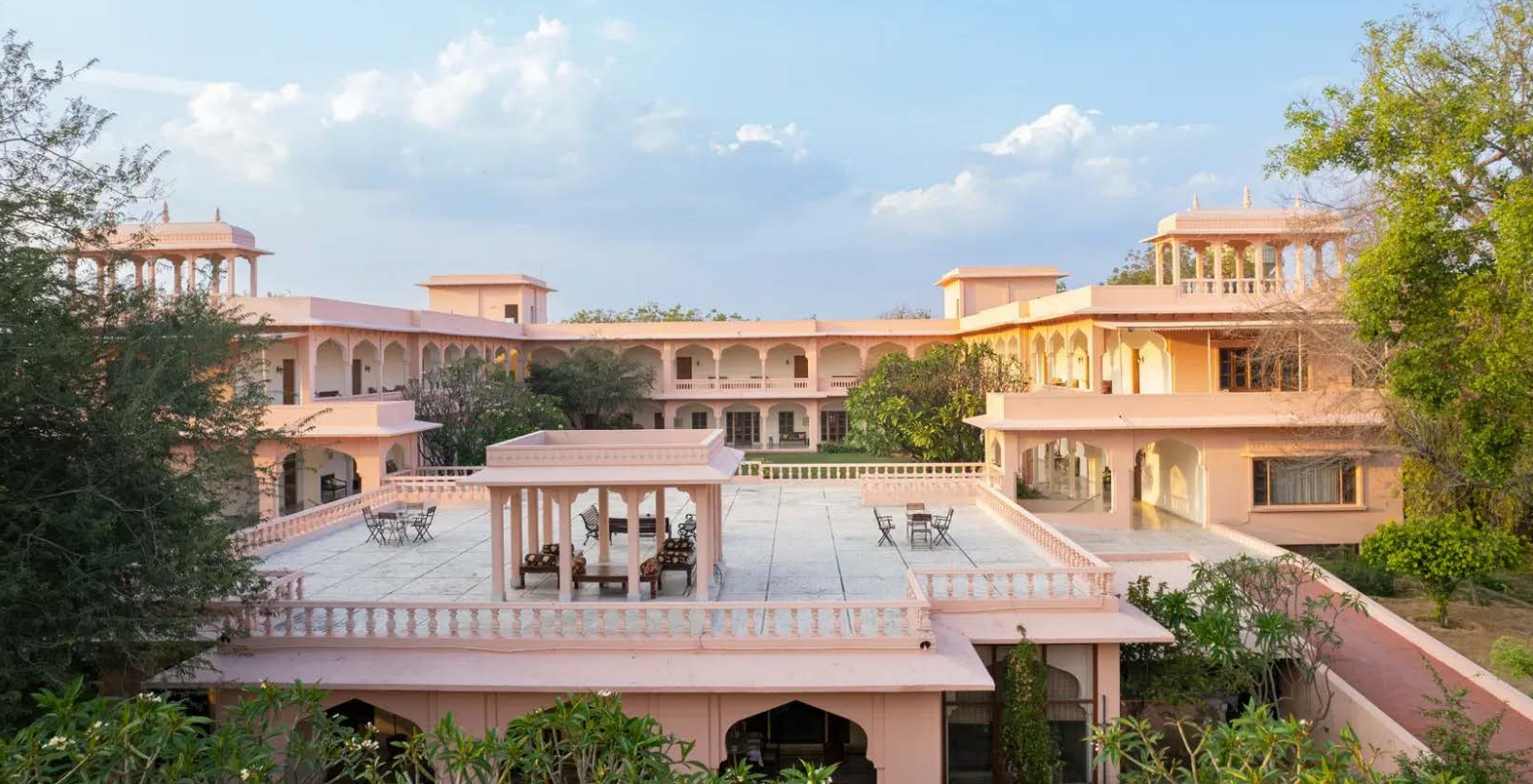
Dev Villas, Ranthambore