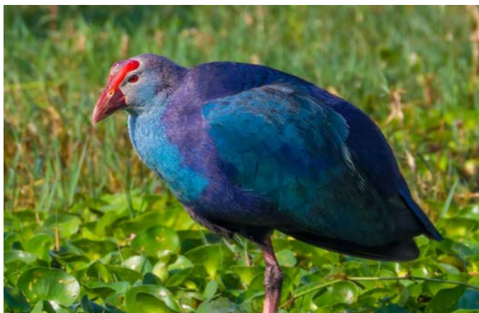
Ranthambore National Park (top); Boating lake, Delhi; Amber Fort, Jaipur; Bird variety at Keoladeo National Park (above)