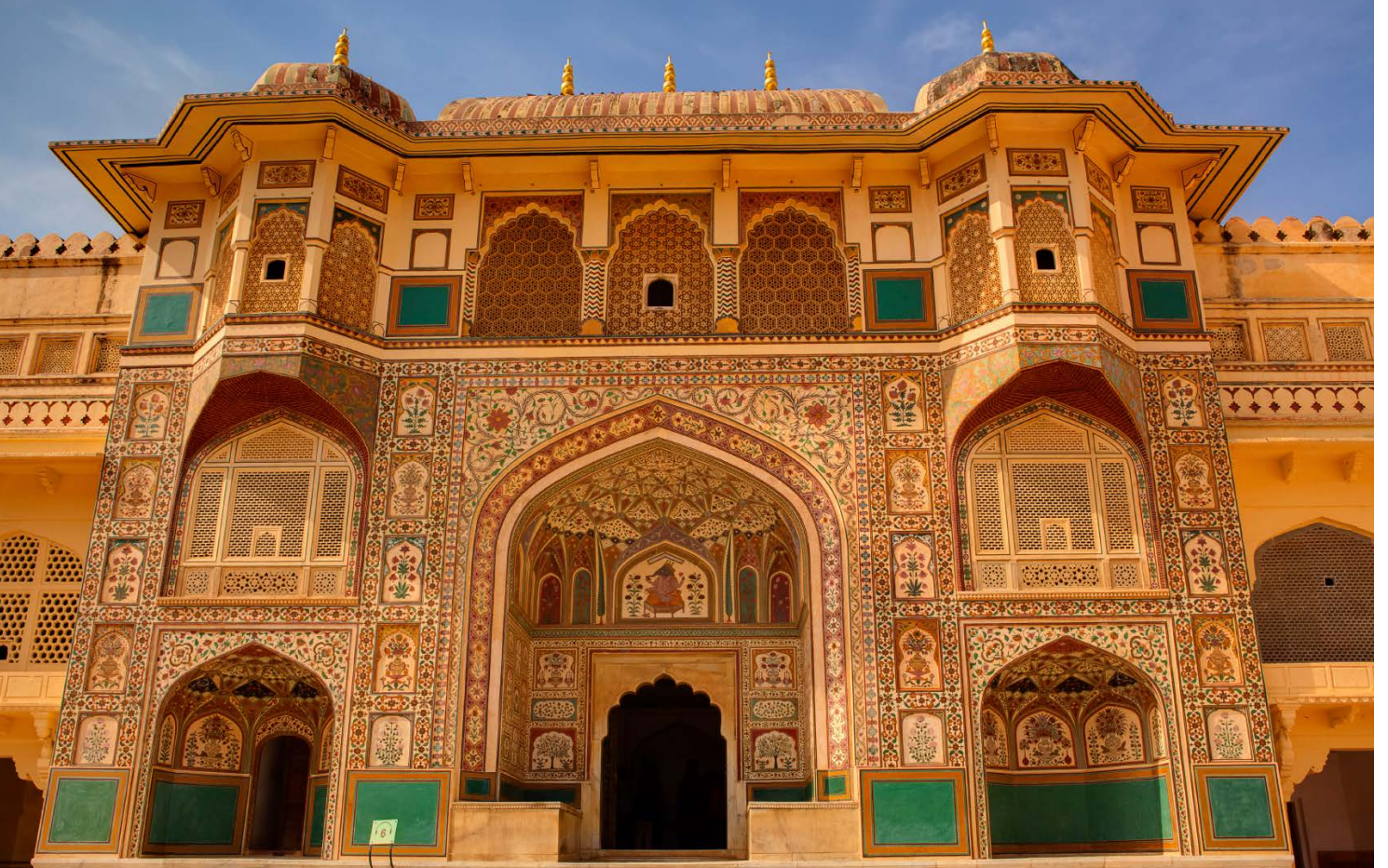
The courtyard of Amber Fort, Jaipur

Travel to the Aravalli hills, dusty savannahs, and dense forests of India's biodiverse northern states. The region is home to the world's largest population of tigers, the one-horned rhinoceros, the magnificent Asian elephant, and a fabulous array of bird species.