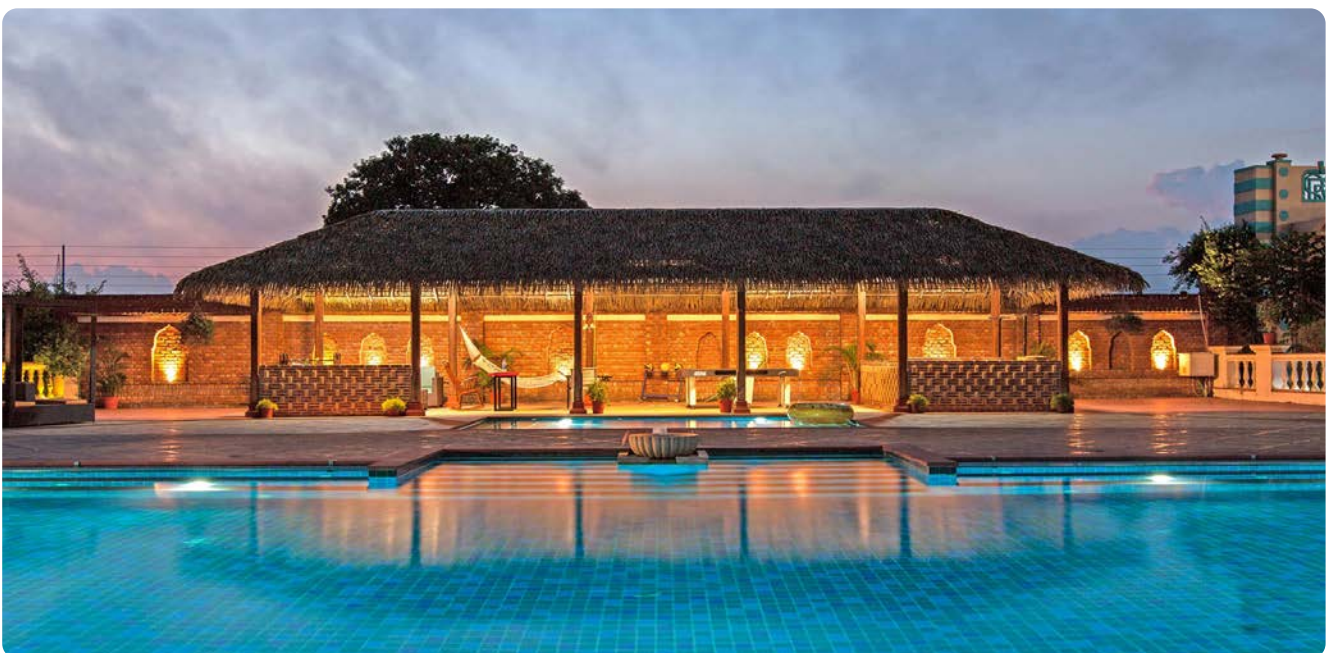
Swimming pool at Namaste Dwaar

Within view of the Taj Mahal, this hotel makes the most of its iconic views with a rooftop restaurant and swimming pool. It offers luxury accommodation with modern comforts.