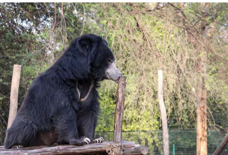
Humayun's Tomb, Delhi (top); Leopard, Jhalana Leopard Reserve (top); Palace of the Winds, Jaipur; Sloth bear, Agra Bear Rescue Facility (above)

The cost of the tour per person sharing is €4,488