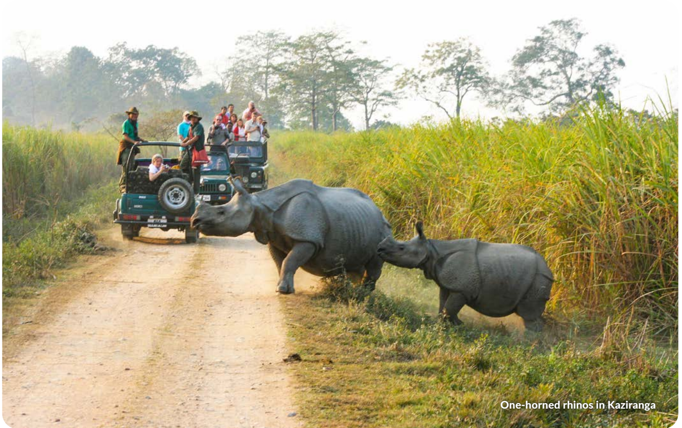
One-horned rhinos in Kaziranga