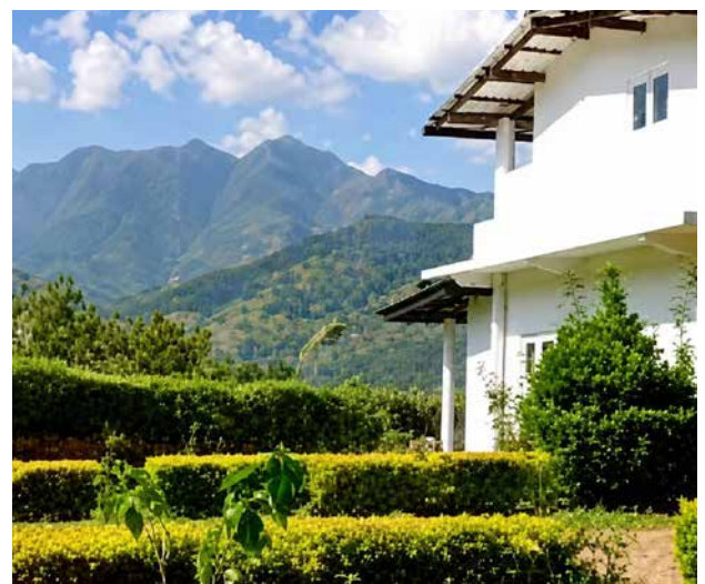
Amba Estate, Amba

A stylish beachfront hotel with a pool, sun loungers, and wellness facilities. Rooms are bright and tastefully designed. The restaurant offers an al fresco feel, complemented by sweeping ocean views.