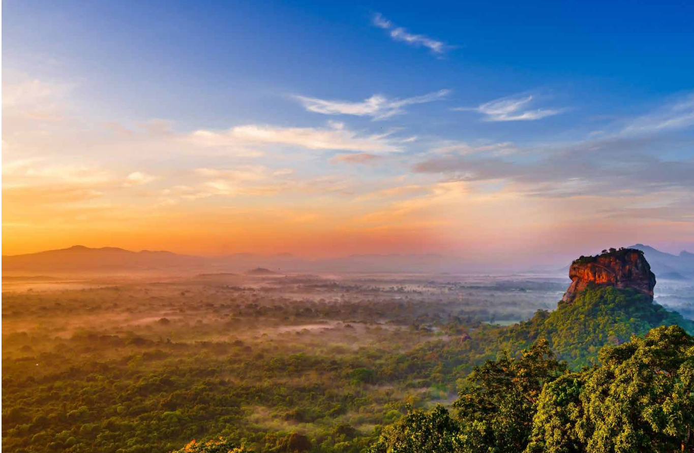
Sigiriya at sunrise