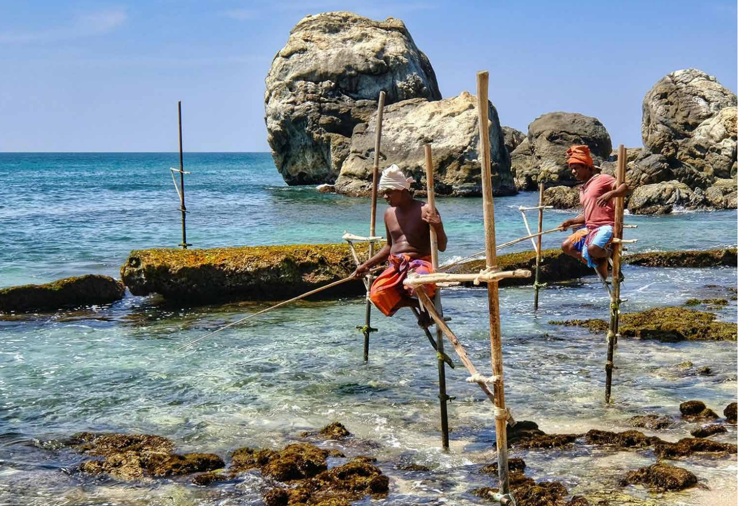
Traditional stilt fishermen