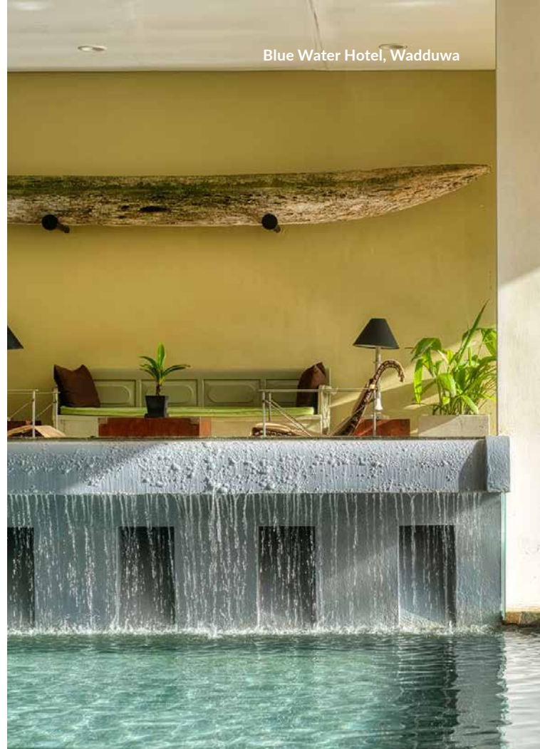
Blue Water Hotel, Wadduwa

Am: Pick up from the hotel and proceed to the airport in time for the departure flight.