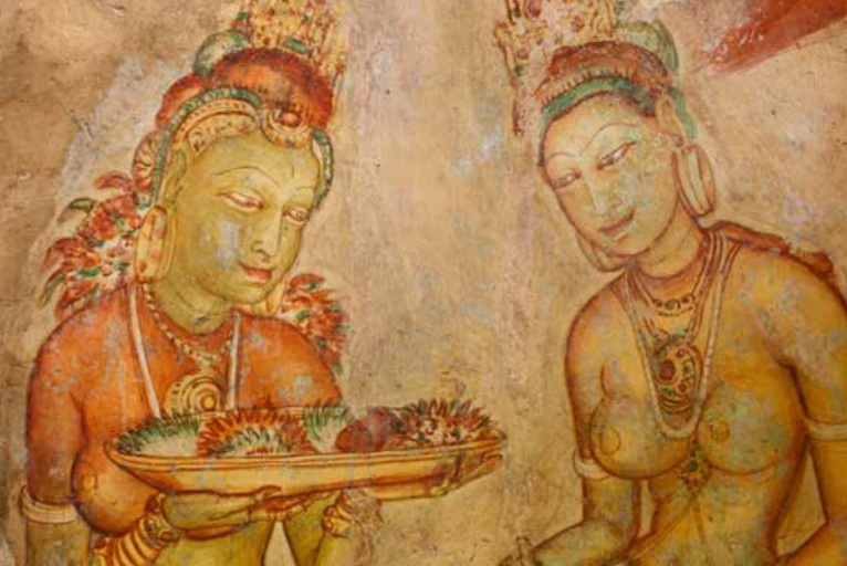
Celestial Maidens frescos, Sigiriya