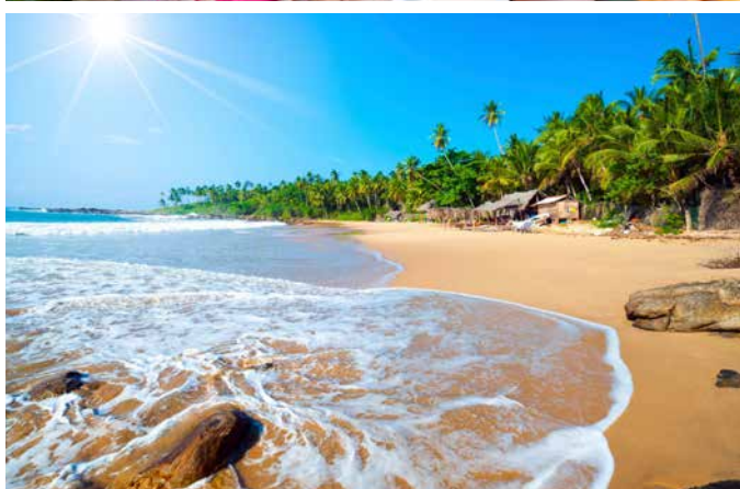
Golden buddhas Dambulla Caves, Kandy (top); Tea Plantation, Amba; Mother and child in market; Beach and Sun, Galle (above)