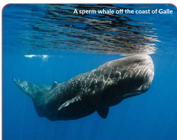
A sperm whale off the coast of Galle