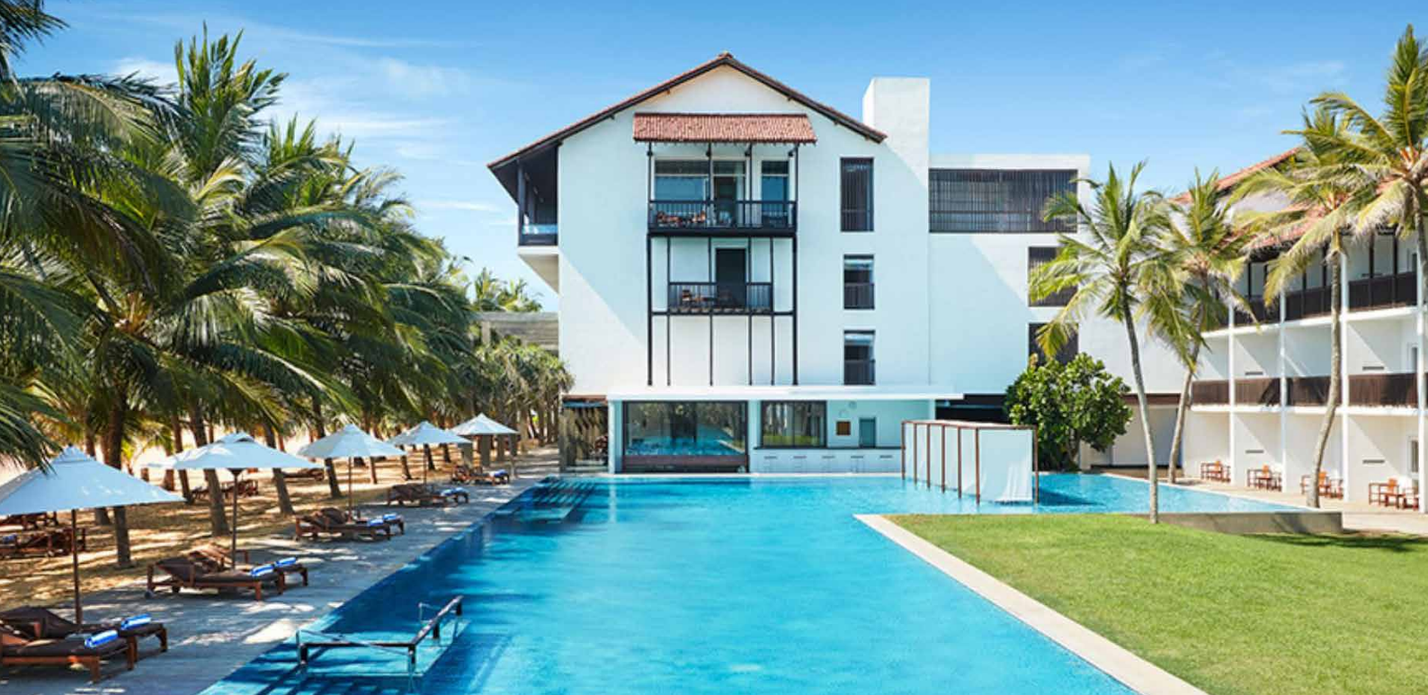
Jetwing Blue, Negombo