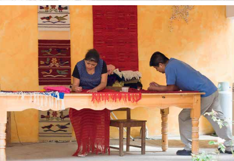
San Francisco Acatepec, Puebla (top); Santo Domingo Church rooftop and streets in Oaxaca; The ruins of Teotihuacan; Handweaving Zapotec style wool rugs, Oaxaca (above)

The cost of the tour per person sharing a double or twin room is $3,698