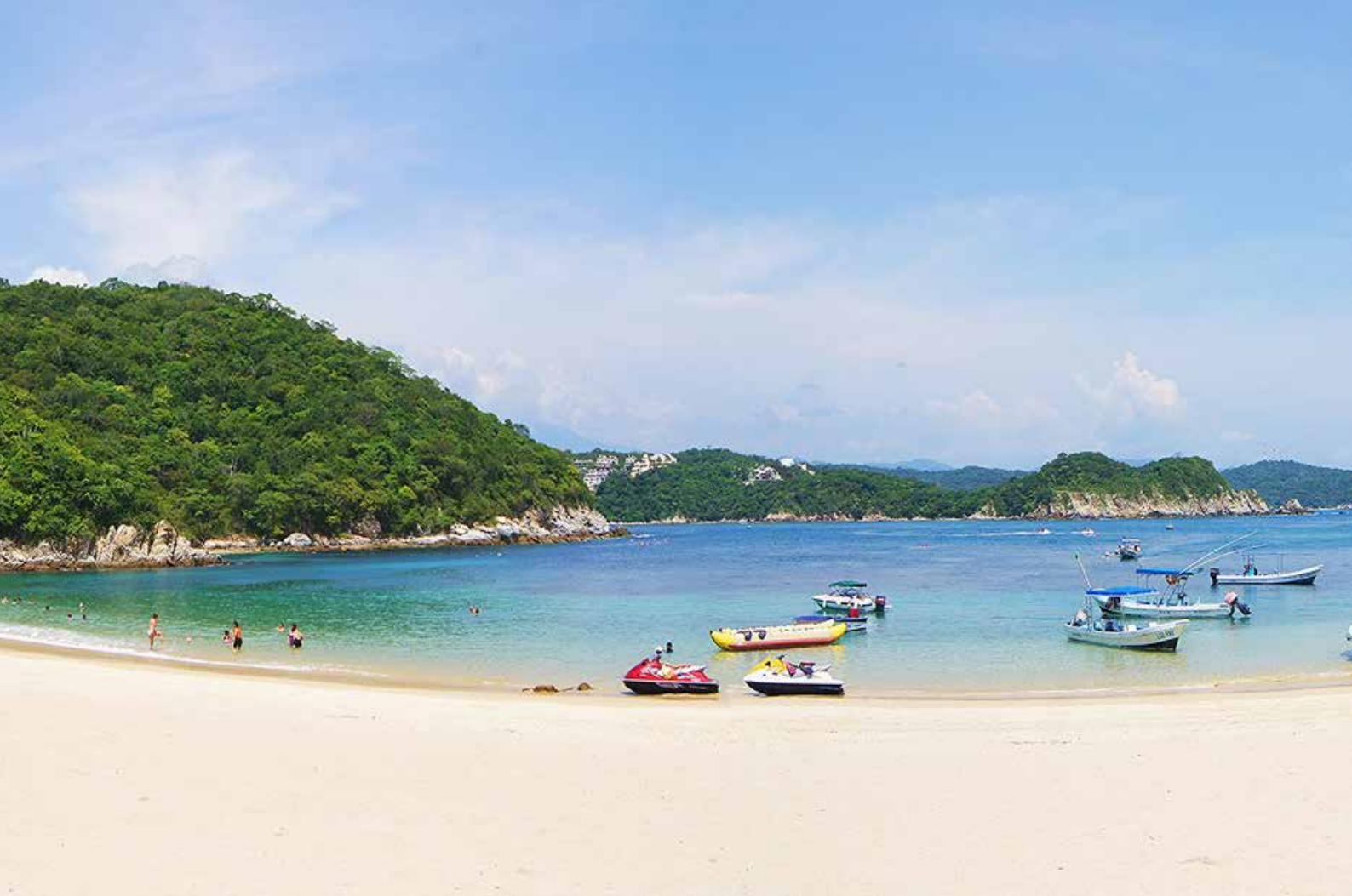
Santa Cruz Bay, Huatulco