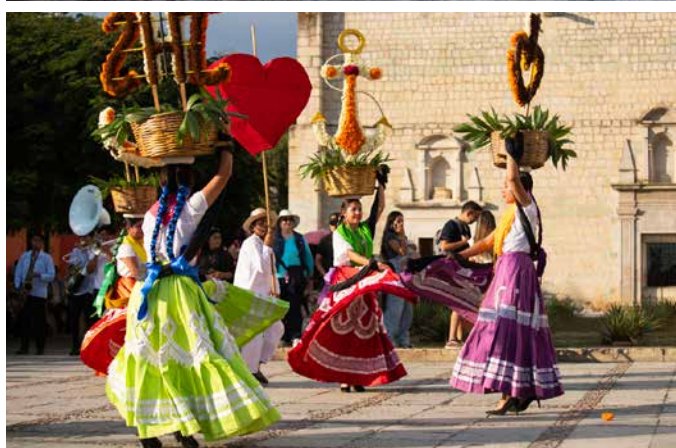
Colonia Del Carmen in Coyoacán (top); Santa Domingo Church in Oaxaca; Traditional food from Oaxaca; Folkloric parade and dance in Oaxaca (above)