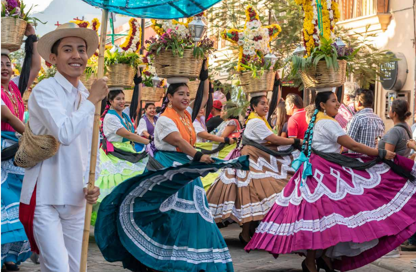
Traditional dress during a festival in Oaxaca