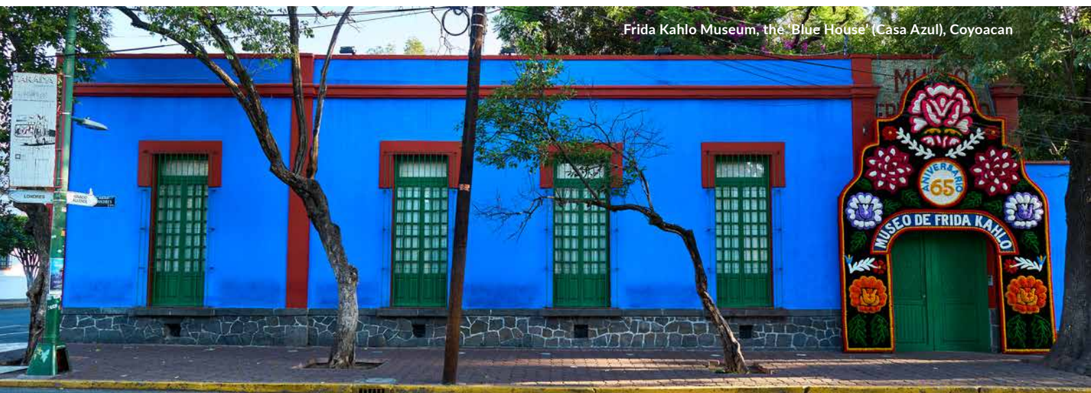
Frida Kahlo Museum, the 'Blue House' (Casa Azul), Coyoacan