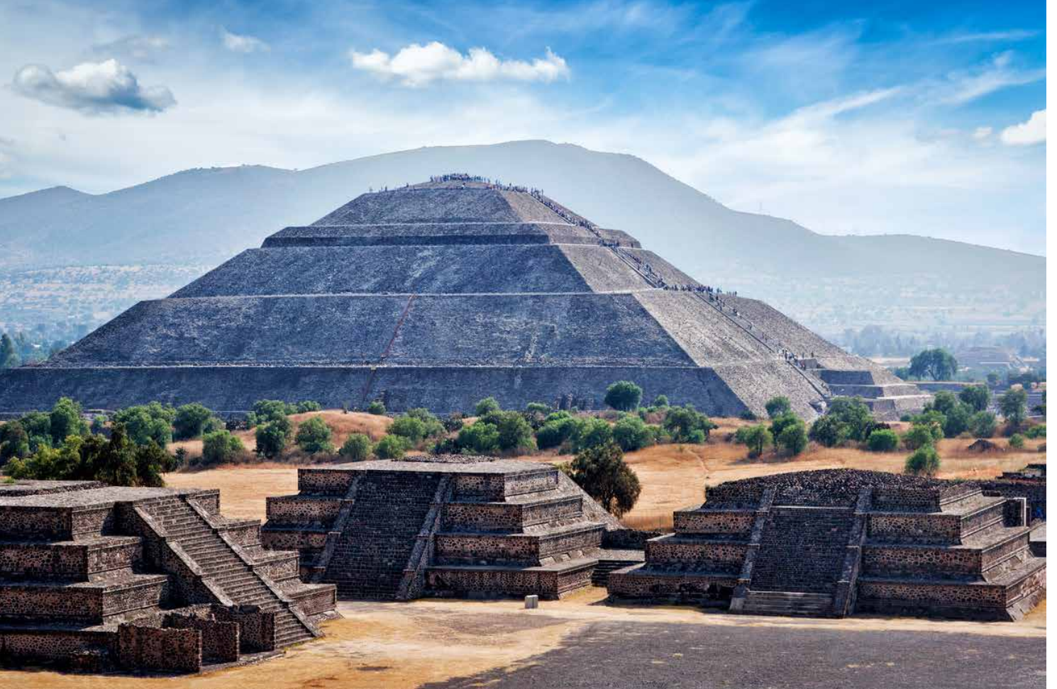
The Pyramid of the Sun, Teotihuacan

Journey through ancient civilisations, colonial cities and vibrant communities to uncover the spirit and colour of Mexico on this vivid adventure in the company of your fellow professionals.