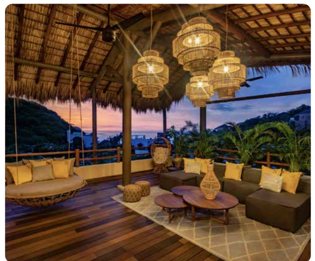
Lovely views of the Casa Bocana

A gorgeous beachside hotel with stylish rooms thoughtfully designed by local artisans. The excellent restaurant uses regional ingredients in creative and delicious ways, while the rooftop terrace offers sea views and signature cocktails. Guests can also enjoy the spa, swimming pool and generous outdoor spaces.