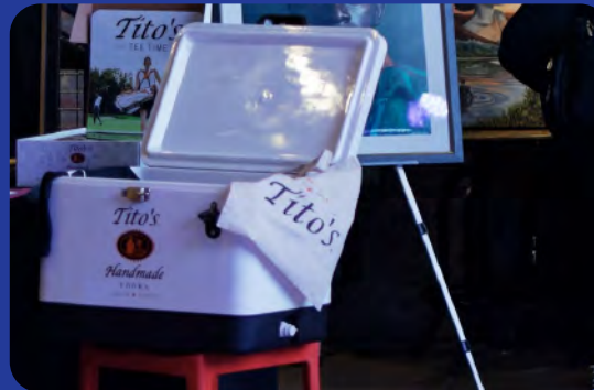
Product Placement Display