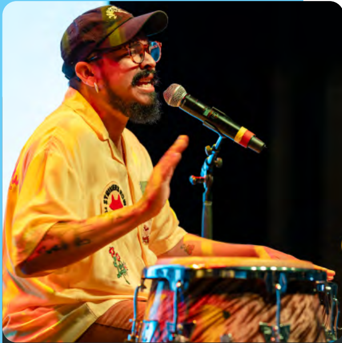
City of Big Dreams

As a sponsor, your brand will be prominently showcased to an engaged audience of art enthusiasts, changemakers, and community leaders. Sponsorship directly funds youth arts programming in underserved communities, amplifying your impact. Partner with The Simple Good to help spread positivity and inspire change through the transformative power of art and creativity!