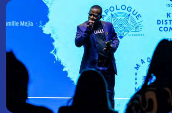
Main Stage Recognition