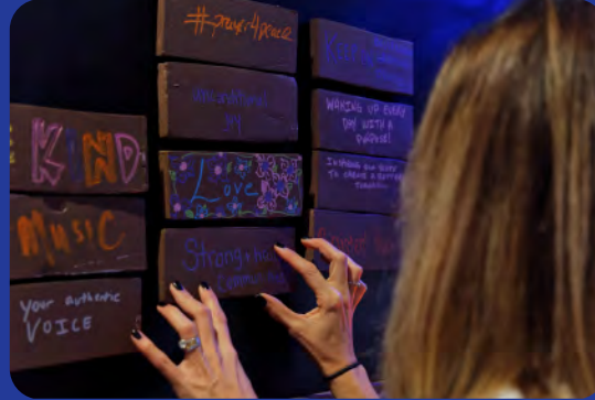
Interactive Brand Activations