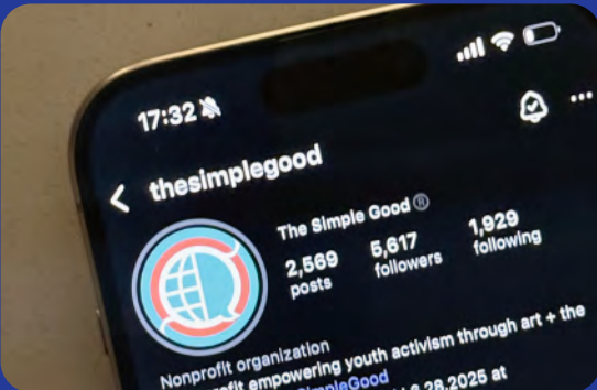
Digital & Newsletter Recognition