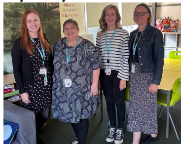
Our wonderful Wellbeing Team

Thank you for your ongoing support – it's been a very positive and productive term, and I'm looking forward to continuing this work in the new year. From myself and the Wellbeing Team, we wish you a very merry Christmas.