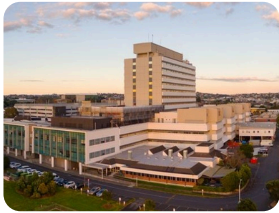
North Shore Hospital, New Zealand (Waitematā Health District)