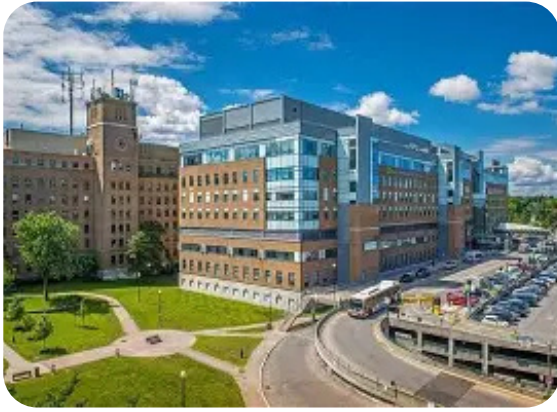
Sunnybrook Hospital, Toronto