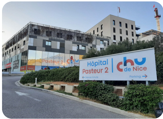
Nice University Hospital, France

Congratulations to Waitematā for becoming the first site to be activated in New Zealand — a fantastic achievement and an encouraging sign of the momentum building around the trial. Meanwhile, Middlemore Hospital is preparing for its upcoming site initiation visit, and Auckland is also planning theirs soon. Tauranga and Christchurch are actively working through the necessary local approvals to join the ROADMAP study. With these sites coming on board, we are hopeful to recruit our first New Zealand participant before the end of the year. Watch this space!