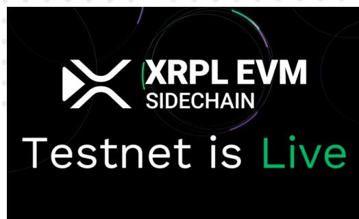
Peersyst announced the much-awaited XRPL EVM is now live on testnet – with interop provided by Axelar.