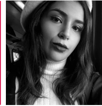
OMNIA SWEDAN Pumps Films, Egypt Four Tales of Love by Maged Atta