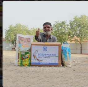
Food Package (Ration)