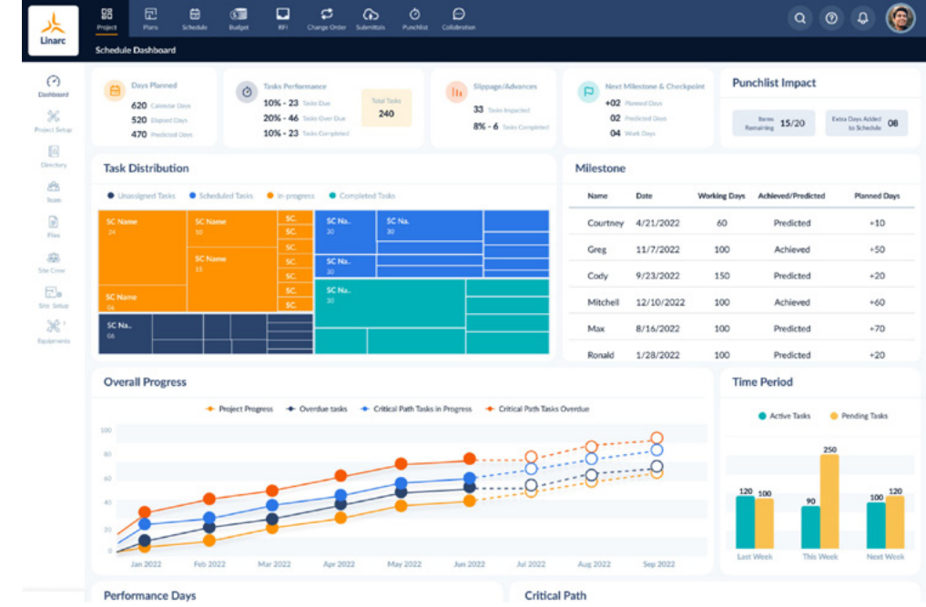
Schedule Dashboard

PE: How do you store and secure the collected data?