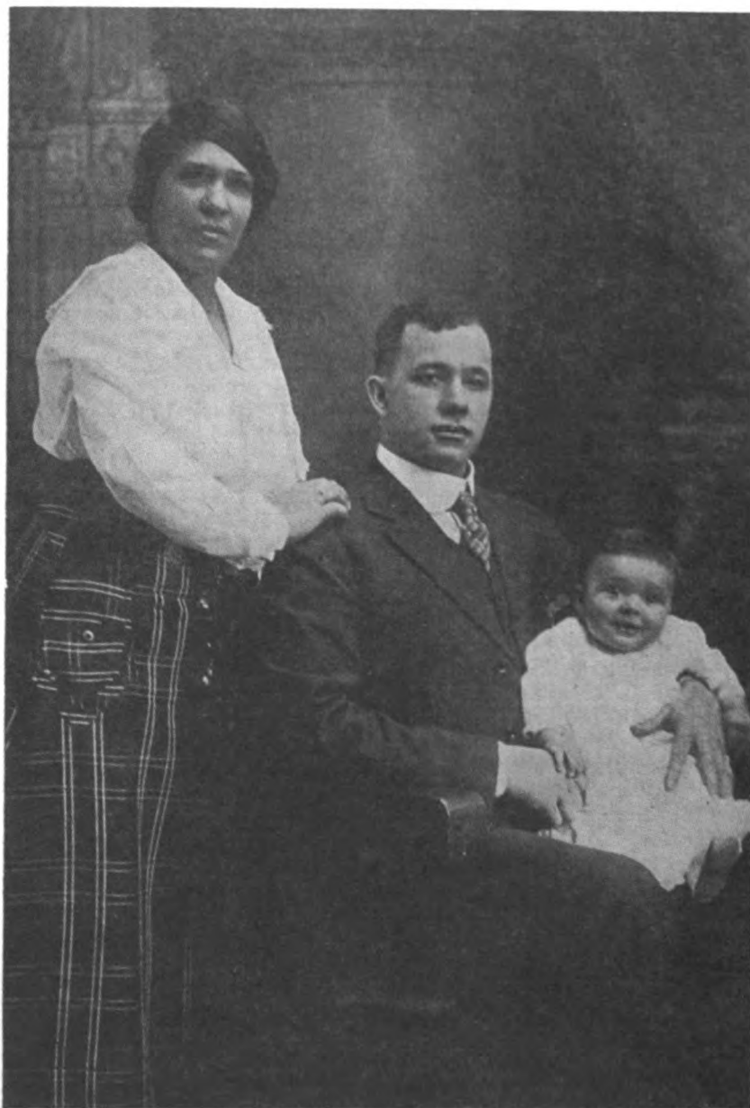
A MODEL FAMILY OF HEALTH AND INTELLIGENCE—PRODUCT OF PHYSICAL CULTURE