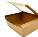
9"x 7"x 3" 1 COMPARTMENT BENTO BOX/WINDOW LID Total Volume: 100 oz sku VT-PBW-9X7x3-1C Qty: 200