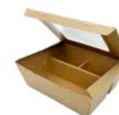
9"x 7"x 3" 3 COMPARTMENT BENTO BOX Total Volume: 85 oz sku VT-PBW-9X7x3-3C Qty: 200