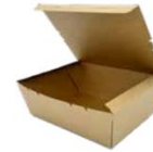
9"x 7"x 3" 1 COMPARTMENT BENTO BOX Total Volume: 100 oz sku VT-PB-9X7x3-1C Qty: 200