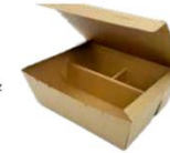
9"x 7"x 3" 3 COMPARTMENT BENTO BOX Total Volume: 85 oz sku VT-PB-9X7x3-3C Qty: 200