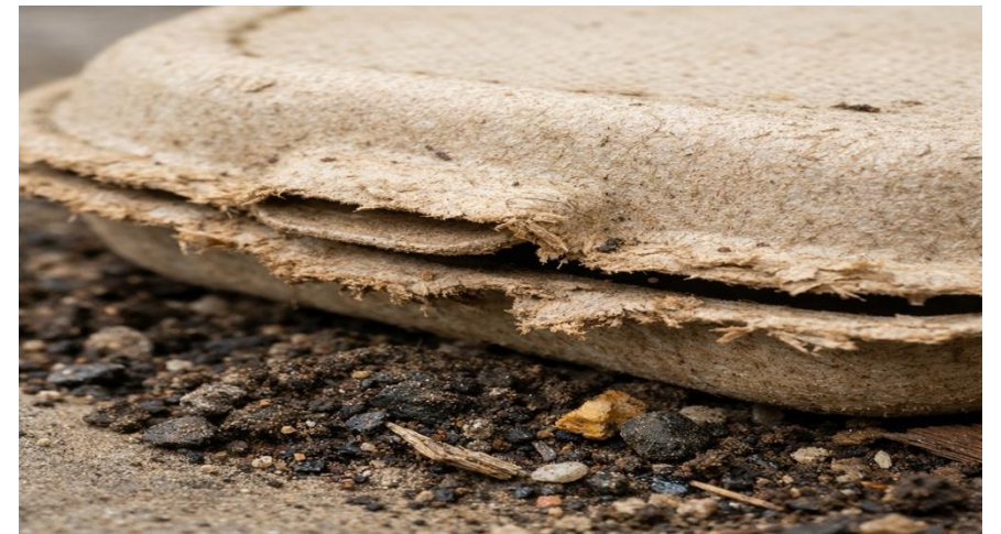
Real-world institutional food service — and material end-of-life under real conditions.