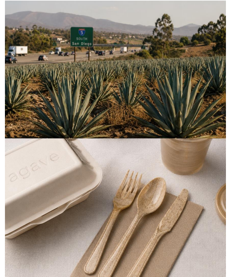
California agave fields — the source material behind our cutlery and cup platform.

Expand across departments, venues, or networks through US-sourced procurement.