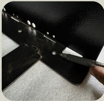
Marking of holes

8. Fasten all bolts, and ensure the drawers open and close easily.