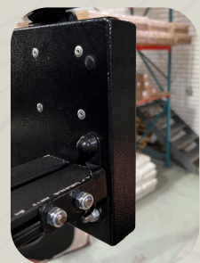
5. Mount shower

PLEASE DON'T HESITATE TO CONTACT US IF YOU NEED ANY SUPPORT REGARDING THE FITMENT. THANK YOU FOR YOUR SUPPORT. WE HOPE YOU LOVE YOUR QUICK PITCH PRODUCT.