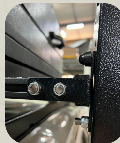
3. Tighten bracket