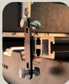
3. Bracket against load bar