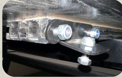
Hex Bolt in Load Bar slot

7. Measure the mounting surface with a measuring tape. Use the measurement to correctly space the low mount brackets on the tent.