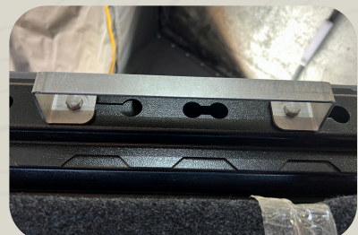
Ladder bracket fitted