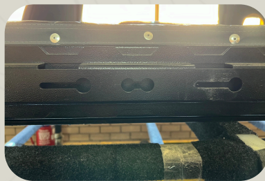
Accessory rail slots