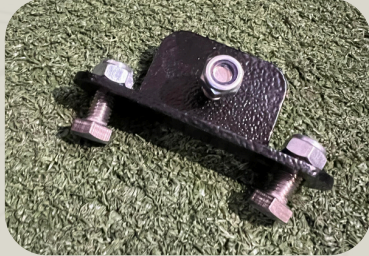
Low Mount Bracket

6. Open the (1) one low-mount bracket package and slide (4) four M8 hex bolts into the load bar slot on both sides of the tent. Insert the bracket onto the bolts and loosely tighten them (by hand).