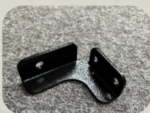
L Shape Bracket

4. Fastening of the brackets: Once the bracket is in place, fasten the bracket using the bolts provided and a 13mm spanner. When the bracket is fastened, use the small L shape bracket that is left from the main back bracket and fasten it at Position A and to the Rhino Rack.