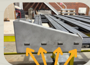
Slots in bracket