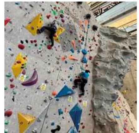
Passing the knot tying test allowed us to climb greater heights

The second day saw the CIS PI rise with not as much vigour and to be fair, we are surprised some rose at all, due to the fact not many could feel their arms. However, with brave faces and a rather to enthusiastic Boss, we left our accommodation and moved back to the climbing centre. The morning started off with most of the group passing the rope tying tests and becoming members of the climbing wall, meaning they could come climbing anytime they wanted and by themselves. A good success for our instructor.