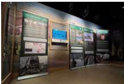
The British Army and Ukraine' on display inside the Museum

The team began the year with an exciting 'first' for the Museum, as we hosted a temporary exhibition alongside our regular displays. 'The British Army and Ukraine' came to us on loan from the National Army Museum in Chelsea and was displayed in partnership with our neighbours at the Royal Scots Dragoon Guards Museum. The display explored the historical context of the ongoing war in Ukraine and the ways in which the British Army is providing support, including through training provided by members of the Regiment as part of Op INTERFLEX. We were delighted to host a delegation from the Edinburgh Association of Ukrainians in Great Britain (AUGB) to view the display towards the end of its run. It was incredibly powerful to hear stories of Ukrainians who have settled in Scotland – both permanently and temporarily – and learn about the strength of their community.