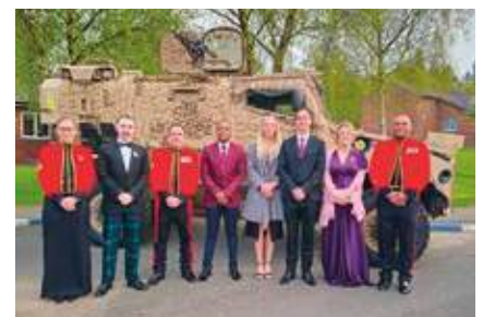
Beating The Retreat 2024