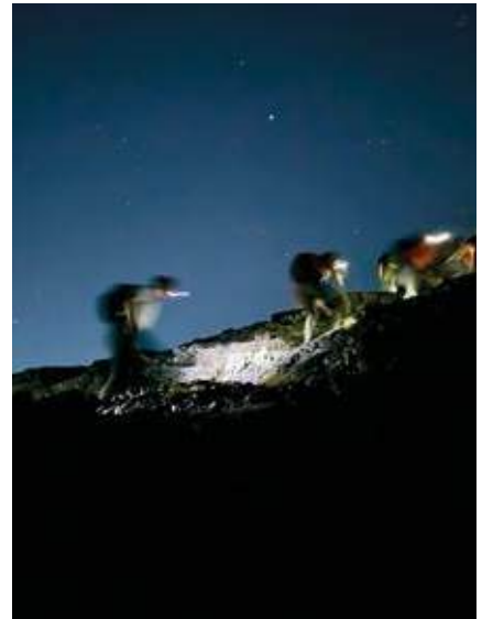
A very early morning on the ridge