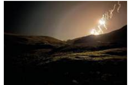
Mortar illum fire in Otterburn

The Mortar Platoon started off the year holding its annual cadre, split between Strensall and Salisbury Plain, where a number of fresh-faced newcomers were exposed to skills of mortaring for the first time. Utilising a strong cohort of NCOs for instruction throughout, the platoon were put through their paces for two weeks in Strensall camp prior to deploying on a self-sustained dry exercise and live firing package in Salisbury Plain. Salisbury Plain saw the platoon taking part in testing dry serials and the dreaded 'heavy carry' (complete with the essential BBQ afterwards), we then moved onto a comprehensive live fire package with emphasis placed on speed and efficiency of our mortar skills. At the end of the cadre, Hldr Watts was deemed the top individual on the mortarman cadre and LCpl Lund awarded top individual on the executives cadre.