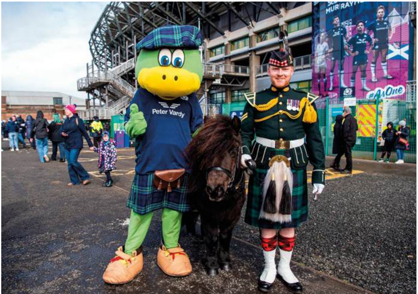
Cruachan and SRU Mascot

2024 was a busy but interesting year for Cruachan and trustee companion, Nightcap, as we travelled all over the UK – from Stornoway to London and all the places in between.