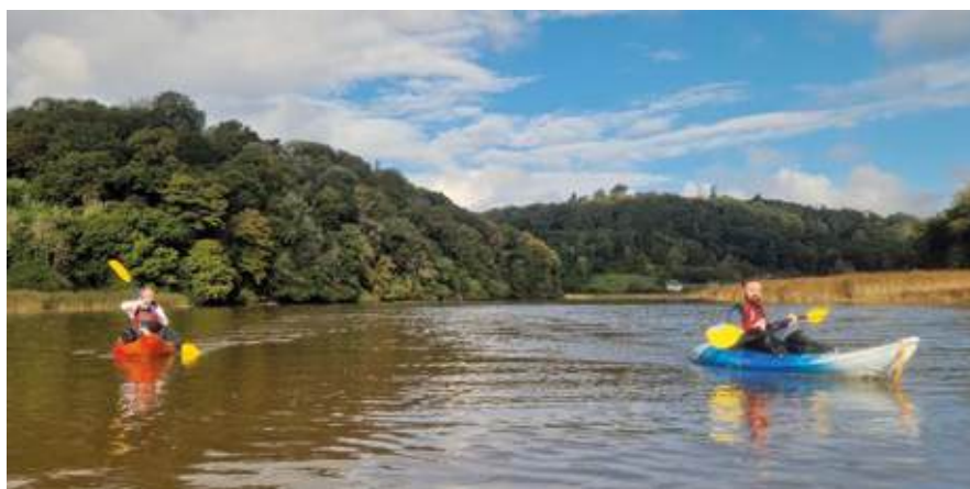
Two members of HMS VICTORIOUS Ship's Company kayaking on the River Tamar