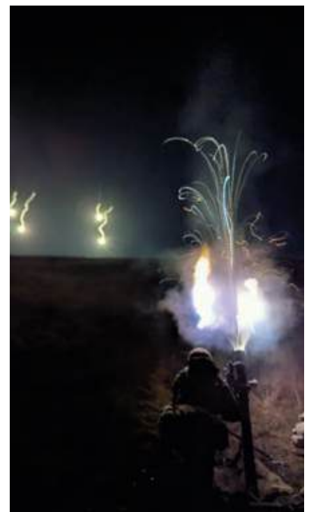
Mortar night fire again