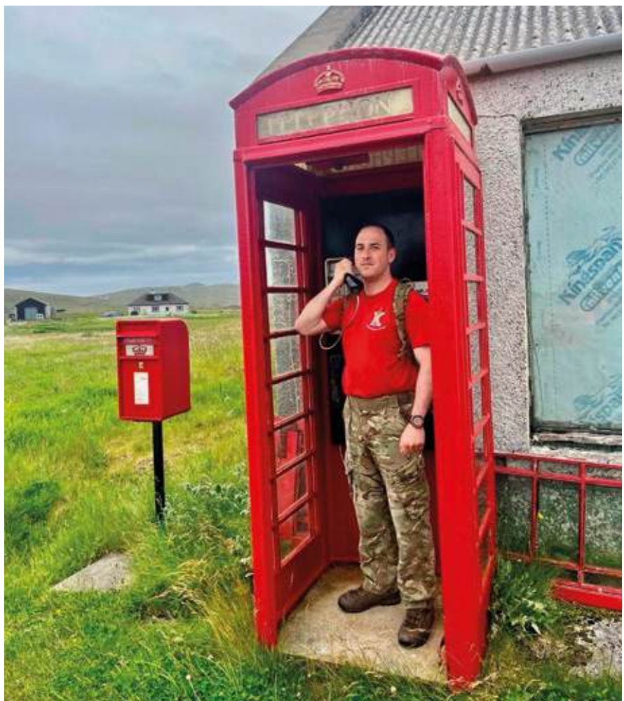
2PI Uist Speed March Calling for a lift