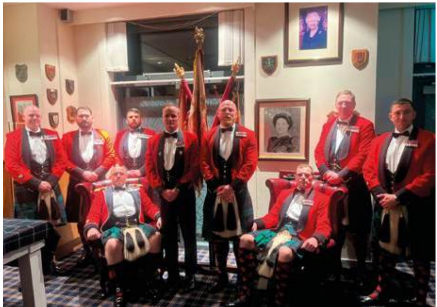
2 SCOTS Warrant Officers – COs Dine-In 2024