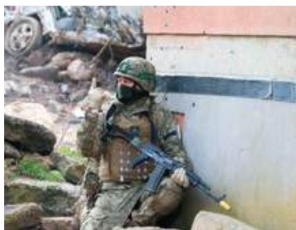
Time to go up...

Although the Army provides almost all the UK training staff, instructors, and HQ staff for Op INTERFLEX, it is nothing without the Ukrainian command element and the interpreters. Most of the Ukrainian command element are commissioned officers (normally Capt – Lt Col) and are from the same unit or cap badge as the students at that specific UK training location. These commanders are deployed from Ukraine to assist with maintaining discipline, making tweaks to training delivery, advising the Op INTERFLEX commanders on Ukrainian doctrine and tactics and ensuring that there is always a Ukrainian voice in planning the training. They are critical to success, and we were lucky enough to have four different commanders during our time on the Op. Two from the National Guard and two from the Border Guard, all officers that both Coy HQ and the instructors had a great relationship with and fond memories that will last a lifetime after sharing many close-knit discussions and conversations.