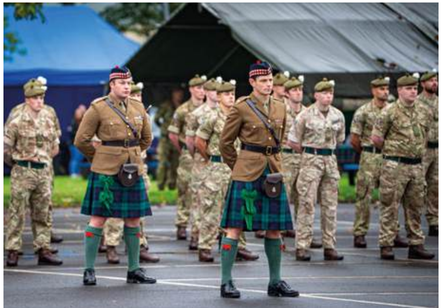
The Clansmen on the Assaye Day parade

Whilst not deployed the Clansmen spent the remaining time before Christmas leave conducting training in preparation for the Battalion's exercise in early 2025. The Jocks enjoyed the opportunity to conduct individual training on medical skills and navigation and spent some time at Barry Buddon and Kircudbright completing their live fire preparation from static shoots up to platoon attacks at night. In November a team of eight, travelled to Brunei to take part in the Brunei Jungle Warfare Skills Meet, a jungle patrolling competition, achieving a gold medal after three weeks of very hard work.