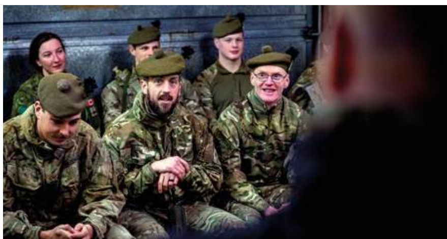
Capability demonstration prior to training in Oliver Barracks