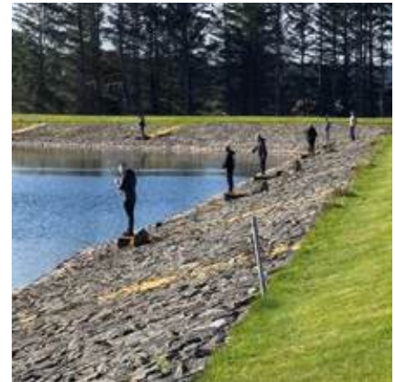
Practical instruction on the reservoir