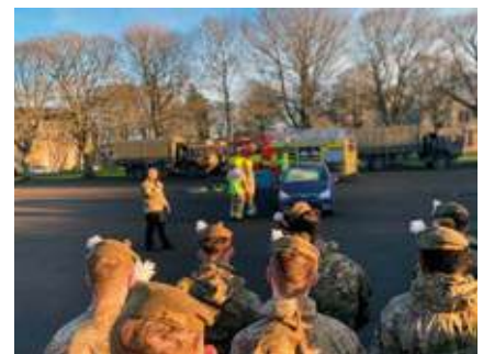
Winter Driving Awareness Training