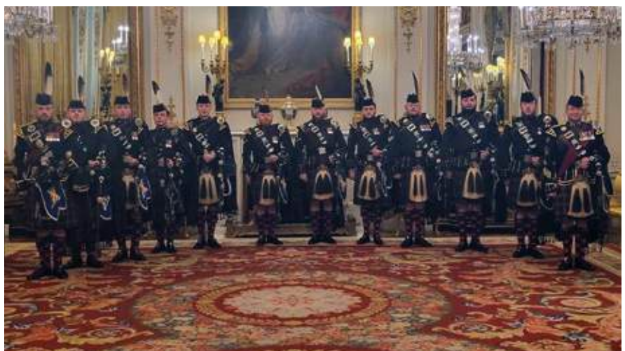
4 SCOTS Pipers at Buckingham Palace – hoping the Drummers don't find out about the photo

and achievements leaving a lasting impression on audiences across the UK and beyond. We now look forward to next year playing at the Basel Tattoo, Royal Edinburgh Military Tattoo and our Battalion move to Cyprus that will open new opportunities to show our ability as a band.