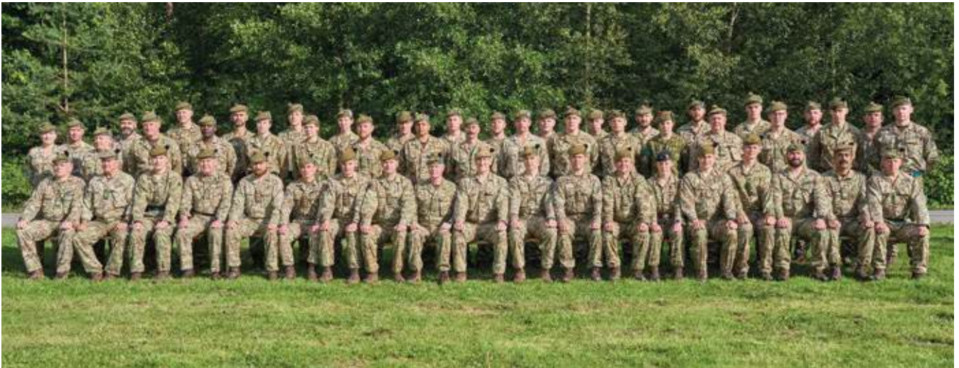
The 7 SCOTS Team