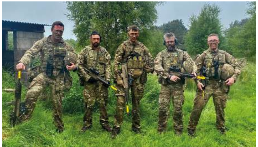
HQ Coy troops on exercise at Barry Buddon

For many, it is easy for these articles to blur in the mind year on year but for the individuals involved the experiences, events and activities undertaken can be poignant and a significant mark in life. The source of many a future dit. The Army has been busy, 7 SCOTS have been busy. Our people have made 2024 happen and this is an ample opportunity to reflect on the excellent achievements of those individuals.