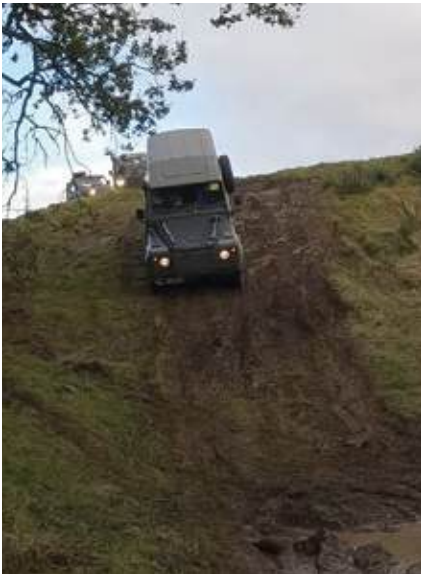
Mud Master, downhill Dvr