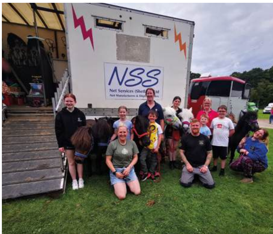
The Clothie Team

Show wise, we unfortunately didn't place in the Royal Windsor Horse Show 2024; however, both Cruachan and Nightcap did extremely well at The North of Scotland Welsh Pony and Cob Association Show. Most notably the ponies' performance at the Turriff District Show was admirable and both boys came away with multiple ribbons, including Cruachan with a 1st for Gelding Any Age, and Nightcap with 1st for In Hand Diamond Veteran Ridden. Nightcap also qualified for the Veteran Horse Society Regional Finals! None of these shows would have been possible without the help and the fantastic company of the Clothie team as always!