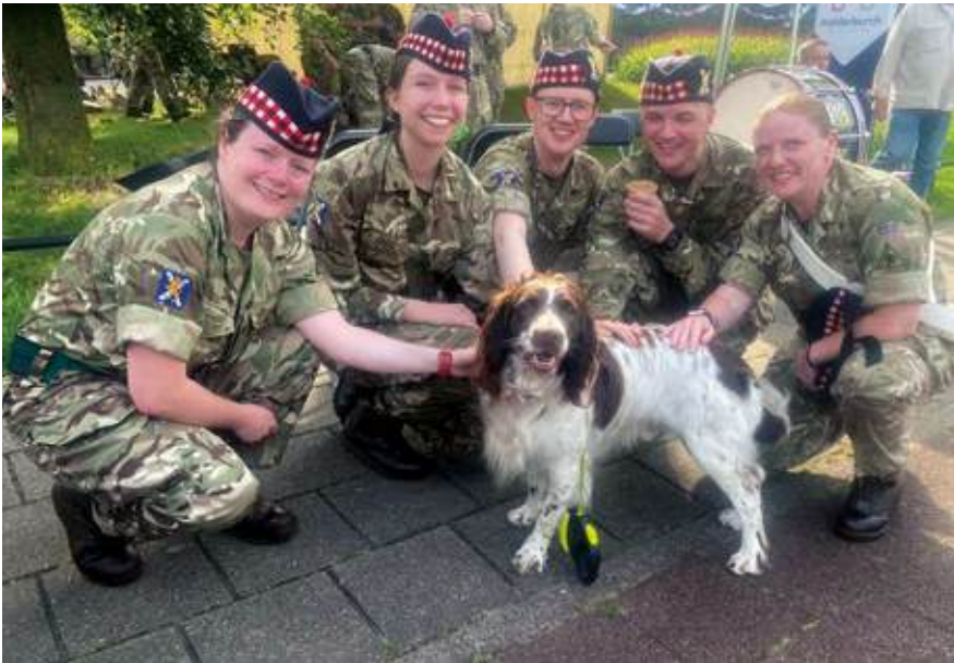
The band's new mascot

day of walking. The final day of the event culminated with a 4km march through the streets of Nijmegen. The band also found time to visit a local retirement home to provide some welcome respite and entertainment for its residents and staff.