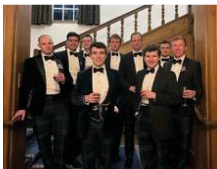
SCOTS in the south

The Officers' Mess has been in the finest social spirit in recent times, with regular mid-week and weekend events and both domestic and international trips away. The Mess began the year by descending in mass on the 'Scots in the South' Dinner in the Inns of Court in London, ending with the Adjutant leading the post-reels soiree to Stockwell.