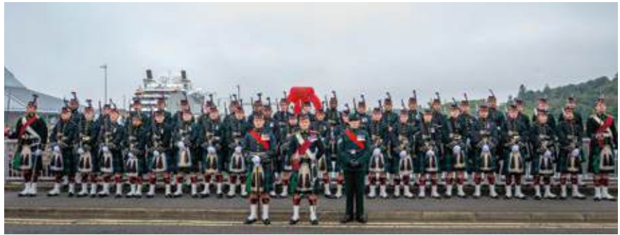
Freedom of the Western Isles, A Coy post parade at Stornoway harbour