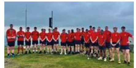
A Coy Pentland gate to gate run