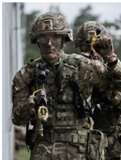
The BG Urban Attack well underway