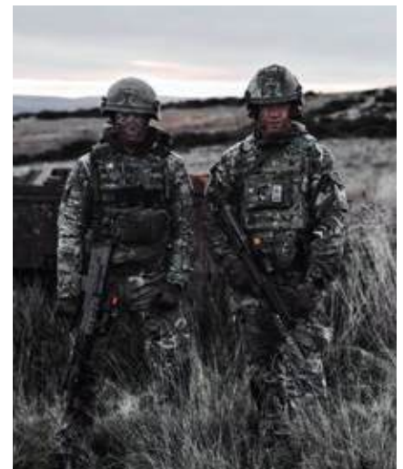
OC and CSM during Ex HECTORS MARAUDER 2 at Warcop

The Company then moved swiftly to Otterburn. Live firing played a significant role this year. Deploying on five separate live fire packages, including two Bn Battle Camps (Ex HECTORS MARAUDER 1 and 2), it was about being comfortable with Platoon and Company black night attacks. An often-under-utilised training mechanism, this was a deliberate plan to make soldiers more accurate and effective by increasing the frequency of live training. This will continue into 2025 with a focus on incorporating more physical and mental stressors to shoots to better replicate battlefield challenges.