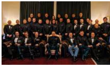
Mess members and guests at St Andrews Dinner Night