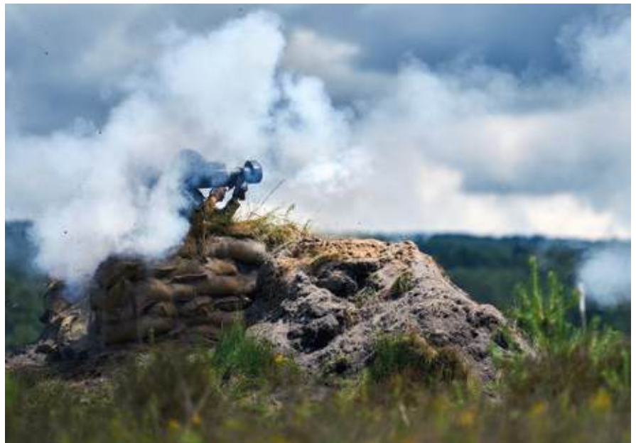
Pte Smith on the ASM

There is a lot of opportunity in 2025 for HQ Company. Continuing the current trajectory is the ambition: recruiting and training new soldiers, progressing careers through demanding training and courses to continue building collective capability.