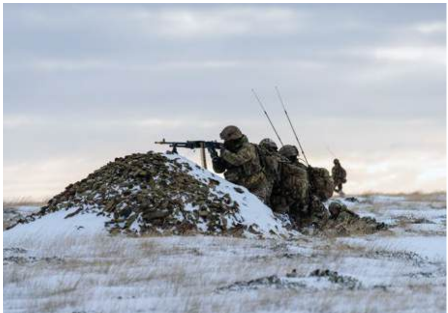
The attack onto Goose Green ramps up