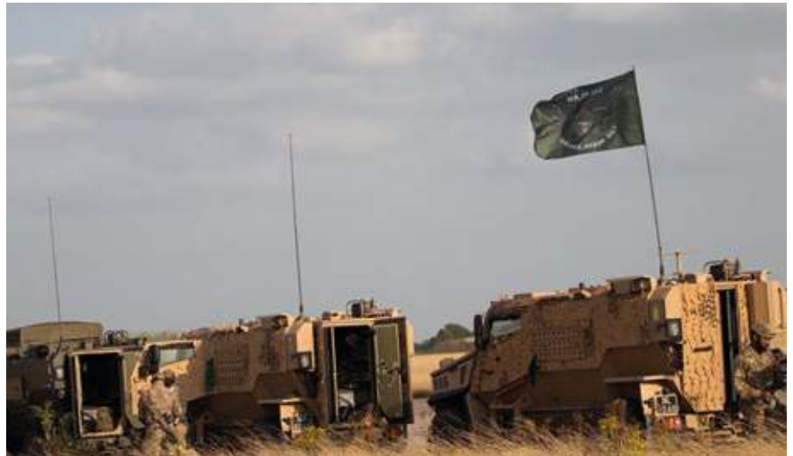
The Clan leaguer, Cottesmore, Ex HECTORS STORM

Ever flexible, Delta Coy transitioned in May from cam cream and webbing to bulled brogues and spats and journeyed Northwards to receive the Freedom of Aberdeenshire on behalf of the regiment. A sterling time was had by all as the Battalion marched with colours flying and bayonets fixed through Peterhead, Laurencekirk and Aford, with the Jocks being extremely well received by the locals who turned out on mass to support the Battalion as they marched. Charitable efforts were made prior to some stand down with a 6-man team from the Clan taking part in the Army Benevolent Fund's Cateran Yomp Event, a 55-mile tab in under 24 hours in the Cairngorms to raise money for the cause that does much to promote and support the welfare of service personnel and families in the UK. A nice change from a typical tab, Delta Coy's team enjoyed beautiful scenery, a plethora of weather systems and particularly the haggis, neeps and tatties stand that the ABF had set up halfway around the course. This did much to fuel them on to the finish and the Clansmen came in under the 24hr cut off time, winning the coveted gold medal distinction standard.