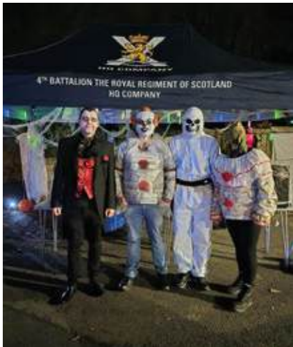
The Welfare Team First to the "Fright" on Halloween

As the year moved into the Autumn, the team geared up for the annual Halloween Party, collaborating with the AWS Community Support Team and other units across the Garrison, everyone pulling their resources and creating a fantastic night of sweets, frights and fun. The team all dressing up and making the effort to give the kids as spooky a show as possible.