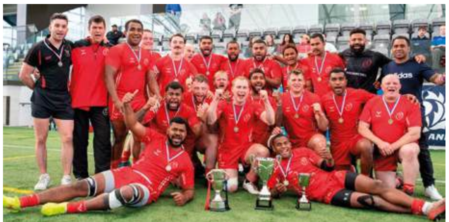
Army in Scotland celebrating their Scottish Inter Services victory.