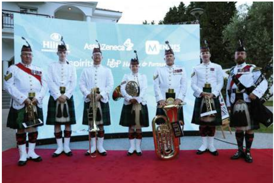
Brass Quintet performing at the King's Birthday Parade in Montenegro

For many band members, this was their first opportunity to perform in Germany at Christmas time and this experience, alongside the hospitality of the German people, made it a memorable end to the year.