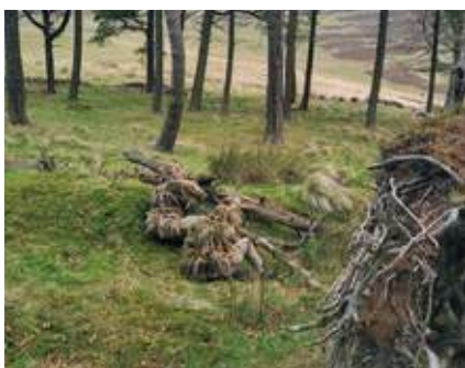
Another pair on task...