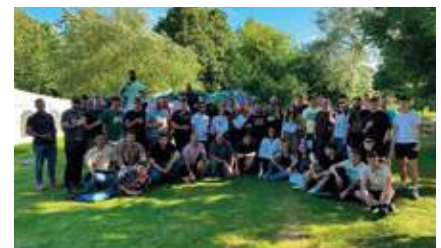
The extended Clansmen team

As we were delivering the battle courses, these are NCO heavy, and due to the PCBC being 11 weeks, there was significant crossover of courses. We essentially needed five platoons, and as per most Infantry subunits, we only have three, this created the need to request backfill from our Brigade HQ. Throughout the near six-month deployment, we had assistance from all the Coys in 2 SCOTS and another eight cap badges from both the regular and Army Reserve.