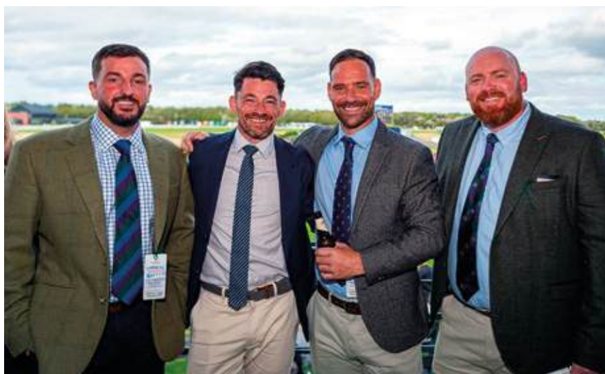
SCOTS Association members enjoying race day