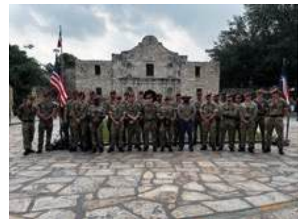
Charlie Company at The Alamo for their guided tour