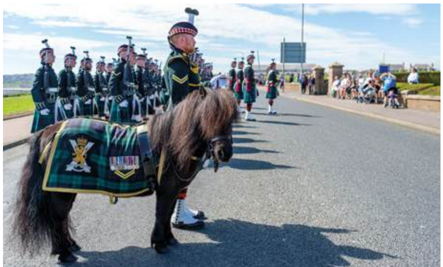
Receiving the Freedom of Aberdeenshire – Peterhead

We attended the Women's 6 Nations, Scotland V England match, and the Men's Autumn International, Scotland v Australia, at Murrayfield Stadium. On both occasions we greeted the teams upon their arrival. Cruachan also met with spectators in the fan village and the Scotland team Mascot.