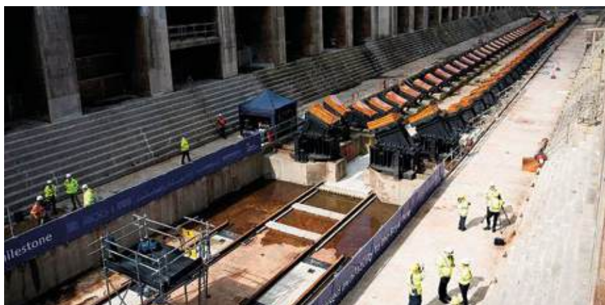
An empty No 9 Dock in HM Naval Base Devonport – home for HMS VICTORIOUS for the next few years whilst conducting her Deep Maintenance Period