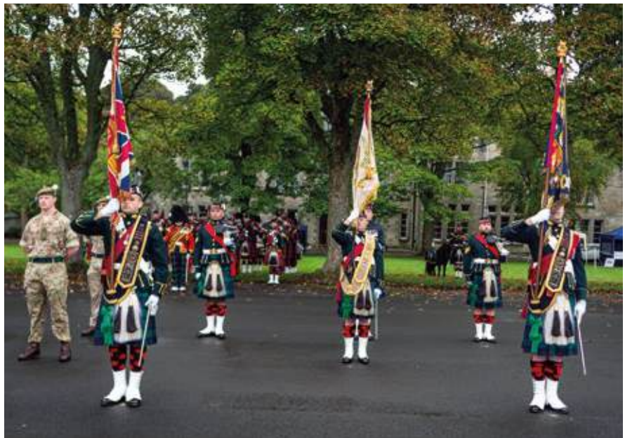
The Colours on parade

On completion of these tasks we thought we would have a little bit of a quieter time over the summer and into November, but the UK Standby Battalion activation kicked in and off we went again at very short notice, showing all the qualities of the Battalion and demonstrating our effectiveness to react and to support the UK. The deployment was short, but the QM's Dept worked all day (and night actually) to procure mission critical kit for the Battalion.