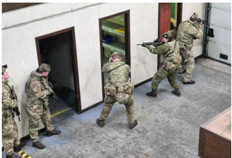
Dry run through entry drills

7 SCOTS Annual Deployment Exercise (ADE) saw D Coy personnel deploy to Germany on Ex RHINO HEART, the largest Army Reserve deployment in over 40 years as part of a formed 19 Light Brigade. This provided an excellent opportunity for the troops to experience operating and working with NATO partners from Germany and USA. The pace of the exercise was demanding from the start, and the troops were fully tested through a series of insertion marches and long hours on task. As always, the "GALLUS JOCK" shone through and once the troops got used to the rigours and demands they showed their mettle and more than held their own amongst other units in the Brigade. The opportunity to deploy overseas can only be a retention positive factor and an essential component for gaining experience for every rank within the Coy.