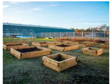
The green fingers project thus far, due for completion and ready to start growing NLT Mid Feb

At the time of writing, the project is nearly 80% complete with fruit trees planted, vegetable plots built and ready for planting. All that is left to do is for the plastic wrap to be put around the poly tunnel and install the automatic watering system.