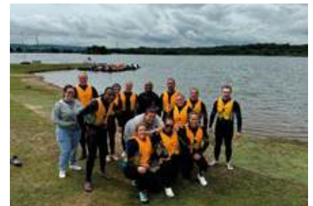
North Yorkshire Water Park