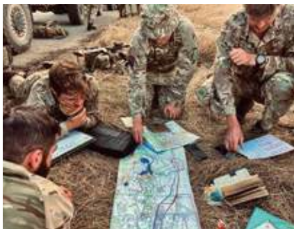
CHQ and PI HQ ROC drill – Ex HECTORS STORM

selected as Break-In Company – Grenadier Company being renowned as elite assault and shock troops and at the heart of siege warfare.