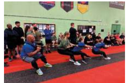
Sports day Gaza Barracks