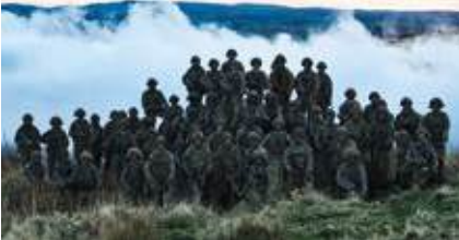
HECTORS MARAUDER 2 – A Coy at Warcop