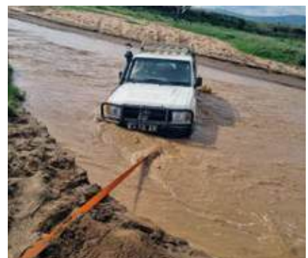
BATUK motorsport club conducting river crossing on Eastern Laikipia Training Area