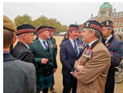
SCOTS Veterans catching up before the parade