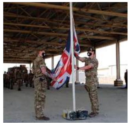
Highlanders Dow and Cairns lowering the union flag in Camp Qargha, November 2020

presentation items relating to the bestowal of Freedoms in the Western Isles, North Lanarkshire and Moray, correspondence from King Charles III and an example of the new PT kit issued to members of the Regiment.