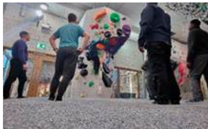
The team started off small to learn the basics

The first port of call for the team was the bouldering wall, this was to be the warm-up and introduction for the team. Despite the warnings from the more experienced members of the team that climbing is a marathon not a sprint, the team attacked the bouldering wall for 2 hours with gusto and vigour.