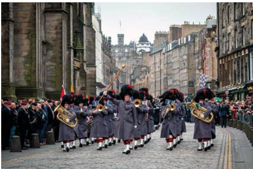
Remembrance Parade Edinburgh