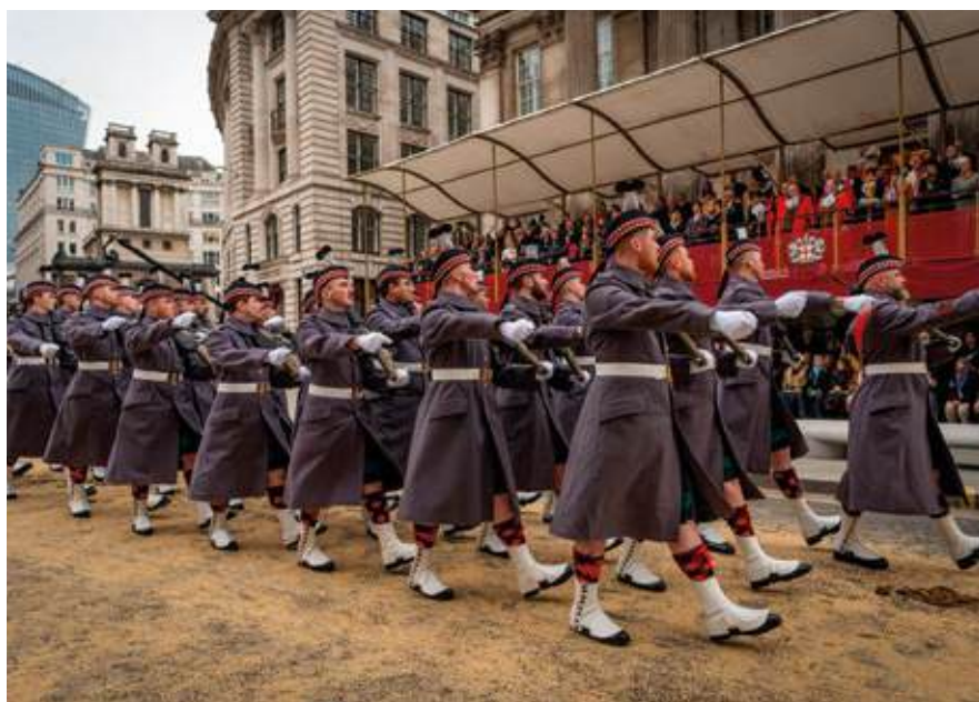
BKA Coy parading at the Lord Mayor's Show