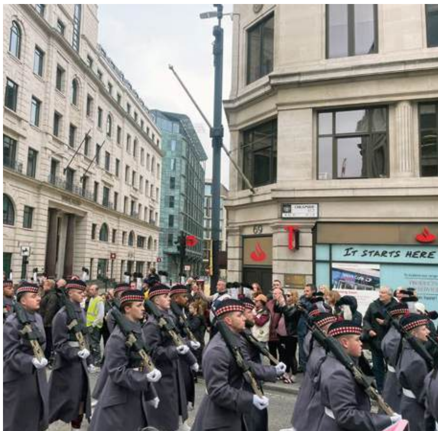
BKA Coy parading in London