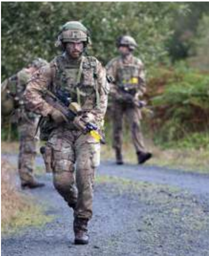
LCpl Ranking moving to the FUP, Ex HECTORS STORM