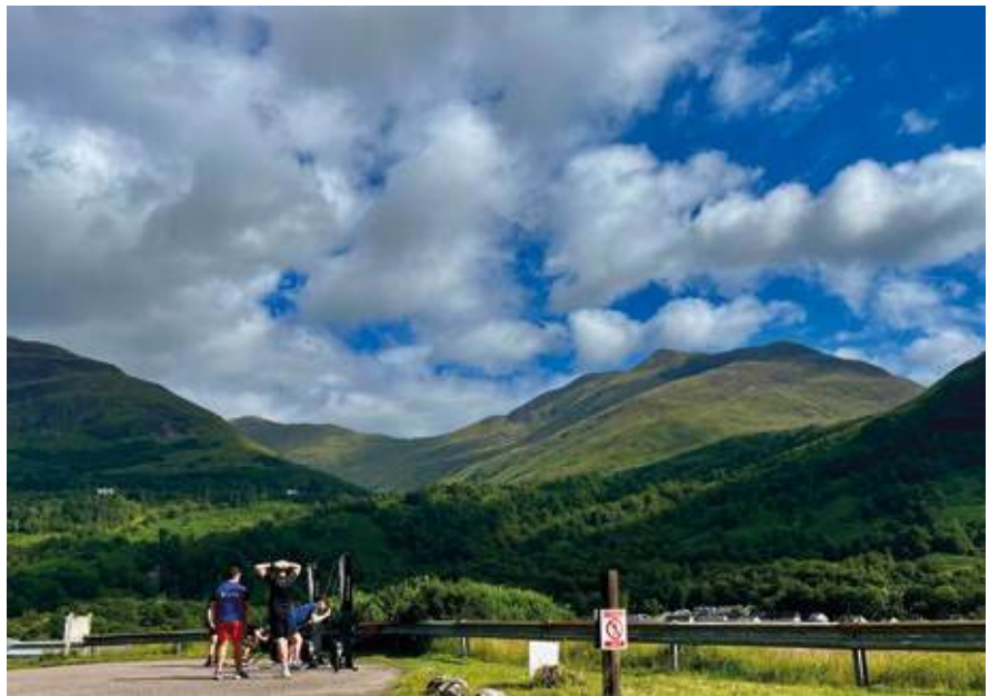
Human Optimisation Week PT

Throughout the year Highlander Optimisation provided a real opportunity for our soldiers and NCOs to learn and develop on several fronts. Cooking lessons were delivered by chefs, standard learning credits were used for mental health first aid and nutrition courses, and 2 Platoon planned and completed a 52-mile and 890m of ascent across Uist with 10Kg in 23hr 19 min. The Company was well represented in every 4 SCOTS challenge activity and, when combined with the focus on human performance, results became noteworthy. All four members of 4 SCOTS winning team at the PARA'S 10 in Sep were Alpha Company, and the Charles Morpeth (4 SCOTS cross country competition) in Dec was a catastrophic success for Alpha – testament to our soldiers will to endure and win.