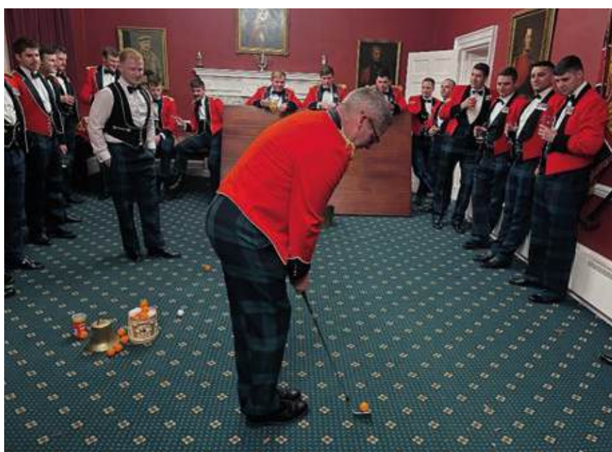
OC HQ Coy showing the young team how it's done

Following summer leave the Bn deployed on Op INTERFLEX and whilst