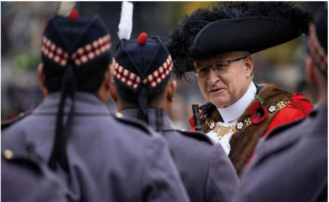
The Lord Mayor of the City of London, Alistair John Naisbitt King, greeting BKA Coy

BJA Coy, 5 SCOTS received the Associated Status of the City of London on behalf of the Regiment as part of the Lord Mayor's Show when they provided the Colour Party and Guard of Honour and led the parade through the streets of London along with Band SCOTS, 4 SCOTS Pipes and Drums and Corporal Cruachan IV.