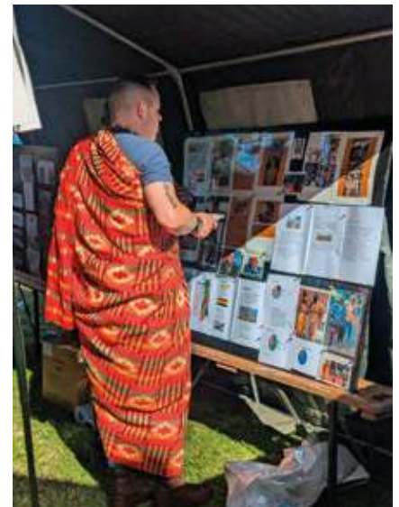
The RSM soaking up some culture at the Highland Games Cultural Stands

On the Battalion's "Tour of the North" the Welfare Officer took the opportunity to get into combats and conduct some community engagement and some