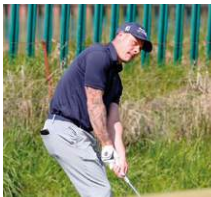
Infantry Golf championship