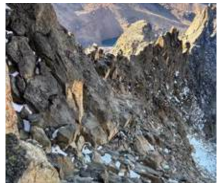
Lt Col John House during a (successful) climb of Point Batian, the highest peak of Mount Kenya

There is rarely a dull day in Kenya with floods, droughts, wild animals, and high-profile visitors all keeping us on our toes! Working hours at BATUK are very fluid depending on the training programme and exercises, but those who are assigned for 6 months as Temporary Duty Staff, or Permanent Staff very rarely do not enjoy their time with BATUK. Work hard, play hard, remains the BATUK approach, and Kenya offers a multitude of opportunities for sport, adventure training, community engagement and personal travel opportunities. It also remains an excellent overseas assignment for those with families. Whilst expectation of Amazon Prime delivery time needs managing...this is absolutely offset with local safari lodges, trips to the coast and children hand feeding giraffe/rhino.