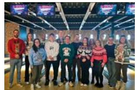
Christmas Function 2024