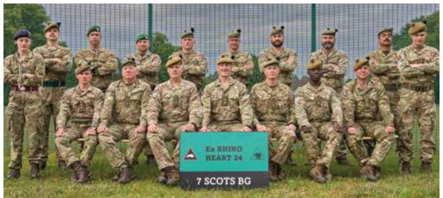
The BGHQ Machine