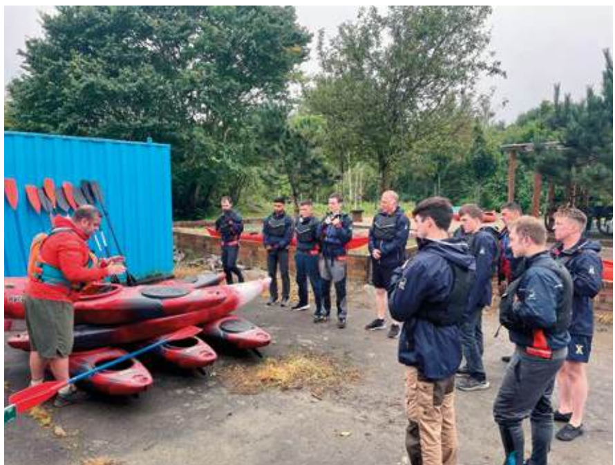
Auld Reekie AT weekend

The Company organised a battalion Adventurous training weekend of dry slope down-hill skiing at Hillend Edinburgh, and kayaking along the Union Canal. A Company also had a strong showing in the BISMARCK CHALLENGE, a 1XX arduous military training event that tested both mental and physical resilience, in a four-person weighted relay race.