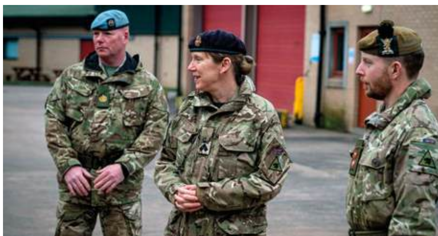
Commander visiting training in new facility