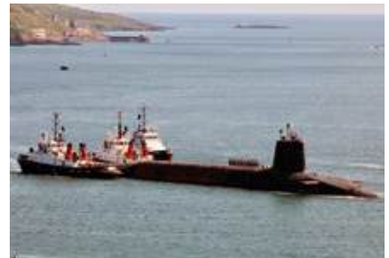
HMS VICTORIOUS' arrival in Plymouth Sound in May 2023. HMNB Devonport, Plymouth, will be home for the Submarine and her crew for the next few years whilst conducting her planned Deep Maintenance Period

With docking operations underway and spirits high, the team looks forward to the following maintenance phase and the Naval Ski Championships at the end of January. Reflecting on the past year, it's clear that the crew has embodied the core values of determination, adaptability, and teamwork.