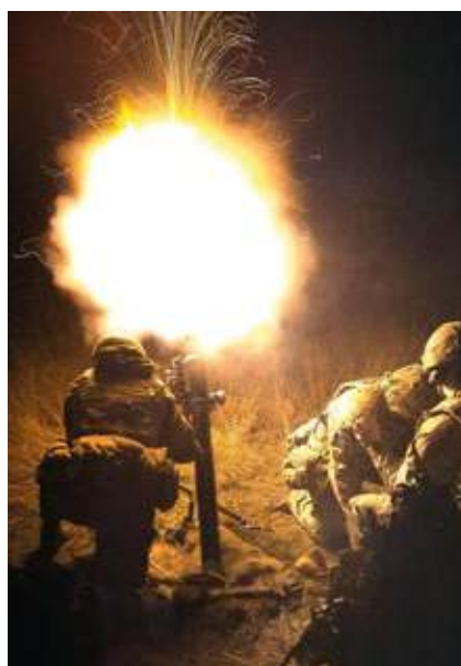
Mortar night fire