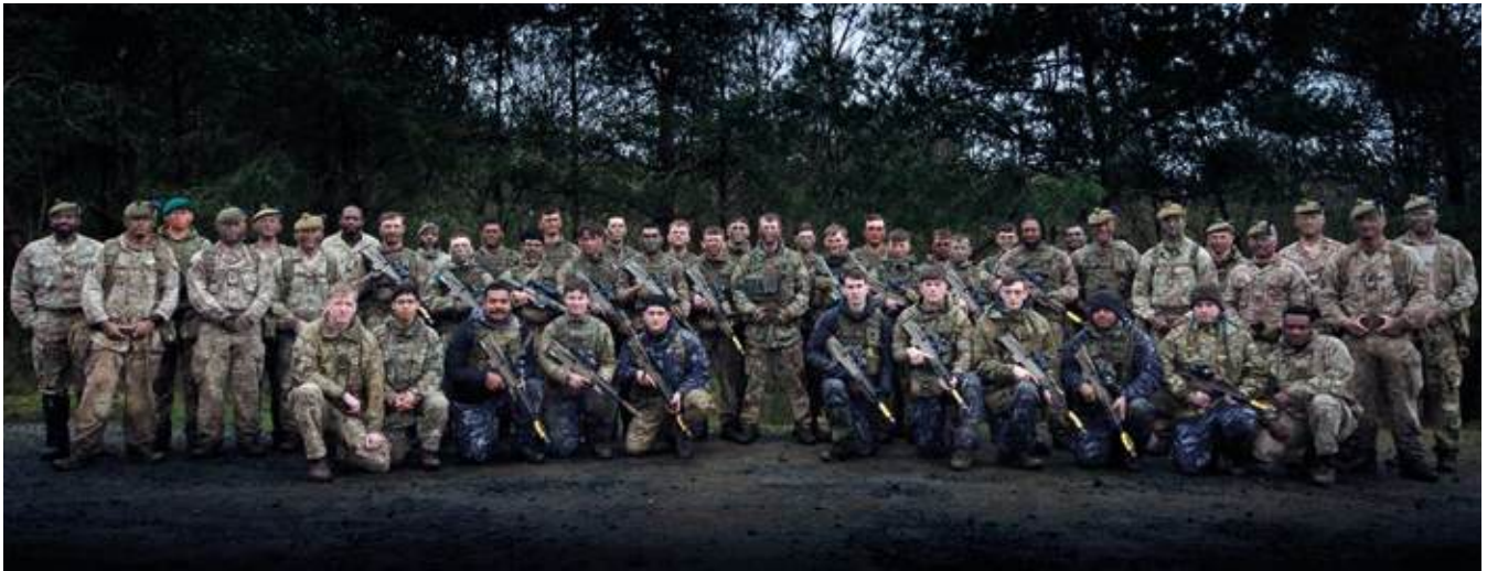
The Clan gathers for a photo following the end of the BCS Week