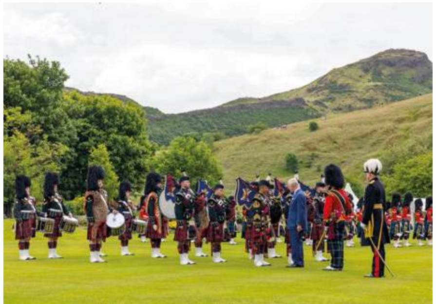
The Band meets the HM the King

The Remembrance period saw members of the band deploy throughout the UK and overseas in support of the various commemorations held at High Commissions or Commonwealth Cemeteries.