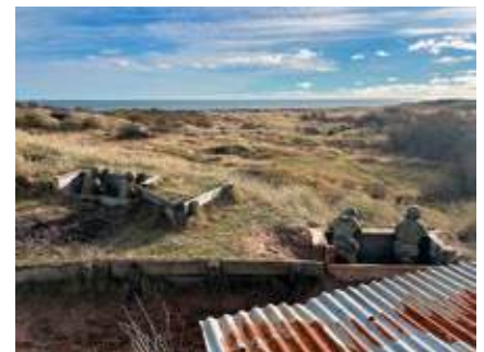
A Clansman section commander briefs his section 2IC during a live Section Attack

Whilst not deployed the Clansmen spent the remaining time before Christmas leave conducting training in preparation for the Battalion's exercise in early 2025. The Jocks enjoyed the opportunity to conduct individual training on medical skills and navigation and spent some time at Barry Buddon and Kircudbright completing their live fire preparation from static shoots up to platoon attacks at night. In November a team of eight, travelled to Brunei to take part in the Brunei Jungle Warfare Skills Meet, a jungle patrolling competition, achieving a gold medal after three weeks of very hard work.