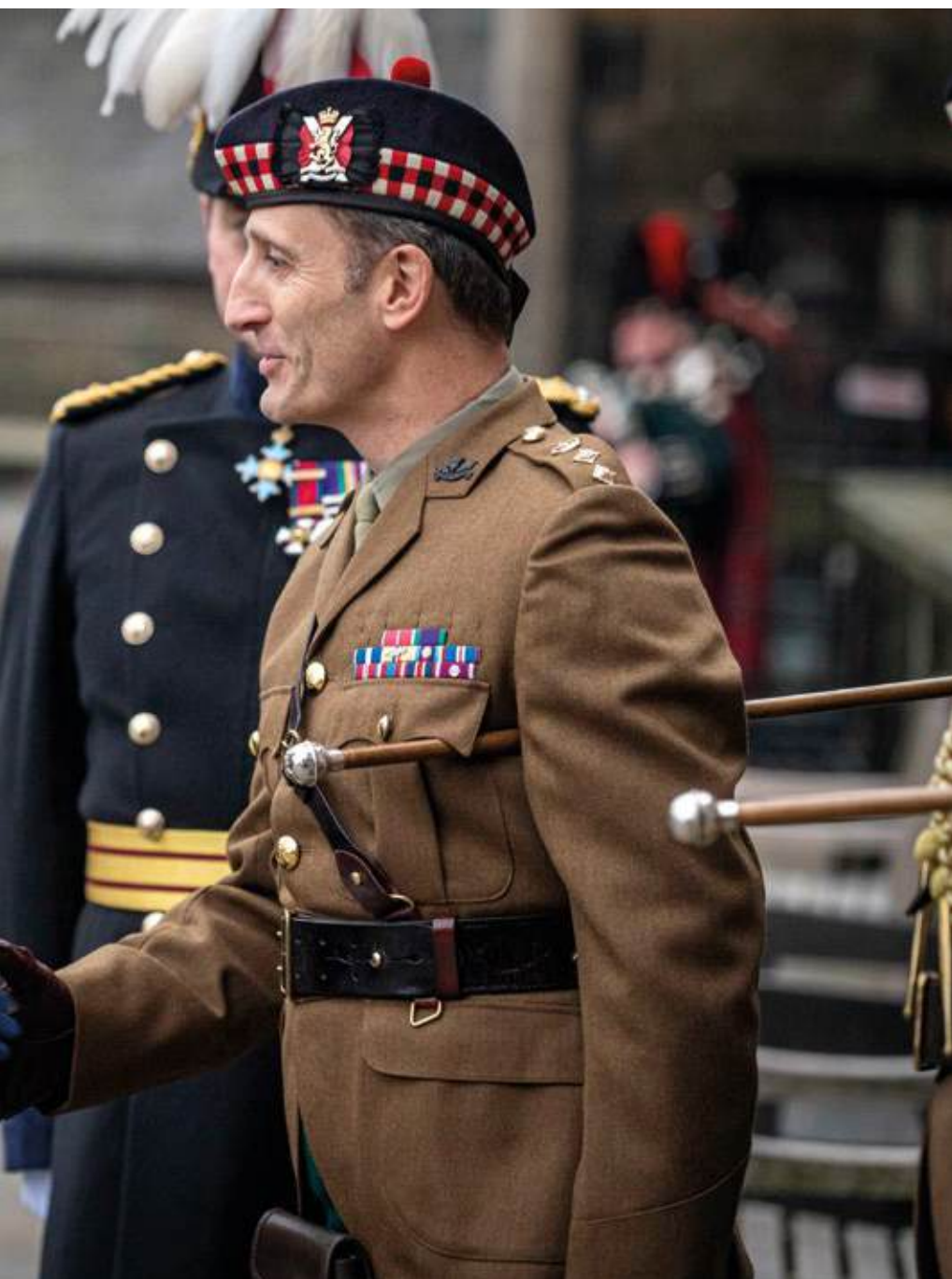
Colonel of the Regiment greeting The Princess Royal