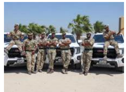
Kuwait Drive Team

A few special mentions to those who deployed for longer periods (up to 9 months) or for those who deployed at very short notice from ISR Coy with 1 weeks notice for 8 months – overall the Jocks did the Regiment hugely proud and can reflect on a positive contribution to the final stages of the mission to defeat ISIS in the region. Theatre dynamics clearly permitting, I am sure the Peshmerga would welcome the White Hackles back out at the drop of a TOS. Bravo Zulu, A Coy and ISR Coy. Job well done.