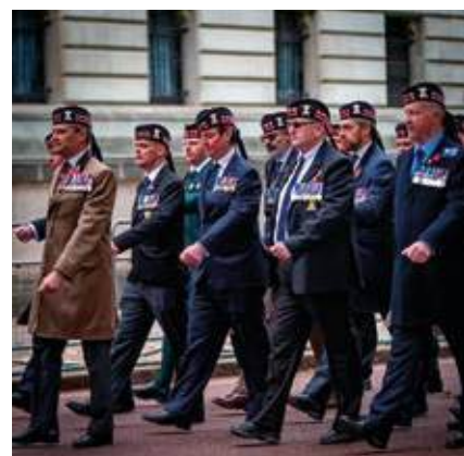
SCOTS Veterans marching