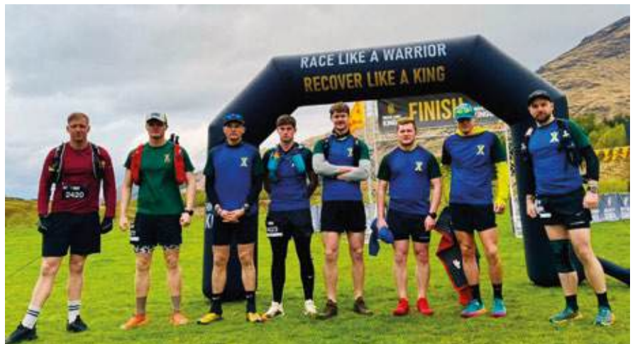
Highland Kings 4 SCOTS team