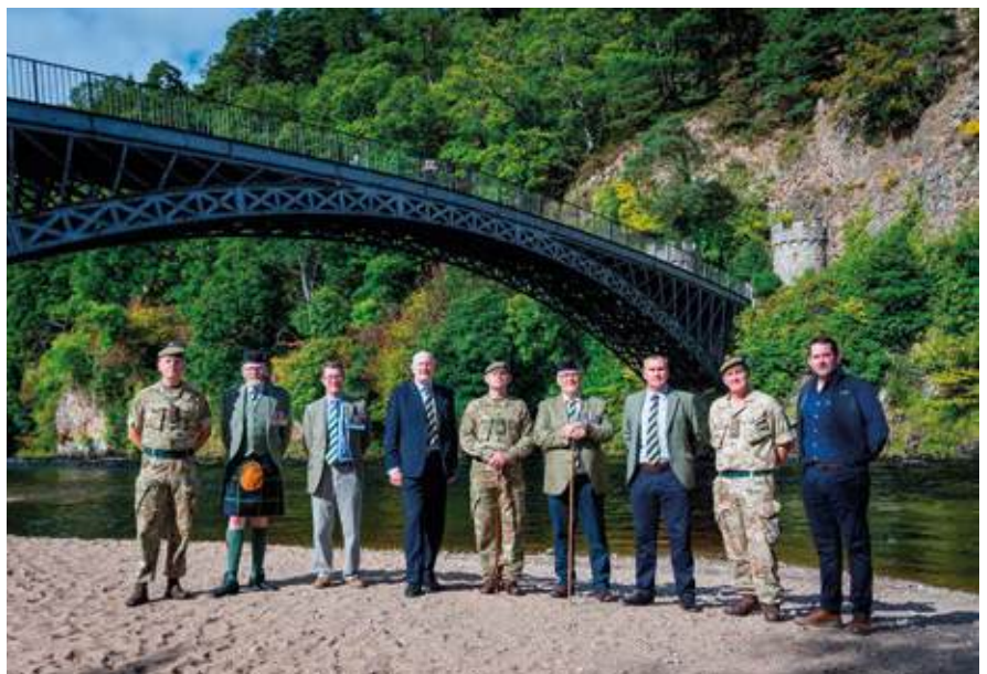
Highlanders and 4 SCOTS RSMs New and Old (Some Older) at Craigellachie Bridge as the Battalion Celebrates Highlanders Day

"Welfare Forward" and join the battalion in its parades and celebrations in marking the 30-year anniversary of the formation of The Highlanders.