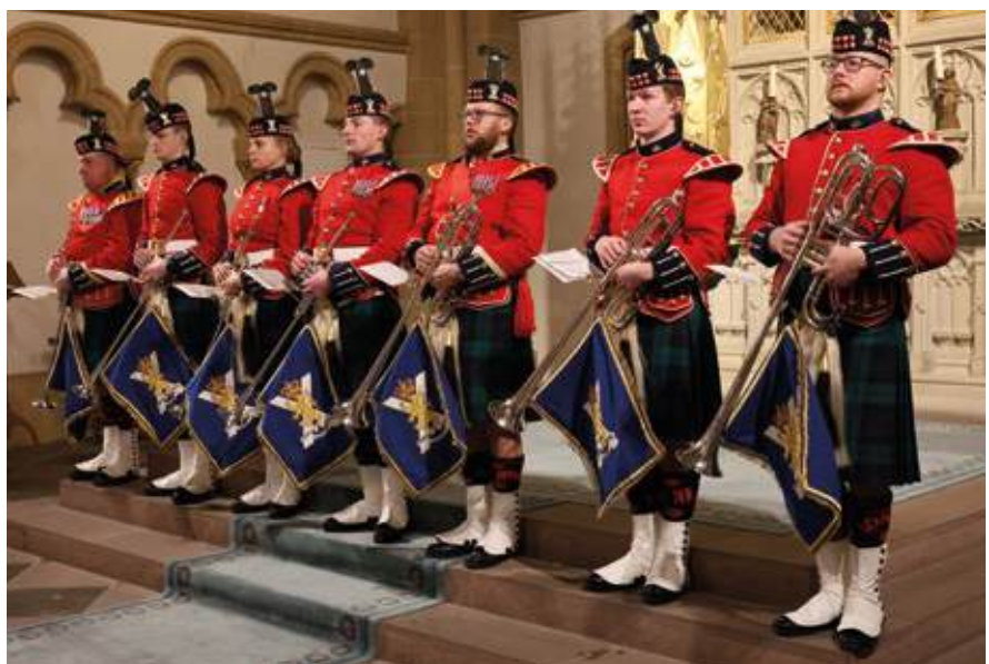
Fanfare Team in Hoher Dom zu Paderborn performing the fanfares to O Come All Ye Faithful and Hark the Herald Angels Sing