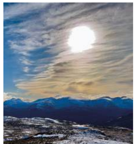
Glas Bheinn hill run views