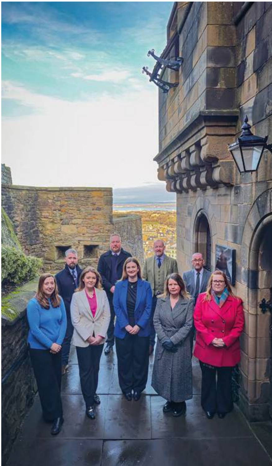
Regimental Headquarters Staff.