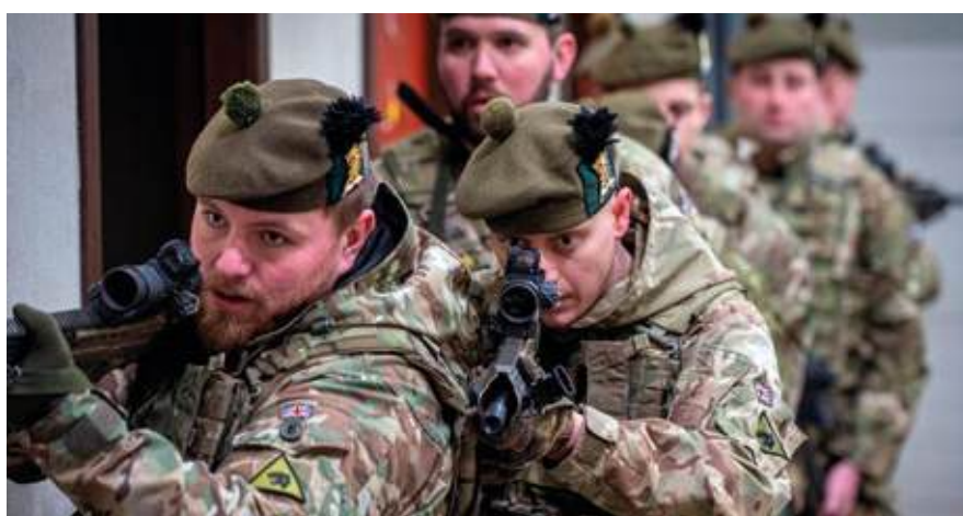
SCOTS conducting dry drills before moving onto exercise scenarios in the Urban Facility

Since it was officially opened, both 5 SCOTS BKA Coy and 7 SCOTS have trained in the facility using MRTS with good feedback. Various units and civilian emergency services have expressed interest in using it, so we look forward to welcoming them to Oliver Barracks to train over 2025 and into the future.