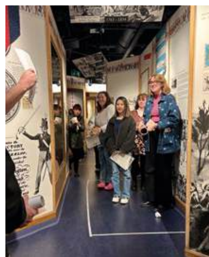
Volunteers 're-enacting' the Battle of Nunshigum 1944 during a training session in the Royal Scots Museum

volunteers was channelled into two full-day training sessions in the Museum, where everyone was introduced to the activities we provide for schools and got a chance to take part themselves.