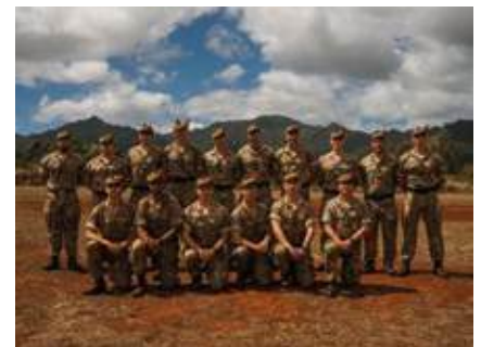
The 3 SCOTS JPMRC contingent, the 'unlucky' few selected for JPMRC...!