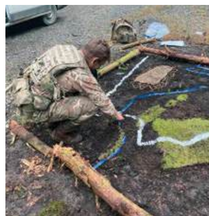
Capt Clayden-Spence (4 SCOTS) building a model pit for his Pl's first set of orders