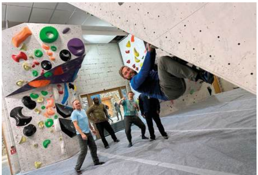
The RSWO having a fun time before his arms gave in