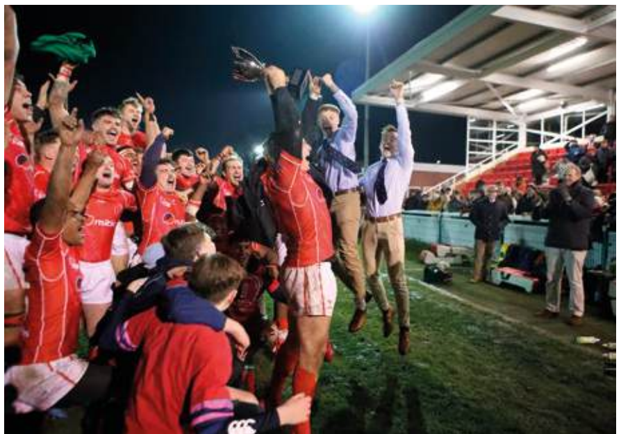
Army U23 celebrating their win vs the RAF

My personal rugby highlight of 2024 was captaining the Army in Scotland Rugby Team in our Scottish Inter Services Campaign, beating the RAF 21-7 and the Navy 53-7. The Scottish Inter Services give a unique opportunity for individuals serving in Scotland to display their rugby ability. Having achieved success with the Army in Scotland, I was selected for an Army Senior Development Fixture in 2025, with the hope of being selected for the Senior Squad this year.