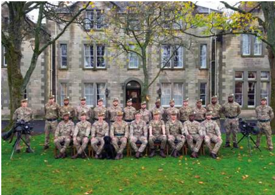
Col of the Regt with the successful students on the back of the Gunner Cadre

Over the past few months 2 SCOTS Sniper Platoon has maintained a rigorous operational tempo, notably supporting OP SHADER 18 and OP INTERFLEX. On Op SHADER the platoon provided vital force protection for international counterparts, ensuring the security of key personnel and assets. Following a well-deserved period of Post Operational Tour Leave, the platoon returned to focused training, with members attending Sniper Commanders and the Platoon Sergeants Battle Course in Brecon.