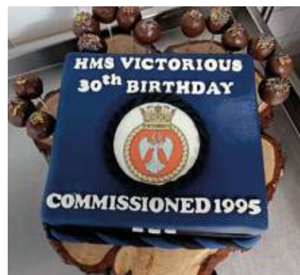
HMS VICTORIOUS celebrates her Naval Birthday after 30 Years in Commission with a birthday cake baked by the chefs onboard