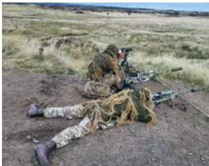
New boys getting put through their paces on the Sniper Operators Cadre