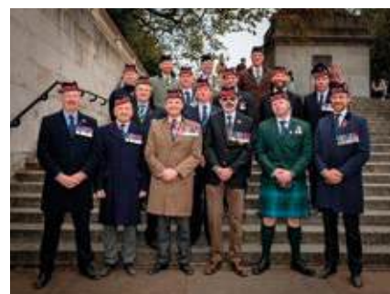
The Royal Regiment of Scotland Veterans contingent after the Cenotaph parade