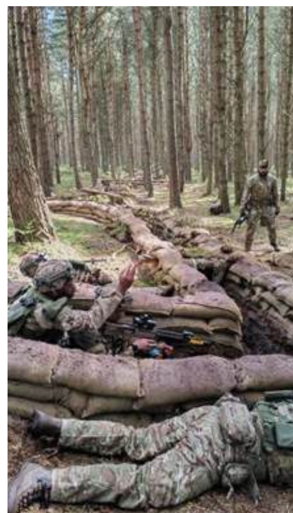
Op INTERFLEX Trench Training PDT