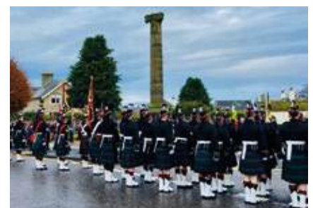
Alpha (Grenadier) supporting the Remembrance Parade in Nairn

As well as investing heavily in engagement in the North of Scotland, the Battalion was fortunate to have played a part in local and national events throughout 2024. B Coy led a contingent down to Portsmouth for the D-day 80 commemorations. An unforgettable, poignant, and certainly once in a lifetime event. The Pipes and Drums were in high demand throughout the year, crowning it with a performance at the State Banquet at the beginning of December, and to help maintain strong local connections, Delta Coy contributed a marching contingent to the Durham Remembrance parade, bringing some style and panache to proceedings. These engagements are crucial for maintaining the Regiment's visibility and fostering a sense of pride and belonging. They also provide valuable opportunities to honour those who served before us, ensuring their legacy continues to inspire future generations.