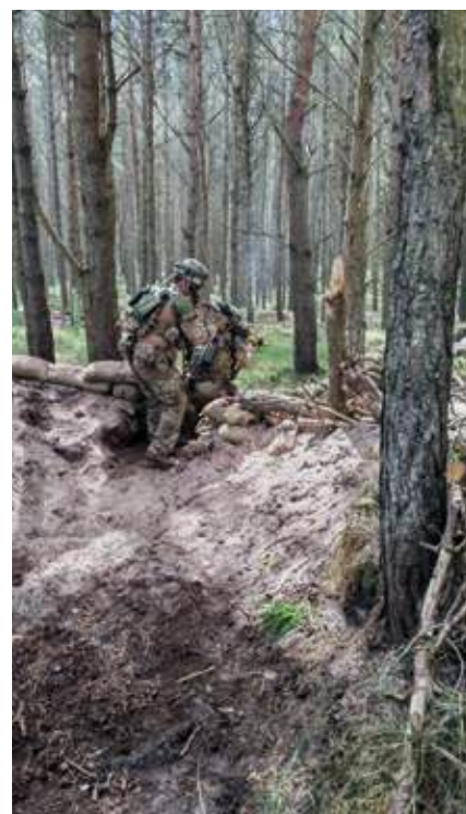
Op INTERFLEX Trench Training PDT