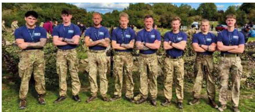
4 SCOTS runners

Alpha Coy then took full advantage of being in the Highlands during their Human Optimisation Immersive Week at Kinlochleven Lodge. On the final day the company held a 25km best effort race along the West Highland Way, the idea being to stress test the mental resilience work conducted through the week. Everyone completed the race, even more impressive given the 300m incline over the 2km that was designed to break morale.