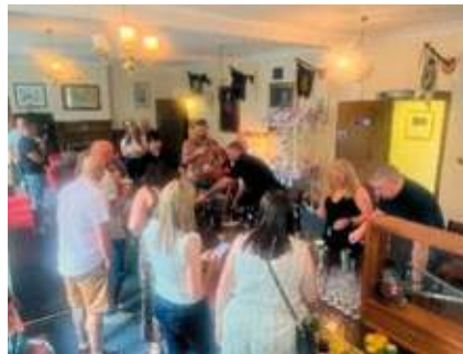
The Summer Ball