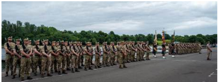
Clansmen on Parade

As is synonymous with the Army's forecast of events, 2024 was another varied, busy, and fulfilling year for the Clansmen. The focal point of the year was the Clansmen's contribution to Op INTERFLEX, training junior commanders from the Ukrainian Border Guard, National Guard and Special Police. The courses mirroring those delivered at Infantry Battle School, Brecon meaning our instructors were well-versed in the training delivery. The Coy instructed on all aspects of command and leadership training, preparing them to return to command troops in Ukraine to fight the Russian invasion.