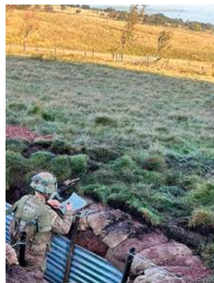
Coy conducting STAP on Ex HECTORS STORM