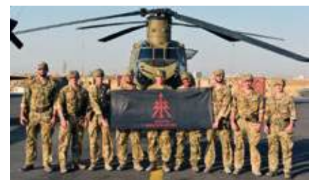
Recce Platoon on the pan