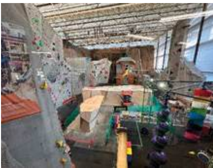
The Climbing centre from the top

On a cold but beautiful Scottish day, the CIS PI made its way to the International Climbing Centre in Edinburgh. After a few anxious minutes of wondering if we would be allowed in, the CIS PI crossed the threshold into the centre.