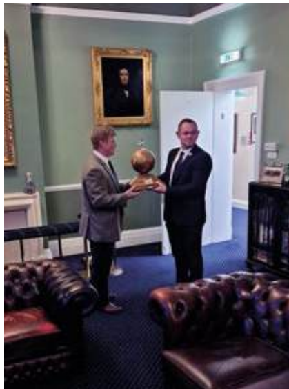
Assaye Football trophy handed to RSM from 2IC

With several star players missing, including the CO, Adjt and a decent goalkeeper, chances of securing the annual Assaye Day Football match against the Sgts' Mess for another year looked slim. After a humiliating first half and some questionable refereeing, the Offrs held their own in the second, but the damage was done. A few temper tantrums and yellow cards later both messes came together in the Offrs' mess for a curry and the handing over of the Assaye Cup.