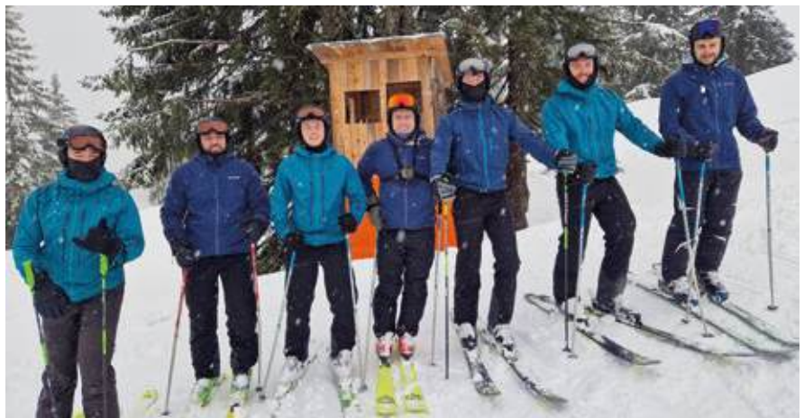
Members of HMS VICTORIOUS' Ship's Company learning to ski at Naval Outdoor Centre, Germany