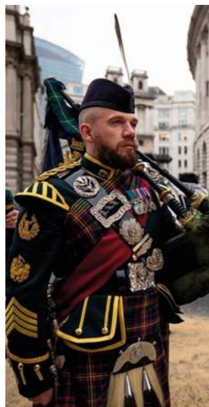
4 SCOTS Pipes and Drums about to parade at the Lord Mayor's Show