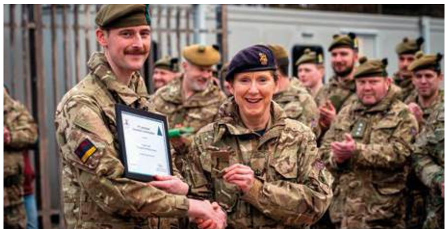
Bde Comd commendation and promotion for UAP member

2025 looks as if it will bring a new set of challenges to the UAP: training and mentoring a new cohort of Reserve CMTs to the stage where they can contribute to RLS patient care; supporting our Bn ADE in September by providing RLS Primary care, Pre-Hospital Emergency Care and Team Medic Courses; and creating a state of the art Clinical Trainer and Medical Store in Inverness ARC. We remain reactive to what the future will bring for 7 SCOTS, and as with last year we are immensely thankful for the support of the Battalion, 19 Brigade and the wider SCOTS family for supporting our efforts to drive ARes medical care forward.