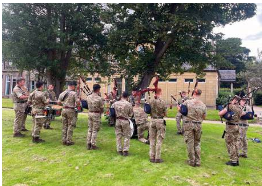
AA Class 3 Pipers & Drummers 2401 final tune up before getting changed for their Pass Out Parade