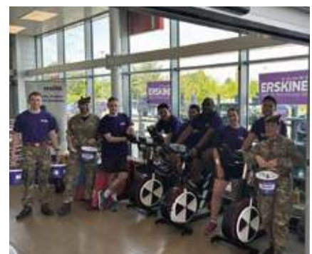
Detachment set up its stall in Nairn and cycle 1000km raising £2016 for Erskine Trust