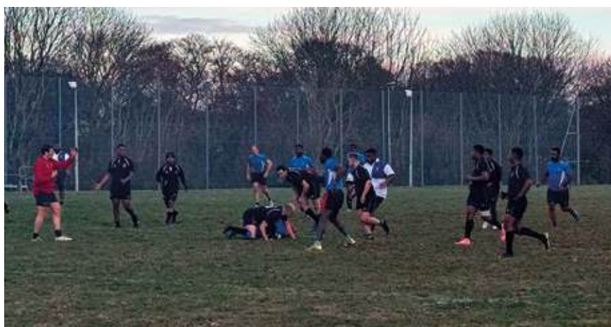
A comprehensive victory over the Grenadier Guards in a rugby friendly fixture