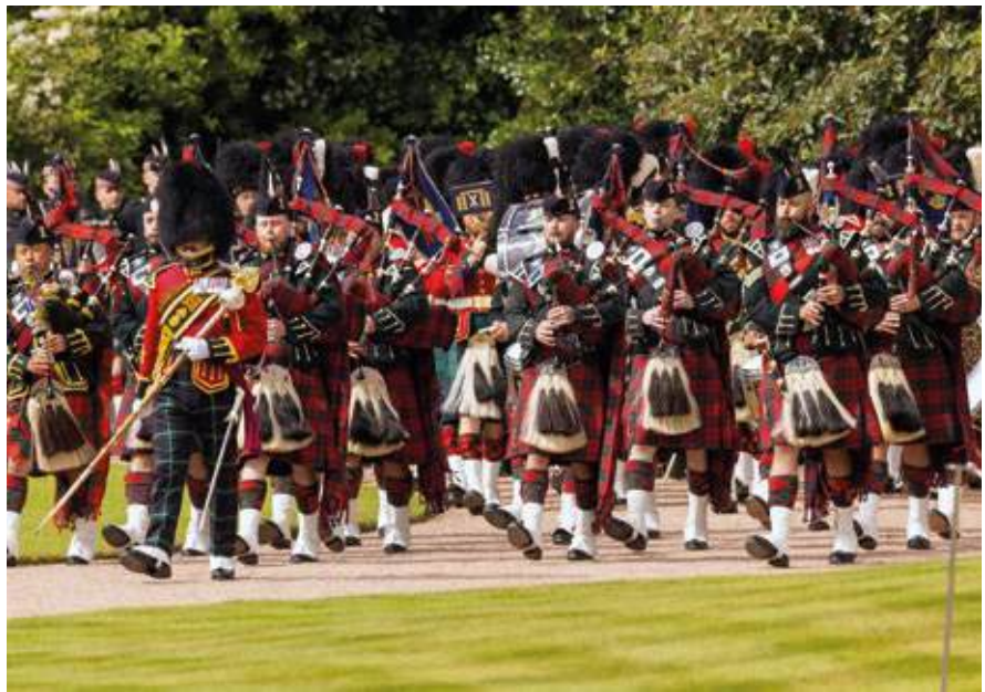
The Band March on at Holyrood

That success manifested into winning competitions. Currently, we are the Grade 4B Scottish, British, European and Champion of Champions. We were also assessed as Best Turnout, Best Drill and Best Drum Corps throughout the entire season.