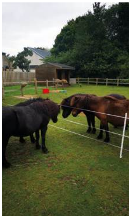
Cruachan and Nighcap with Pegasus and Bruneval

Once again, we participated in His Majesty The King's arrival parade at Balmoral alongside Balaklava Company. We also formed part of the Guard of Honour at the Lord Mayor's Show when the Regiment was granted the Associated Status of the City of London!