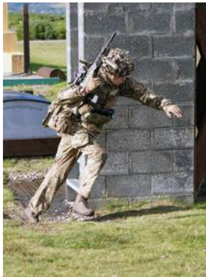
Advancing down the IBSR during the Bn LFTT Package

Whilst taking steps forwards, we haven't lost sight of some of the more traditional HQ Coy roles. The Signals Detachment led by HQ Coy SPSI continues to provide the Battalion with its G6 capability from running various cadres for soldiers, right through to providing a Battle Group Main and Tac through the ADE, Exercise RHINO HEART. Whilst small, we are fortunate to have a technically competent and dedicated team.