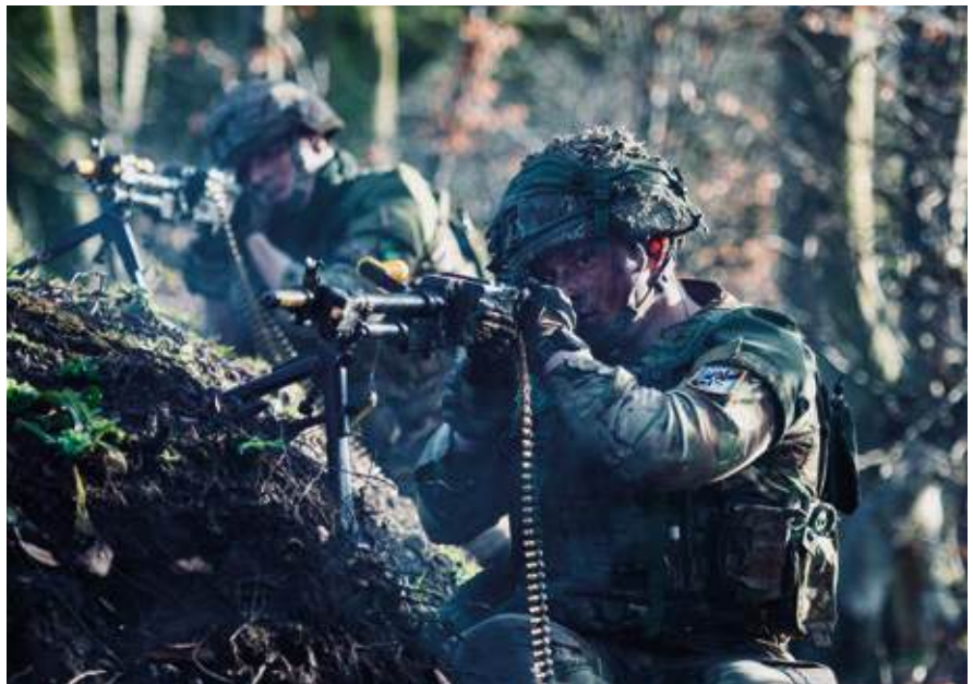
Ex GRENADIER WHINNY Break In

A conceptual development week in Feb set the conditions for Ex GRENADIER WHINNY in March, providing progression from Ex WINGED SERPENT. Sessions delivered by 11 MI Company and LWC (URBCEN) on pacing threats, Urban Ops and deception were invaluable, and a series of tabletop exercises and discussion groups helped consolidate and codify how we would operate. Leveraging a spectrum of capabilities the Company bridged to Ex GRENADIER WHINNY to rehearse and practice in a force-on-force package on Catterick Training Area. Bolstered with Platoons from Bravo and Delta Coy, Aviation from 28 Sqn (RAF), Military Working Dogs, and RPAS and ATAK from 16 AABCT it provided a real opportunity to enhance our ability to operate in urban and rural environments with a focus on survivability, finding and understanding. A day trip to 636 Bty (4 RA) then provided a great opportunity to broaden individual and collective skillsets for both career courses and the contemporary operating environment through Arty Target training and Danger Close demonstrations.