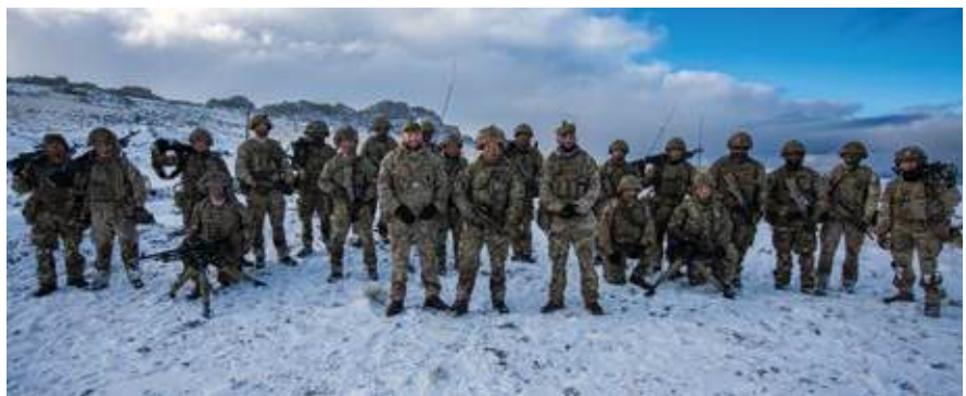
MG Pl having just completed Ex MOUNTAIN GOAT, the culmination of their MG Cadre, on the rugged East Falkland hills

by the RAF, and two nights embarked on board HMS FORTH. Despite the exercise being cleverly designed to coincide with the coldest weather since records began in 1982, the entirety of MG Pl grafted hard, lugging their heavy loads into remote fire-support positions to support the rifle platoon onto the objectives. The exercise concluded with an attack on to Goose Green in deep snow, demonstrating just how challenging the real thing would have been 42 years ago.