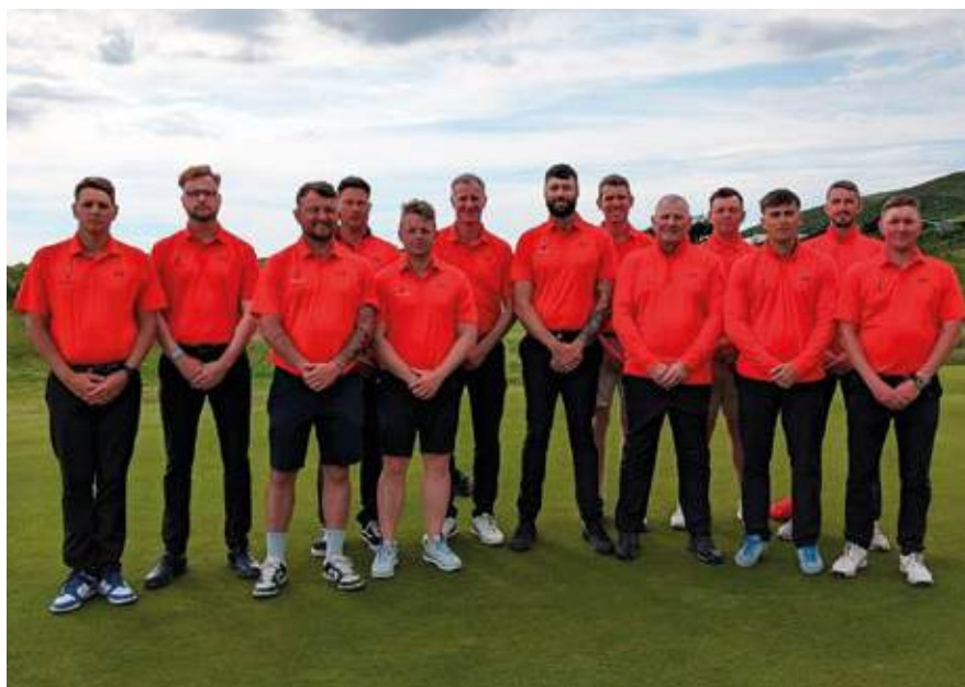
Infantry Golf championship

Having two players that play golf at a level where they can compete and win is an enormous positive for SCOTS and this level of sport not only showcases the talent of our soldiers but allows individual and team development for the greater good of the Army's output. A critical area to showcase and maximise talent for others to follow.