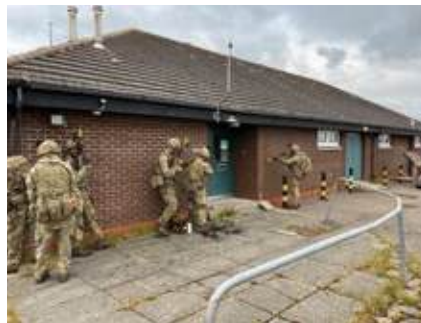
PI attack on an urban objective during Op INTERFLEX PDT