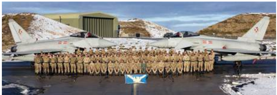
FSp Coy in the Falklands

Fire Support Company has once again embarked on another dynamic and challenging year. Often segregated from Battalion, the Company has showcased its independence as well its unwavering commitment to excellence. From rigorous exercises in the Falklands to numerous ceremonial duties engaging with the public. Collaborative efforts with other Services have strengthened overall operational capability, whilst individual achievements within the