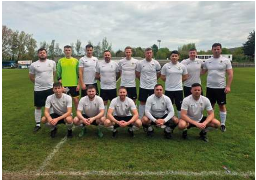
The victorious Army Reserve Cup champions

Advancing to the final, 6 SCOTS went head-to-head with 3 Royal Welsh in a thrilling encounter that extended into extra time. The match was fiercely contested, but 6 SCOTS demonstrated our resilience and tactical prowess, ultimately clinching the championship title with a narrow 2-1 victory. This triumph crowned us as the Army Reserve Cup Champions, the team were elated at overcoming such stiff opposition and testing themselves against some well drilled and skilful teams, who pushed the team all the way. The victory in the tournament demonstrated our dedication and teamwork throughout the competition.