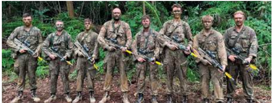
2 SCOTS patrol after finishing the competition

During the familiarisation package, each morning started early with acclimatisation physical training at dawn, to complete it before the heat of the sun became too powerful. For the competition the Physical Training Instructors from British Forces Brunei alongside, a doctor from the Institute of Naval Medicine, were implementing a trial acclimatisation package involving more arduous PT earlier on, as well as more loaded marching to enable greater adaptation to the tropical heat and humidity. After physical training we moved into lessons and jungle training to prepare the teams for operating in the close country environment. The varied lessons delivered by the 1 RGR Jungle Warfare Instructors included a survival day learning about traps, shelter, and fire as well as the opportunity to taste some of the interesting "food" foraged in the jungle by the instructors. On another day we had the opportunity to experience our first night in the jungle with a day of