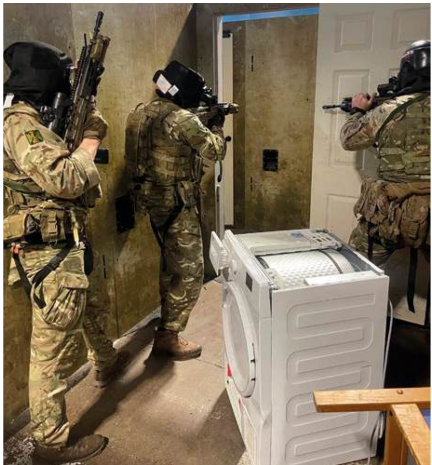
Urban training facility

To round out the excellent training, a surprise visit from GOC 1XX, with numerous Bde Commanders in tow, had the 2IC & CSM on edge but naturally B Coy stood up to the test.