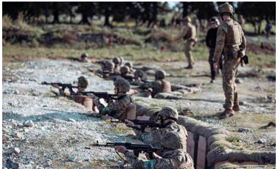
Trench warfare Trg

Once on task our primary objective was to provide comprehensive military training to Ukrainian recruits, focusing on foundation infantry skills, battlefield tactics and medical support. Our program was to prepare Ukrainian soldiers for various combat scenarios, thereby strengthening Ukraine's forces.