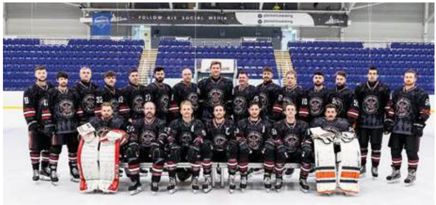
The 2024 Army Blades

While the Tri-Service Championship takes place during the day, what one might call the 'main event' happens in the evenings. The showpiece Inter-Service Championship (ISC) sees the best players from the Army, Royal Navy, and RAF, face each other across three evenings. These games are open to the public and exhibit the best hockey our services have to offer.