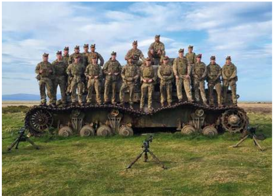
MG Cadre, Tain AWR

The Grenadiers leapt into the year with a passion for soldiering and professional excellence. Having re-orbatted for the tasks ahead, the Company quickly set about visiting old haunts (professionally and socially) while the rest of the Battalion took their turn deploying away from home. The Pipes & Drums led the charge swapping the rat-a-tat-tat of the snare with the equally lovable sound of the