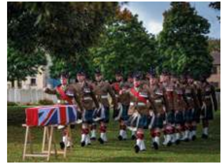
The Bearer Party marching on to the coffins of the unknown soldiers