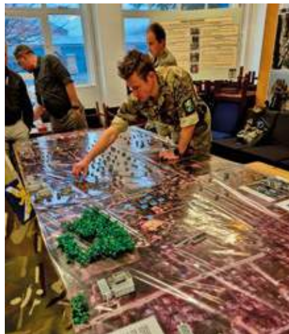
Ex URBAN DRAGON tabletop Ex