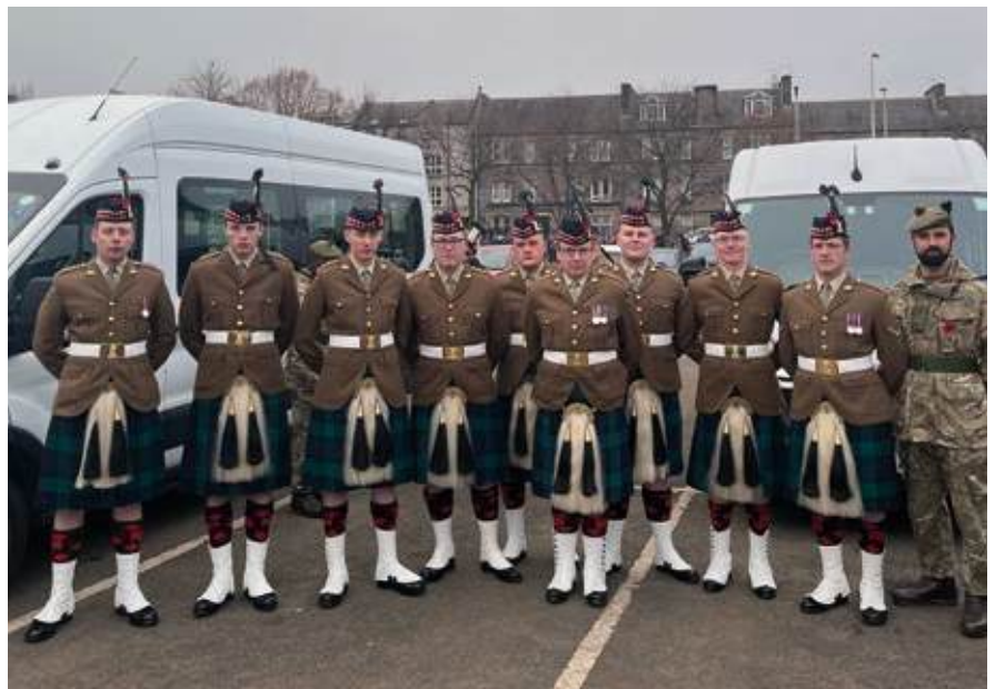
HQ Company at Remembrance in Perth