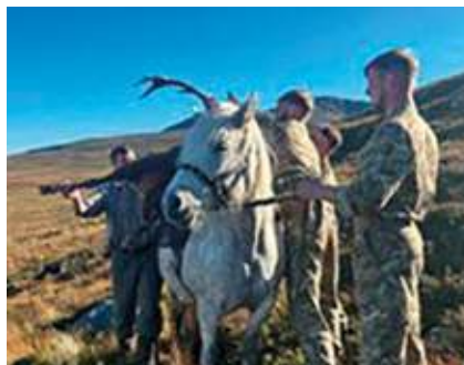
The Jocks hard at work on a beautiful day in the Highlands. Who had the good idea to use grey ponies to take stags off the hill?