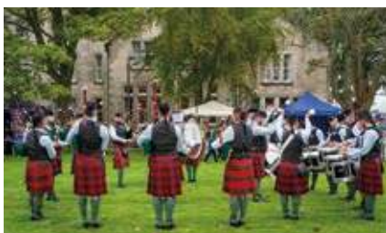
The Pipes and Drums showing us all why they are the champions!

As ever Assaye Day involved the QM's Dept leading the way with the preparation; the chefs produced another outstanding barbeque along with the cultural stands from the Nepalese and Fijian community, which was a real hit with the crowd. Although a smaller celebration, it was a welcome event as it allowed the Bn to be in one place together and able to socialise for the first time this year!