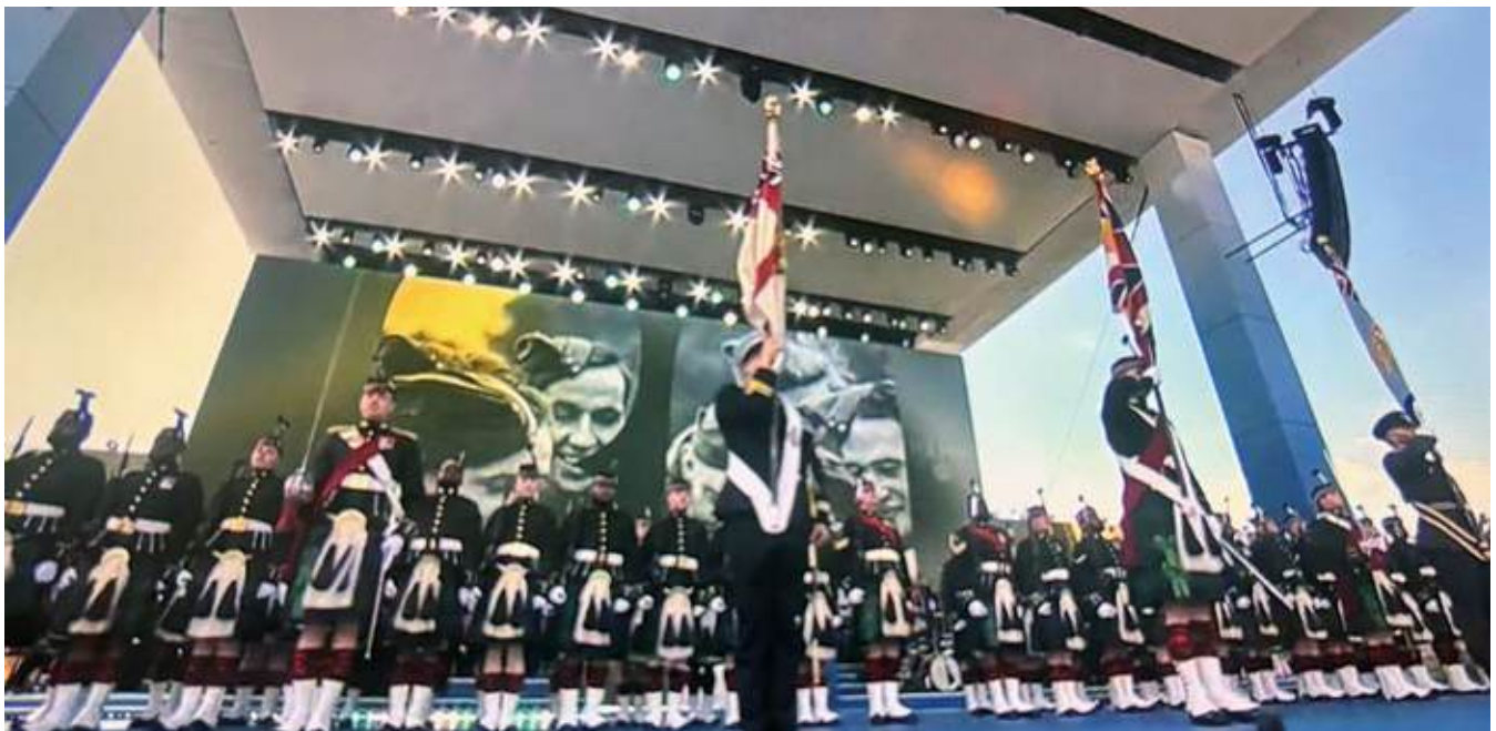
4 SCOTS lead the D-Day 80 Parade on BBC One

When it came time to form up backstage, the Jocks took full advantage of their natural quick wit and humorous nature to snap the most opportune of selfies with the likes of Dame Helen Mirren! Finally, the queue was given and it was with immense pride we marched out onto the stage in front of not just the audience in the arena, but the world's assembled media to open the D-Day 80 commemorations. The time flew-by with not just the Army contingent, but the rest of the tri-service guard of honour hitting each of their marks – the long hours of preparation and rehearsals under the expert eye of the London Garrison