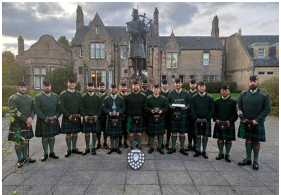
The Army Pipe and Drums Championship