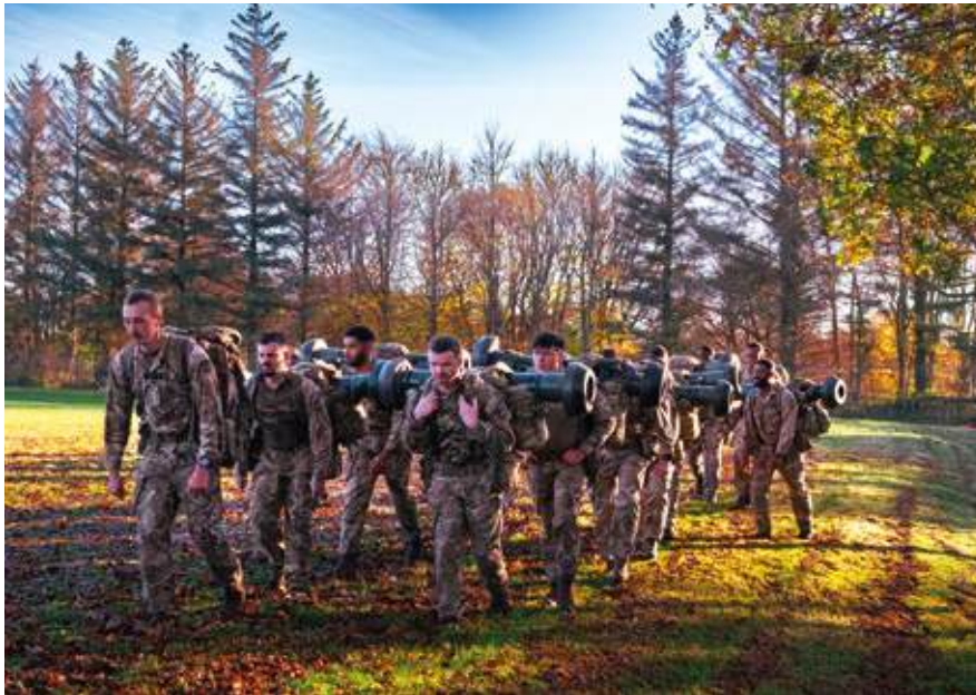
Carrying heavy things...