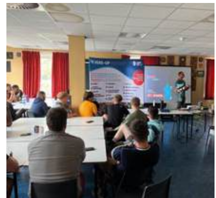
Heads Up Charity Workshop Kinlochleven

The year also saw Alpha Company at the forefront of 4 SCOTS outreach activity. Influence was far reaching in support of regimental recruiting – from delivering a Section Attack demo day at AFC Harrogate to over 150 recruits and monthly support to the ASC Glencorse, through look at life days at 4 SCOTS to over 120 recruits from AFC Harrogate and ITC, to supporting Army Cadet Force nights at Tain and Dingwall.