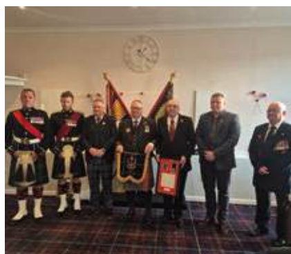
CSM and OC exchange gifts with Seaforth Club in Nairn Remembrance Sunday

Alpha Company had several excuses to dress up, with ceremonial activities that included leading 4 SCOTS Freedom Parades in Aberdeenshire (May), supporting the General Assembly of the Church of Scotland (GACoS) (May) and the Remembrance Parade in Nairn (Nov) for the third consecutive year. It remains a truly rewarding and humbling experience to represent 4 SCOTS in the North of Scotland where its heritage lies. The margins of GACoS allowed the Company to reap the benefits of being in Edinburgh, completing a best effort 'gate to gate' across the Pentlands, visiting Edinburgh Castle and the SCOTS Museum, and unleashing a scavenger hunt around Edinburgh.