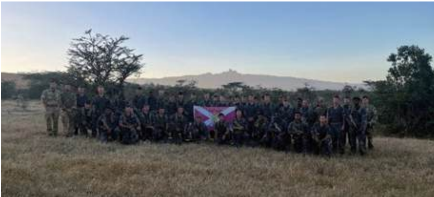
Delta Company photo with Mt Kenya in the background after finishing FTX