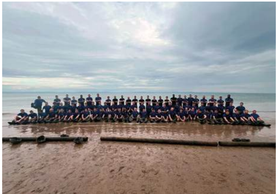
A Coy completing log PT at the local beach

2 SCOTS Gymnasium had the privilege of hosting Rangers Football Club in their pre-season preparations. The Professional Development Phase players, comprising the B Team and Under-18s, visited Glencorse Barracks in Edinburgh where they were pushed to their physical and mental limits by the 2 SCOTS gym staff. The youngsters were given the full treatment and were tested on their fitness, mental stamina, problem solving and communication skills in high pressure situations. The