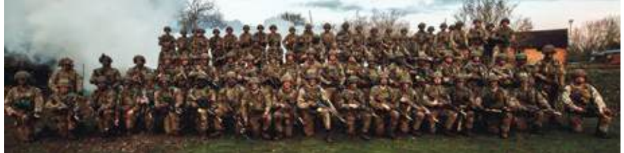
Coy at Whinny Hill during Ex GRENADIER WHINNY