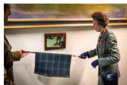
Deputy Colonel-in-Chief unveiling the plaque

Everyone involved was delighted with the visit and we look forward to welcoming our Deputy Colonel-in-Chief back to the Regiment, in the not-too-distant future.