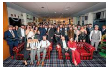
2 SCOTS CSMs and OPSWO at the Christmas Ball

highly successful and has shown yet again, that we not only continue to serve and fight for our soldiers to the best of our ability, but we continue to look after one another as we wade through the never-ending list of tasks. We also continue to invite our Officers to join in on the fun, developing the young officers and enhancing the relations with the old sweats. Anyone worth their salt understands how crucial these relations are and within the 2 SCOTS WOSM we lead the way in ensuring that those above and below are looked after – this is what SNCOs were made for.