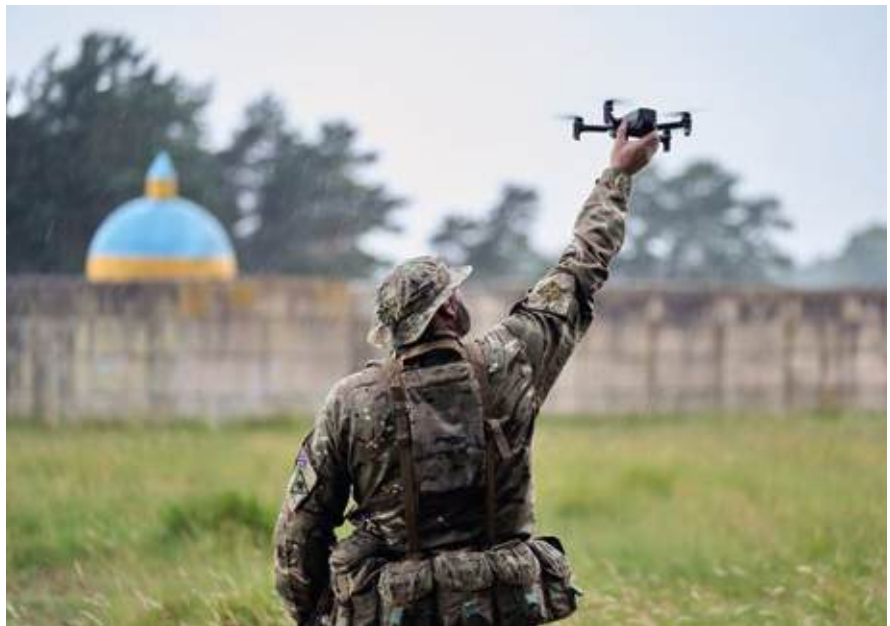
Incorporating the 3D battle with drones

It was a privilege to work alongside the US National Guard and was definitely one of the highlights. Working so closely with another nation taught us all a lesson or two – you can always rely on the Americans for their weight of fire!