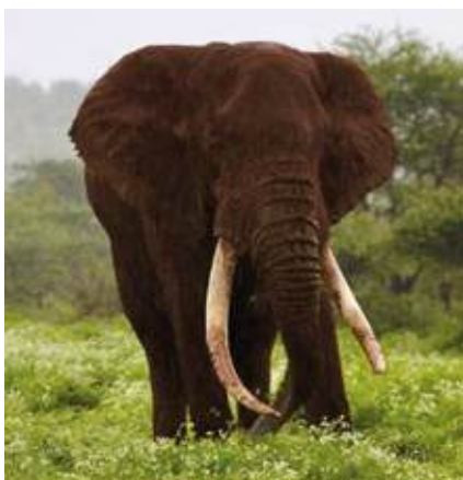
Elephant on Eastern Laikipia Training Area

BATUK continues to be a professionally fulfilling and dynamic place to work. In training delivery, we are working hard to ensure visiting battle groups are put through their paces against the contemporary threats – and continue to deliver an exceptionally demanding exercise. Routinely we have two to three large scale exercises each year, which now include a longer period of unit self-delivery training under the new Land Training System design. It is hugely rewarding to be mentoring units to achieve their full potential and leave Kenya at a better standard than they arrived.