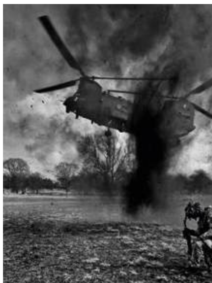
Ex GRENADIER WHINNY Avn Assault

The hard work and continual fighting ethos of the Jocks and Juniors continued into the 4 SCOTS Training Level Delta Ex HECTORS STORM in Aug. Another key milestone on our readiness pathway, this activation and Force-on-Force package again tested our ability to project over 1000 miles and respond at pace. A series of Company Mechanised Mindset weeks helped set the conditions and the Ex provided an ideal platform to test and adjust two mechanised survivability themes the Company had developed through 2024 – '5th Foxhound Playbook' and 'Sustainable Austerity'. On the fighting front, the Company lived up to its name (Grenadier) and for the final Battlegroup Raid it was