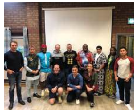
The Det get together for a cultural social

The Detachments focus as we enter 2025 is training and warfighting as we continue to develop our part in the battle space.