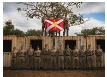
The 3 SCOTS JPMRC contingent