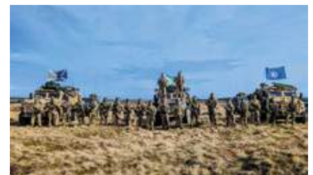
Pl deployed on Op LINOTYPER

"Figure it out for yourself, my lad, You've all that the greatest of men have had, Two arms, two hands, two legs, two eyes, And a brain to use if you would be wise."