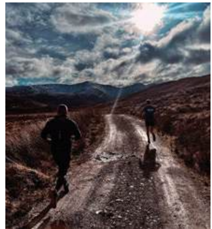
CSM Glas Bheinn run