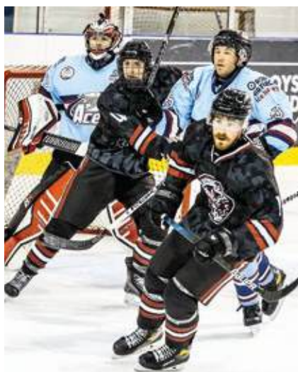
Fighting for position in front of the net

The ISC games bring with them a level of intensity that some might shy away from but it's something I enjoy and I'm very keen to experience more of. Luckily for me, four months later I got another taste of playing with the Blades at the Whittaker Cup.