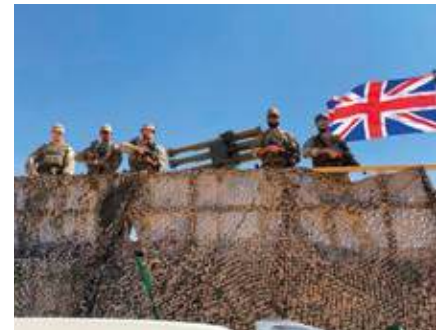
Taskforce MAVERICK in AAAB