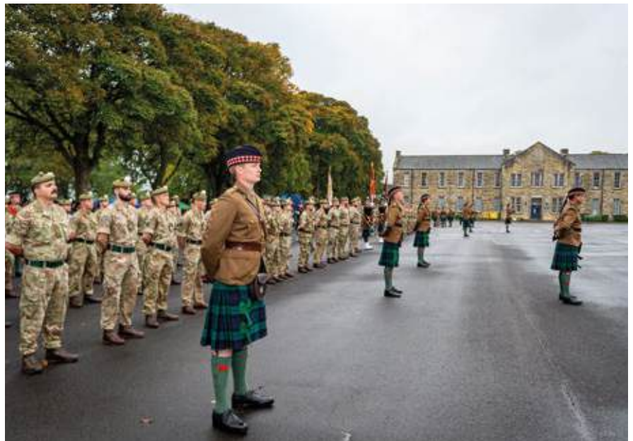
The Battalion formed up

Well done to all that took part with minimal rehearsals, proving that the Jocks can adapt and overcome.