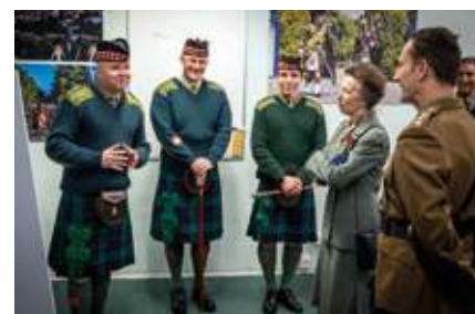
4 SCOTS giving their Battalion update

Before departing from Regimental Headquarters, The Princess Royal unveiled a plaque which read: "To commemorate the visit of HRH The Princess Royal Deputy Colonel-in-Chief, The Royal Regiment of Scotland to the Regimental Headquarters at Edinburgh Castle on 1 November 2024" and also signed the visitors' book.