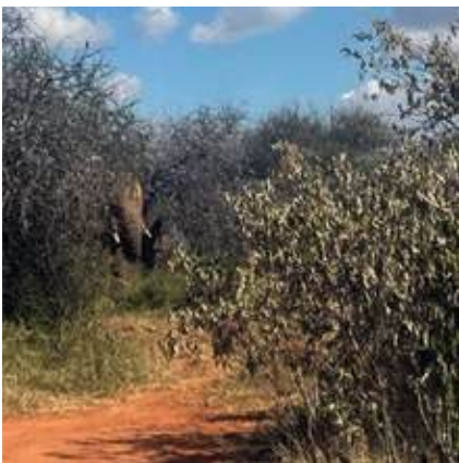
The elephant we stumbled across while conducting a recce of the area