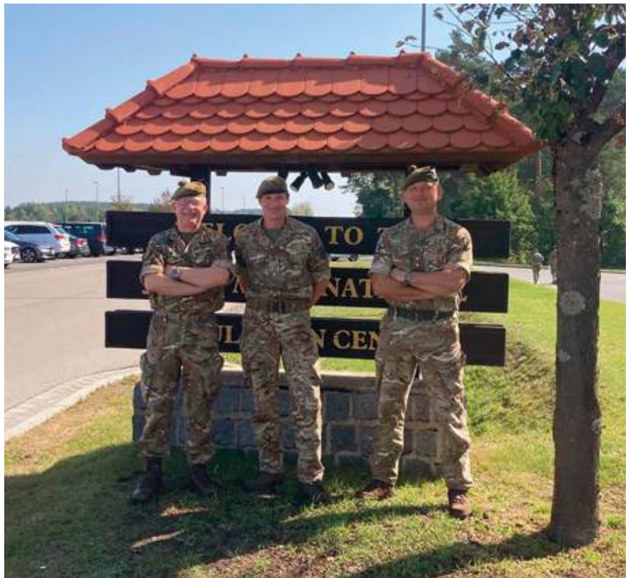
US Joint Modernization Command-Grafenwohr

In this past year, whilst working in Joint Modernisation Command, I have participated in Project Convergence Capstone 4, in California, and will shortly deploy on Capstone 5. I have also deployed to Germany for Exercise Avenger Triad 2024, to assess operational warfighting concepts and capabilities (and gaps). I have witnessed the expansion of battlespace at every level from section to corps, while at the same time commanders face the tyranny of a contraction in decision space and time. We have preached mission command for decades; the modern battlespace demands mission command in minutes. Previously I commanded platoons of three sections and a platoon HQ, a company of three platoons and a company HQ. The platoons I see now have three Assault teams and a Support team with UAS, C-UAS and breach capabilities built in. The units are morphing from the three Rifle Company staple configuration of the past 100 years to two Close Combat teams, a Weapons Company, and a Recce Strike Group. They are equipped with more firepower than is polite, but no more than is necessary and can sense and touch out to 40km.