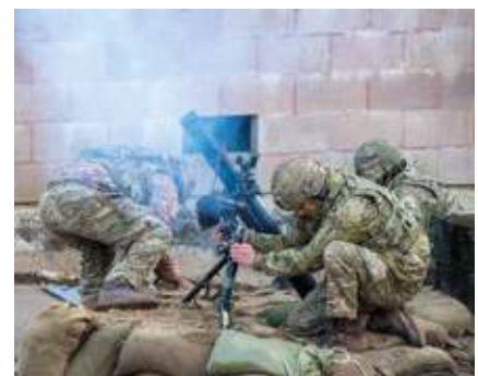
The Mortar Platoon live firing from Cellini village in Brecon

As 2025 unfolds, Fire Support Company stands ready to face new challenges with determination and vigour. The first half of the year plans to be particularly demanding, with a series of high intensity conventional exercises designed to sharpen our warfighting skills and operational readiness. As ever the company will look to rise to these challenges and remain a formidable asset on the battlefield, it will be viewed as an opportunity to grow stronger, setting the stage for another year of exceptional achievements and service to Regiment and Country.