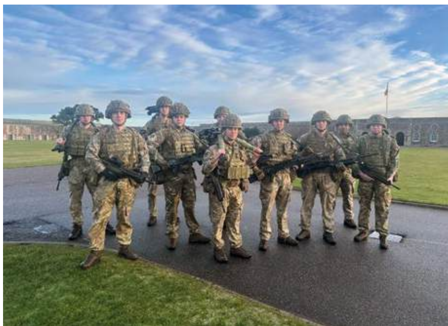
MG Cadre, Fort George

8 courses throughout their deployment, supporting some 600 members of the AFU.