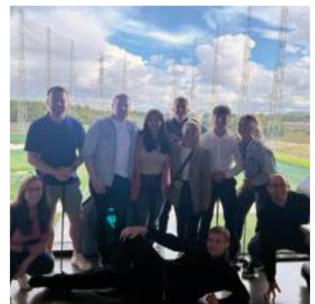
The detachment taking part in Top Golf

The Detachment were back together just before Christmas leave and look forward to supporting the Battalion as best we can in 2025!