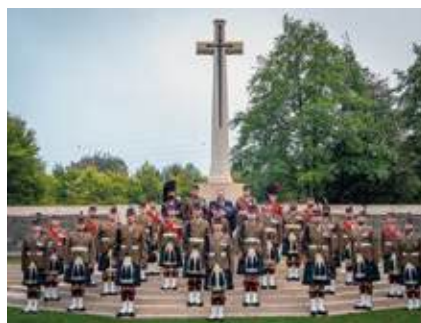
Muster of the Burial Party