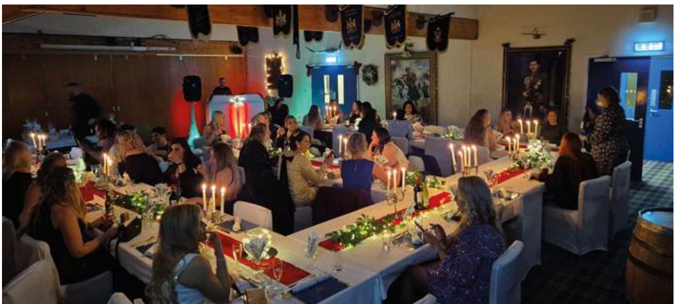
4 SCOTS Wives and Partners Xmas Party