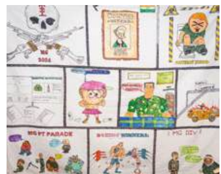
Machine Gun Pl best blanket winners at Jock's Lunch