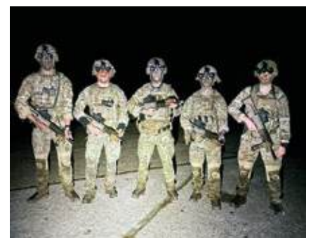
Recon in the re-org

Through these rigorous activities, the Reconnaissance Platoon maintained its high standards and commitment to excellence, ensuring that all members are well-prepared for future challenges.