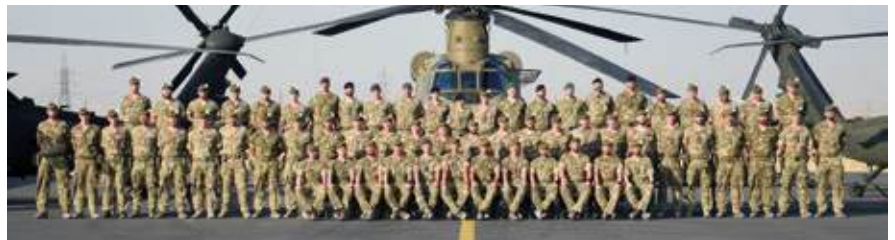
ROTO 2 ISR Coy Group

From an operational perspective, the SHADER mission has transitioned from the Peshmerga basic training mission of the previous tour and is now largely focused on providing force protection for the raft of staff advisors to the Peshmerga operational HQs. The real benefits to this change, was