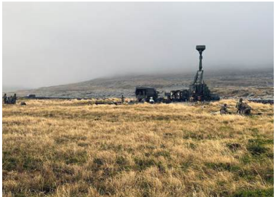
The GAMB radar supporting a live mortar range

It was the patrol week however that really allowed our Junior Commanders to come to the fore and test their leadership. The sections would be transported to far flung parts of the island in order to gain insight on the topography and support the local residents. This would really test their ingenuity as the tasks they would get involved with ranged from putting up satellites, to sheering sheep and everything in between. As with everywhere we go, I took great pride in the feedback I received from many of the landowners who were quick to