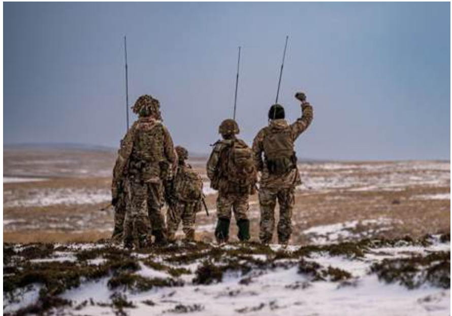
Typhoons swoop low for some ECAS

In summary the Falklands provided a fantastic opportunity for Fire Support Company and our hard-working attachments to come together, train and deliver a tangible output and they did it with great enthusiasm and results. I could not have been prouder of their performance!