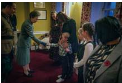
HRH meeting with families

Once The Princess Royal had been briefed by the Bns, she was then escorted to the Officers' Mess, where veterans, serving personnel's families, and families of the fallen then greeted HRH.