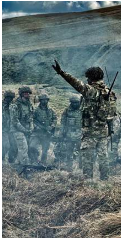
CSM bossing it

VJTF(L) and ARF High readiness were defining themes – the UK's primary land force contribution to NATO. All activity was set against the backdrop of training for, and maintaining, this readiness which by 1 Jun 2025 will have seen the Company and Bn at Very High Readiness for 17 months – including 12 months @R1 (48 hours notice move). With clear purpose our people achieved much though, and the past year saw our projection and warfighting focus sharpen.