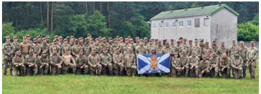
SCOTS Company including the Montana US National Guard Platoon

Whilst the majority of the staff in the headquarters came from 7 SCOTS, there was definitely a realistic composite nature to the team with exceptionally capable support from our sister Battalion 6 SCOTS, 71 Engr Regiment (BGE), and 5 MI with an IO and AIO. It would be remiss of us not to thank the various attachments for their exceptional contribution.