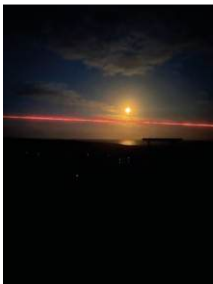
June in Galloway not providing ideal night firing conditions!