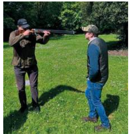
Whilst this may look very dangerous, this is the method of proving gun fit and eye dominance