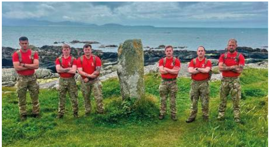
2PI Uist Speed March

Challenge activity became positively infectious through the summer, with platoons and companies co-ordinating their own events. Under Lieutenant Price, 8 members of 2 platoon planned and completed the 52 miles and 890m of ascent across Uist with 10Kg in 23hr 19 min – another demonstration of our soldiers' capacity to endure. For all this was also their first trip to the Outer Hebrides.