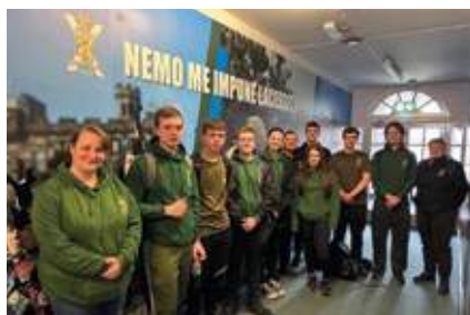
Cadets from 3 Platoon (RSB) Newmains visiting RHQ SCOTS

and were able to get hands-on with our Regimental history during object discovery sessions. Our new SCOTS branded gazebo had its first outing during one of our regular visits to Scots Corner for the 2 SCOTS Family Day in June, where our young artists styled their own tartan Cruachans.