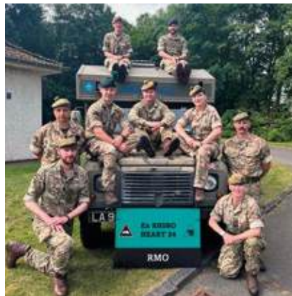
UAP on ADE, Ex Rhino Heart, Germany

assistance from the Med Branches at both 19X and 1(UK) Div.