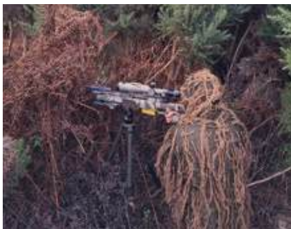
Thermal threat stalk