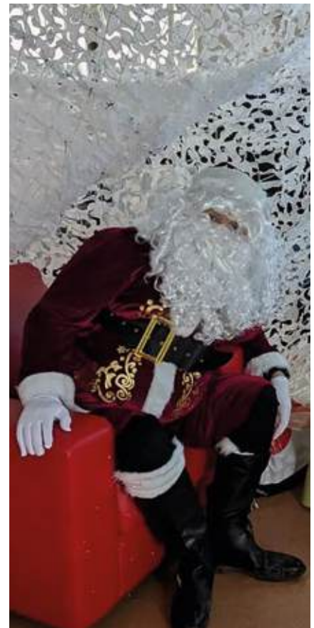
Santa Claus at our Kids Xmas Party

As we move into 2025 the department are preparing for an acceleration in activity and a ramping up in its support to our soldiers, officers, and their families. An overseas exercise and a unit move filling most of the FOE. We look forward to a year of variety and maybe a few kids parties at the beach.