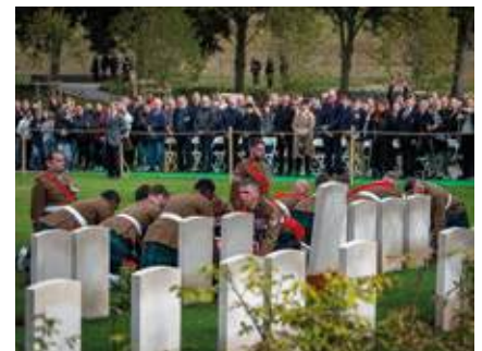
The Bearer Party lowering the coffins