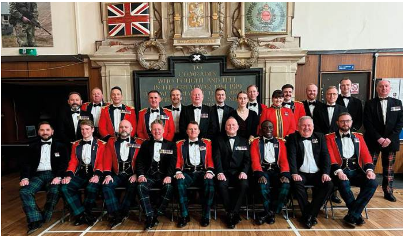
The St Andrew's Dinner Night

The mess is now back into the habit of organising events and has a team with the capability to put on fun events. In 2025 we look forward to building on 2024 and welcoming our friends and family to a number of exciting events we have planned.