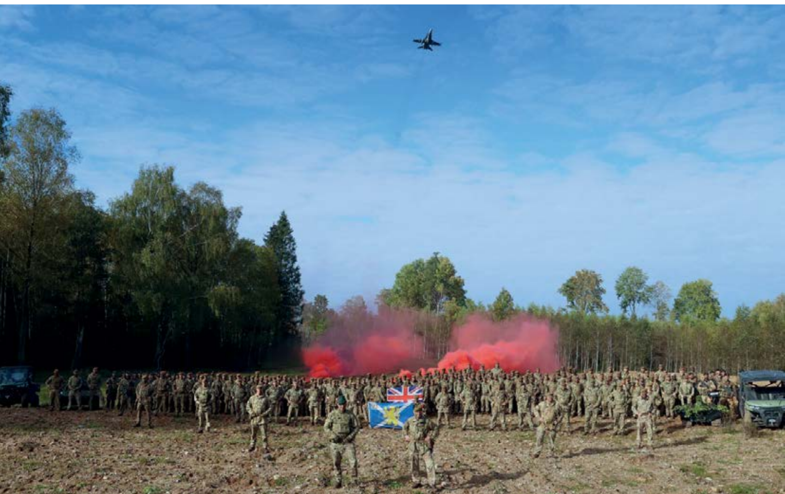
3 SCOTS BG, 11X Comd and a flyby from a Canadian F18 Hornet