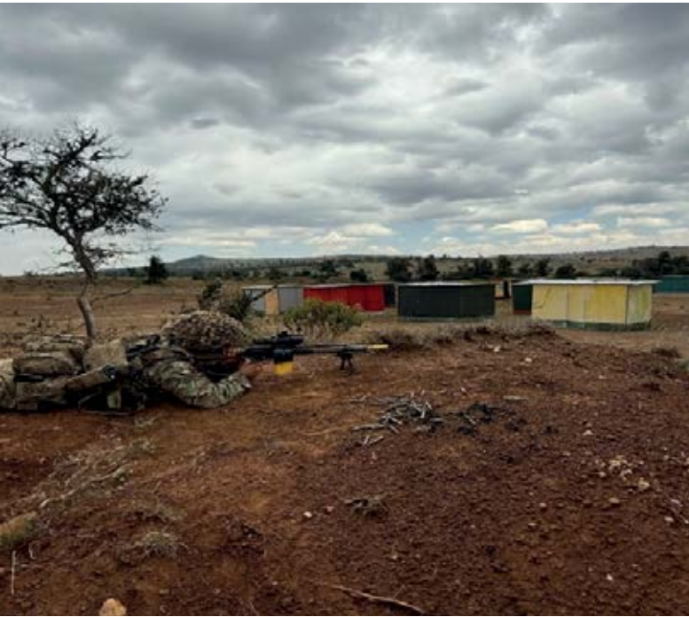
Charlie Coy provides SS support