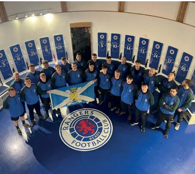
2 SCOTS Boxing team visit Ibrox