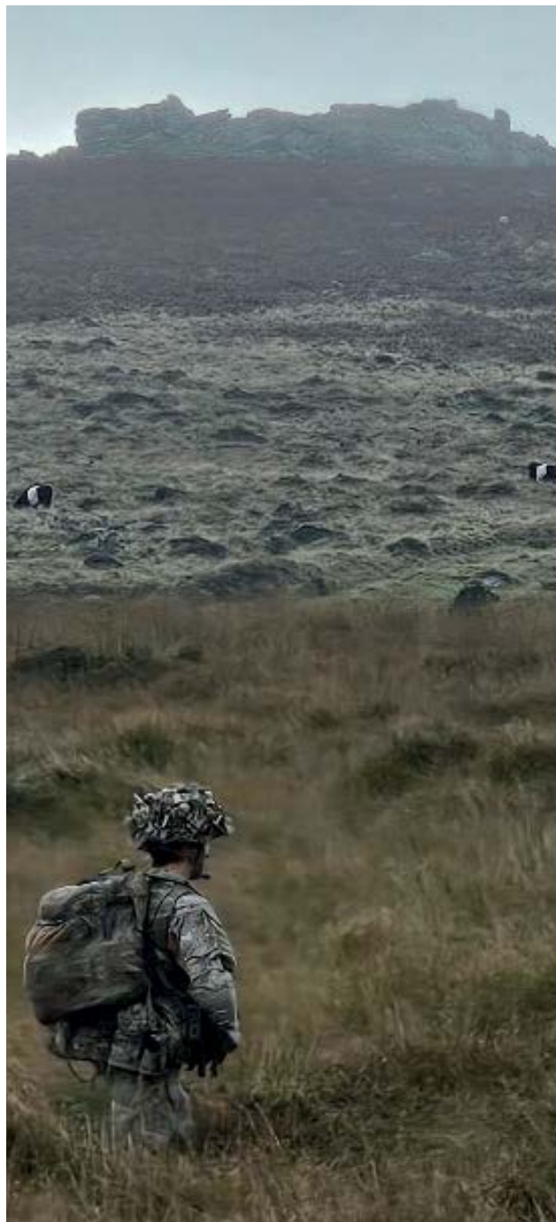
A 6 SCOTS soldier patrols in the wilderness of Dartmoor

Week two featured a live-firing package, giving soldiers the chance to fire rifle, pistol, and GPMG. The Exercise was set to finish with a march and shoot, but Dartmoor had other plans—the famous fog and bad weather rolled in, turning it into a march and march instead. Despite the conditions, morale stayed high, and the Battalion wrapped up a challenging but rewarding ADE