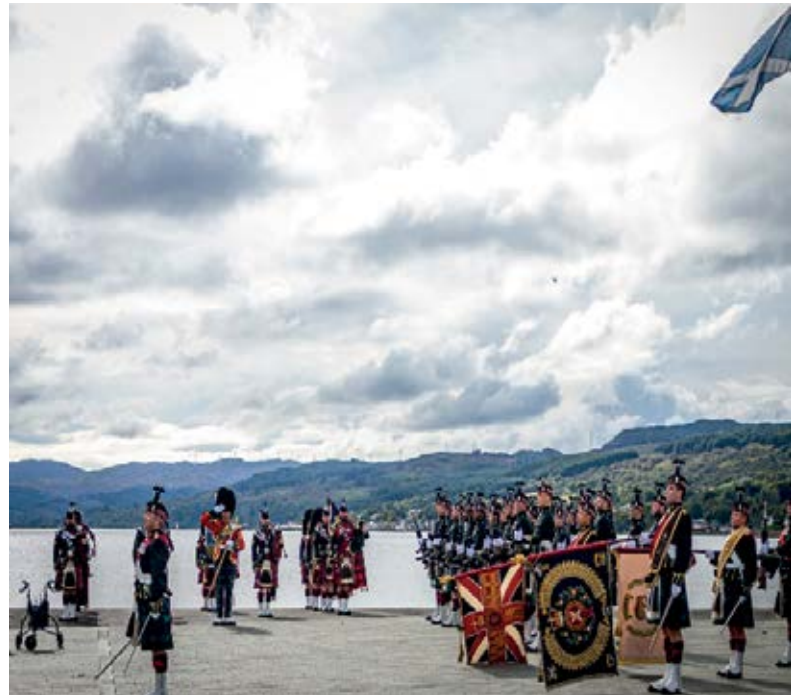
FSp Coy conducts a General Salute