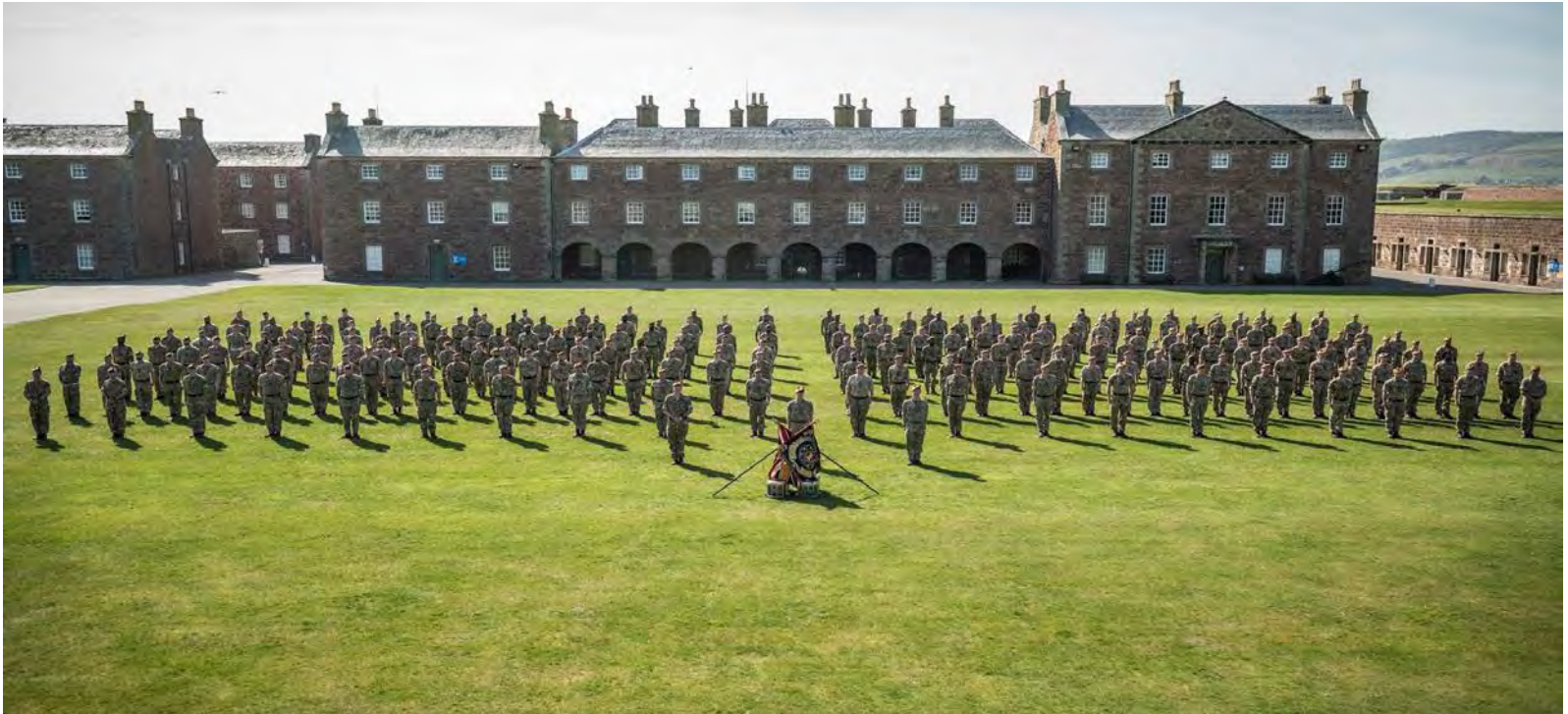
Bn Photo whilst hosting the Colonel of the Regiment

3 SCOTS celebrated the Regiment's 20th Anniversary on Monday 30 March 2026 at Fort George, bringing together personnel to reflect, reminisce and, in true military fashion, slightly misjudge their own physical readiness.