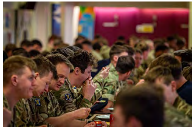
All ranks lunch

An all ranks lunch in the main dining facility followed, providing a welcome chance to relax and enjoy some lighthearted conversation. This also gave certain elders of the Regiment, notably the QM, the perfect opportunity to swing the lamp and regale the audience with tales of having served in all but one of the Regiment's Battalions, usually without allowing inconvenient facts to get in the way of a good story.