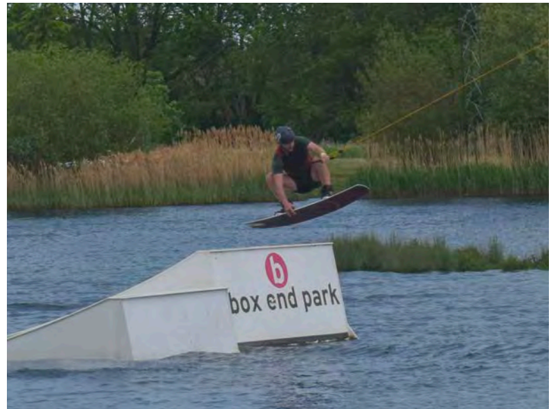
LCpl Danfer with a front side grab