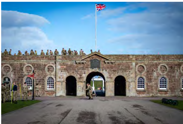
20th Anniversary WOD

Post lunch, and somewhat cruelly timed as many soon discovered, proceedings shifted to physical training. A specially designed 20th Anniversary WOD took place in the grounds of Fort George, testing teamwork, resolve and, in some cases, lunch related decision making. The events were completed with commendable effort, although several participants were left reconsidering both their portion sizes and life choices made earlier that day.