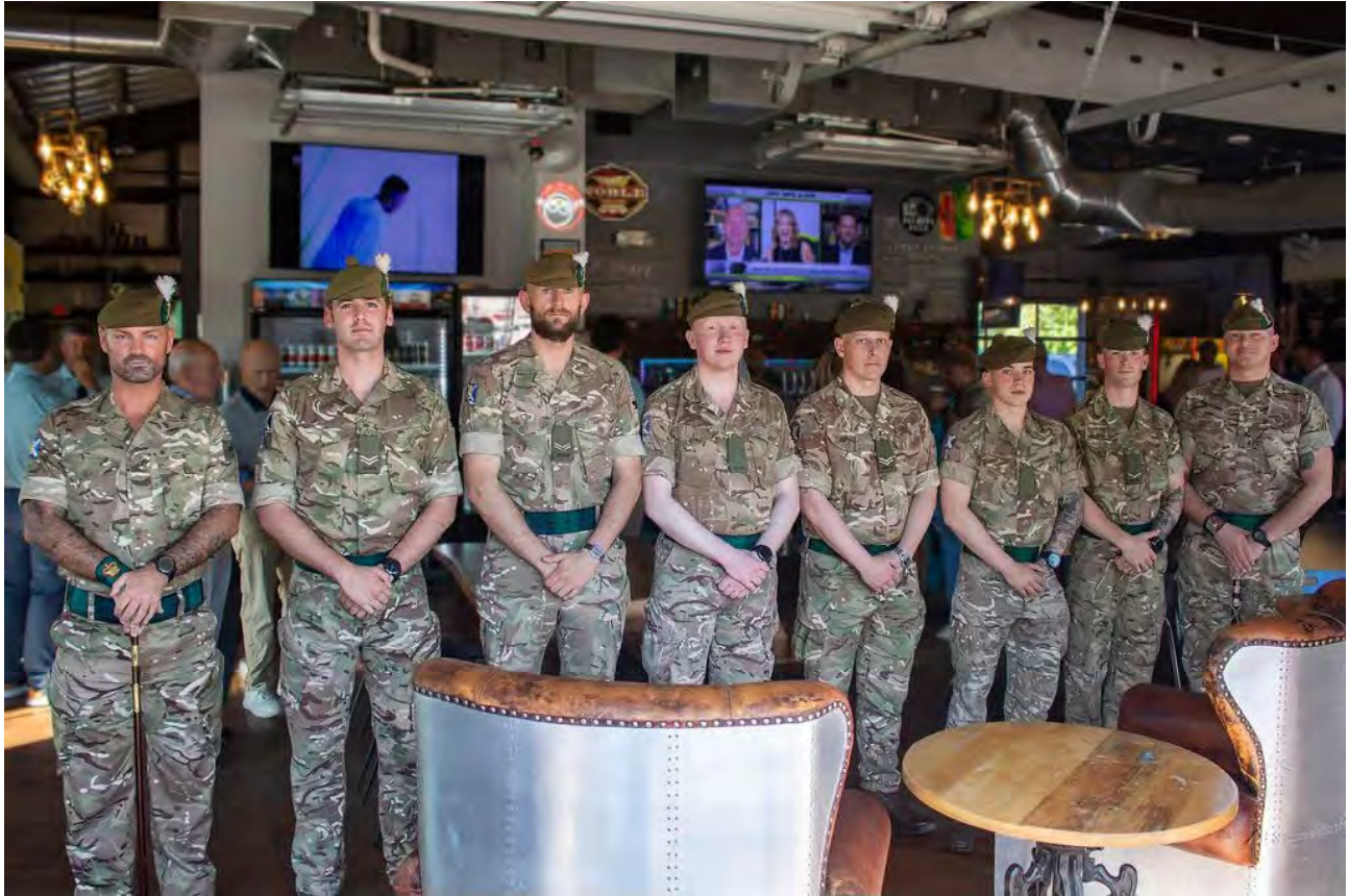
Honour Guard meeting the St Andrew's Society of the Upper South Carolina