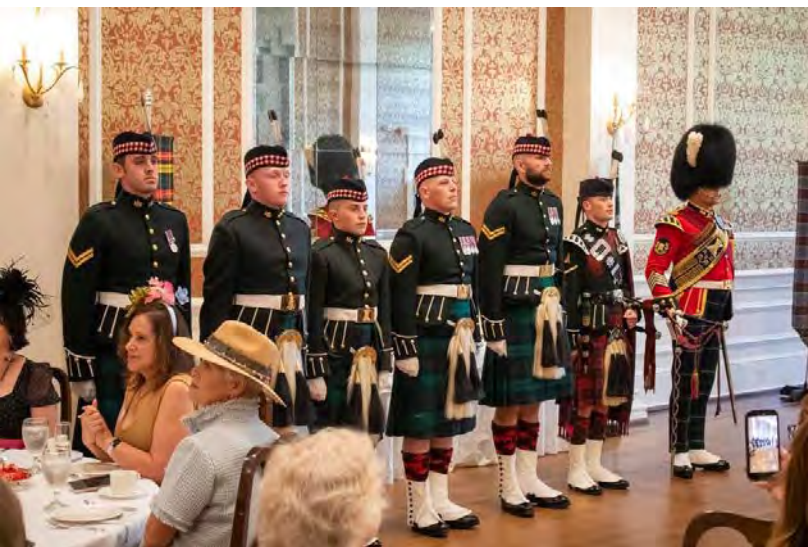
Honour Guard at the Ladies' Tea in the Poinsett Club

As the week progressed, formal engagements continued with the Ladies' Tea at the prestigious Poinsett Club, bringing together the wives and partners of St Andrew's Society members in an elegant setting that celebrated strong community bonds. The soldiers returned to the Poinsett Club on 21 May as honoured guests, reinforcing the deep ties between the society and the Regiment.