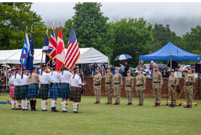
Honour Guard On Parade at the Greenville Scottish Games

Far from dampening spirits, the weather added authenticity to the occasion, highlighting the determination and morale of the 2 SCOTS Honour Guard.