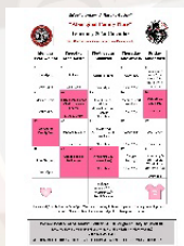
Family Place Calendar