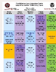
Head Start Calendar