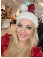
Entertainer Sandie Dodd