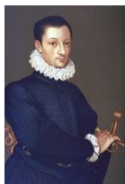
Aloysius Gonzaga as a young nobleman, painting of the Veronese school