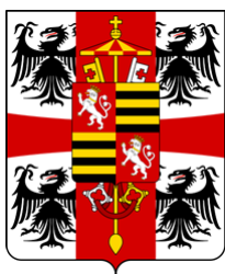
The Arms of the Gonzaga family (1510)

Translation: Saint Aloysius Gonzaga, having renounced his princely title became a religious in the Society of Jesus. He was among the first students of the the Roman College when, in the fervid impulse of sacrifice and love, in the year MDXCI (1591), he consecrated his young life to the comfort of those suffering from plague, frequenting this hospital where he carried one of the infected patients contracting the disease himself whereupon, on the 21st June, at only 23 years old, he rose to his celestial reward, an angel of purity and a martyr to charity. The Roman Peoples placed this memorial on the occasion of the centenary of the Canonisation solemnly celebrated by the Church and the State to the Glory of God and the honour of Italy 29 June 1928.