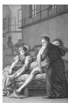
Aloysius assists victims of the plague