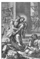
Aloysius assists victims of the plague