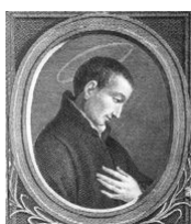
St Aloysius Gonzaga SJ