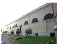
The hospice where St Aloysius tended the sick