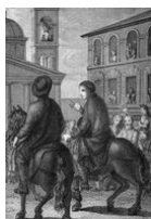
Aloysius leaves the family home