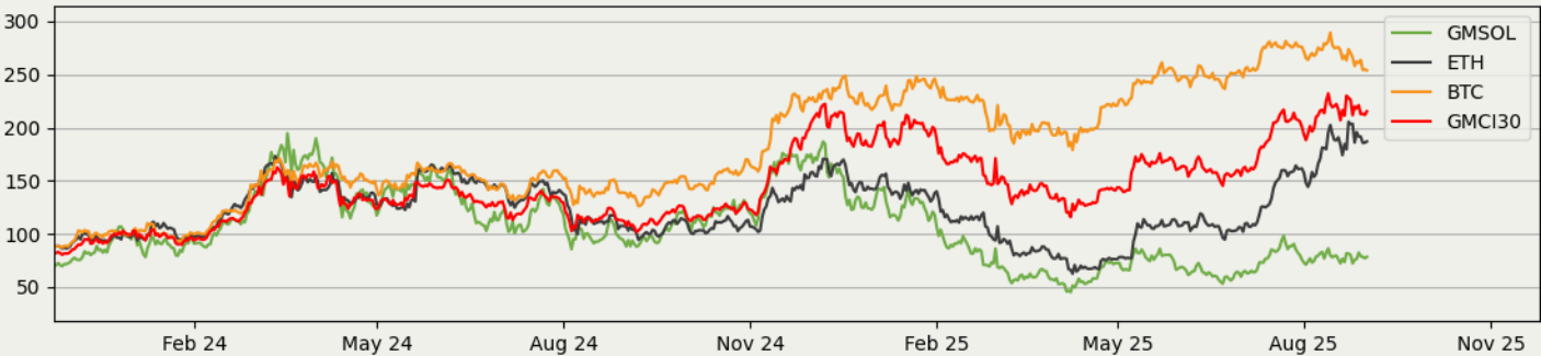
Performance GMSOL vs GMCI30 vs BTC vs ETH

* Prices for BTC and ETH are normalized to 100 at 2023-12-29.