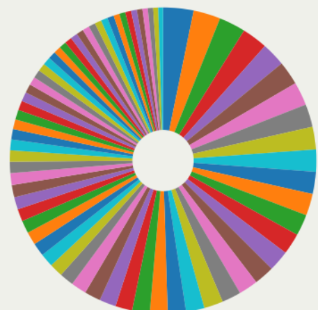
Weights per Constituent *