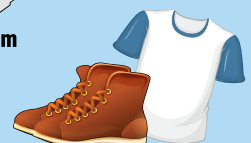
X Textiles (Clothes, Shoes)