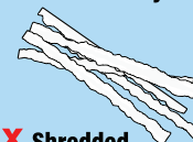
X Shredded Paper