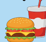
X Food & Beverages