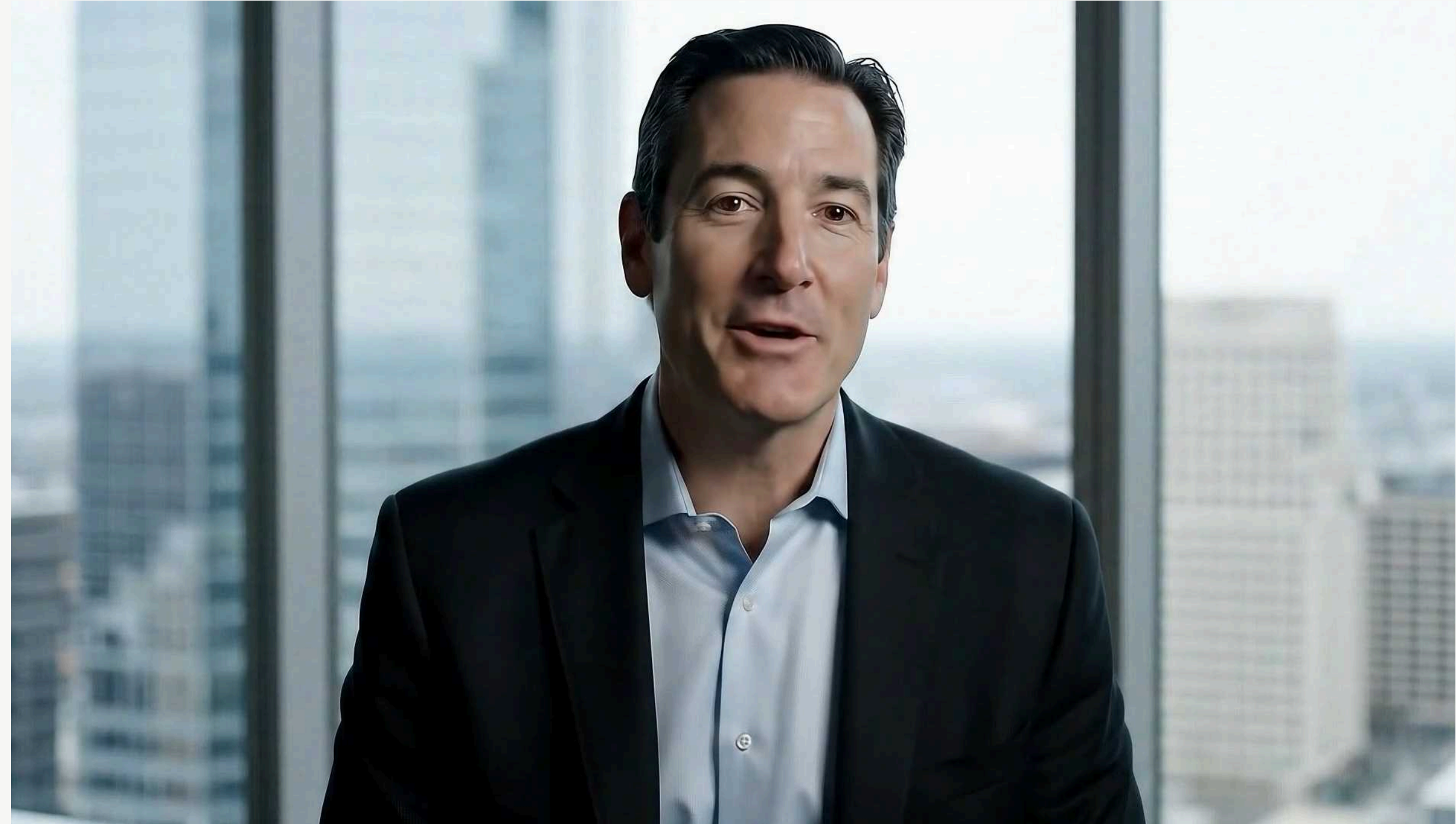
Direct To Camera