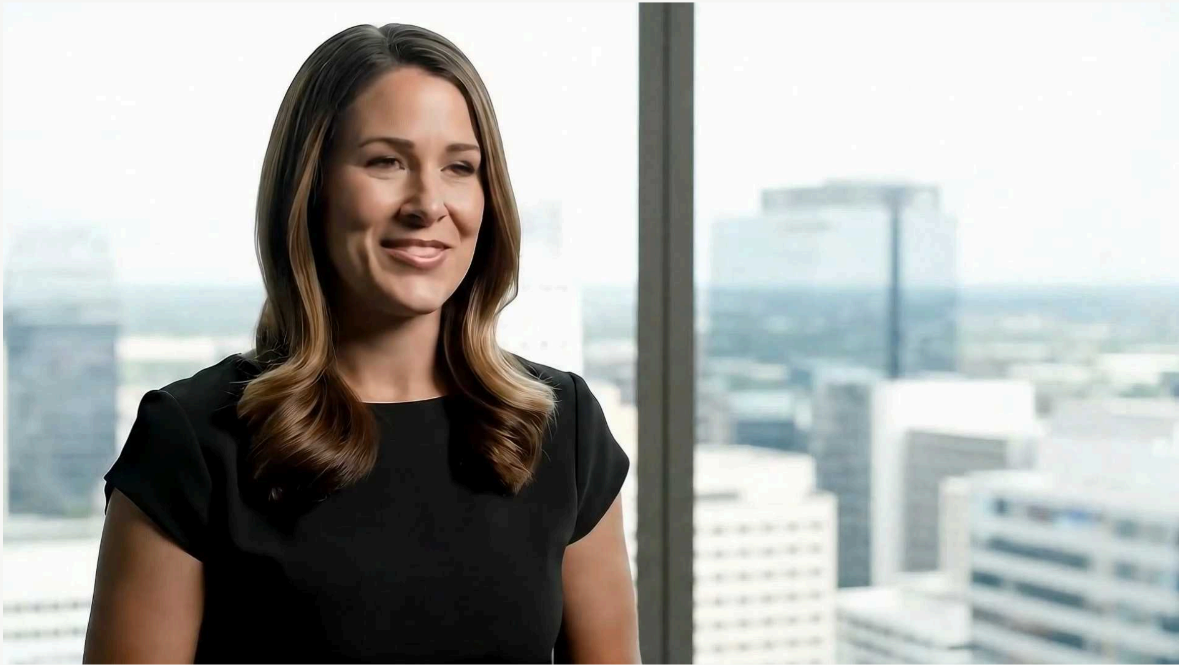
Interviews Spotlighting Your Leaders