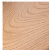
ALTERNATE FINISH: OAK WOOD