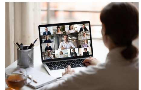
KMI's Virtual CKM Classes have proven tremendously successful.