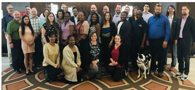
Recent CKM Live (in person) Class, Washington DC.

There are no prerequisites, and no technical background is required. CKM Graduates range from newcomers to seasoned KM managers and practitioners, content managers, project managers, IT as well HR professionals. We serve individuals and teams from public, private, and military sectors, non-profits and NGO's.