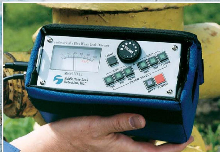
Ground Miking with the LD-12 to Pinpoint the Leak