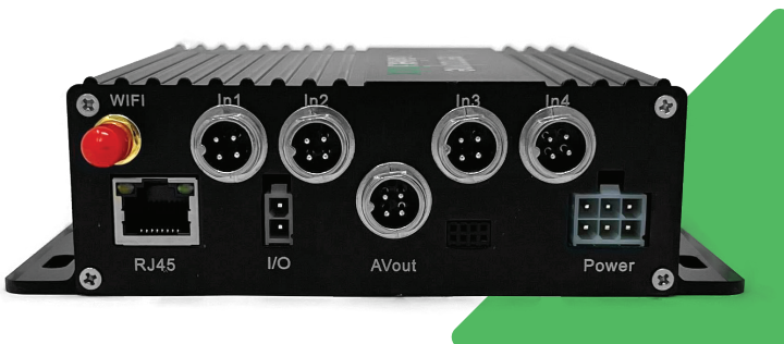
Input / Output Features & Connectivity