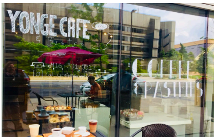
YONGE CAFE & BISTRO