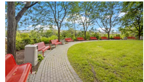
OUTDOOR SEATING AREA