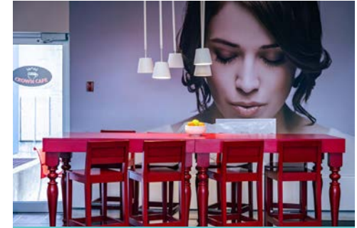
ON-SITE FOOD OPTIONS