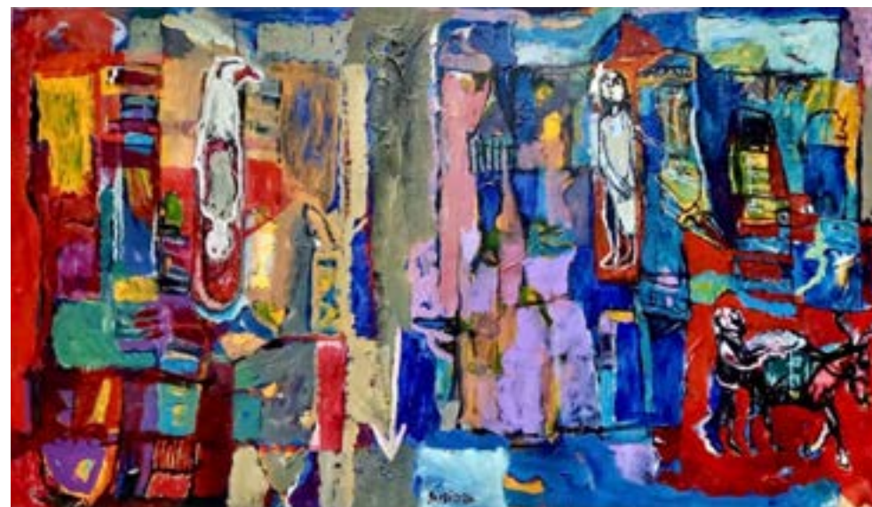
Asaad Arabi Bombing of Old Cities, 2024 Acrylic on Canvas 195 X 140 cm