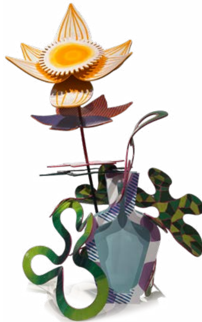
Soraya Abu Nabaa Signs of Spring , 2023 Painted Aluminum 114 X 81 X 53 cm