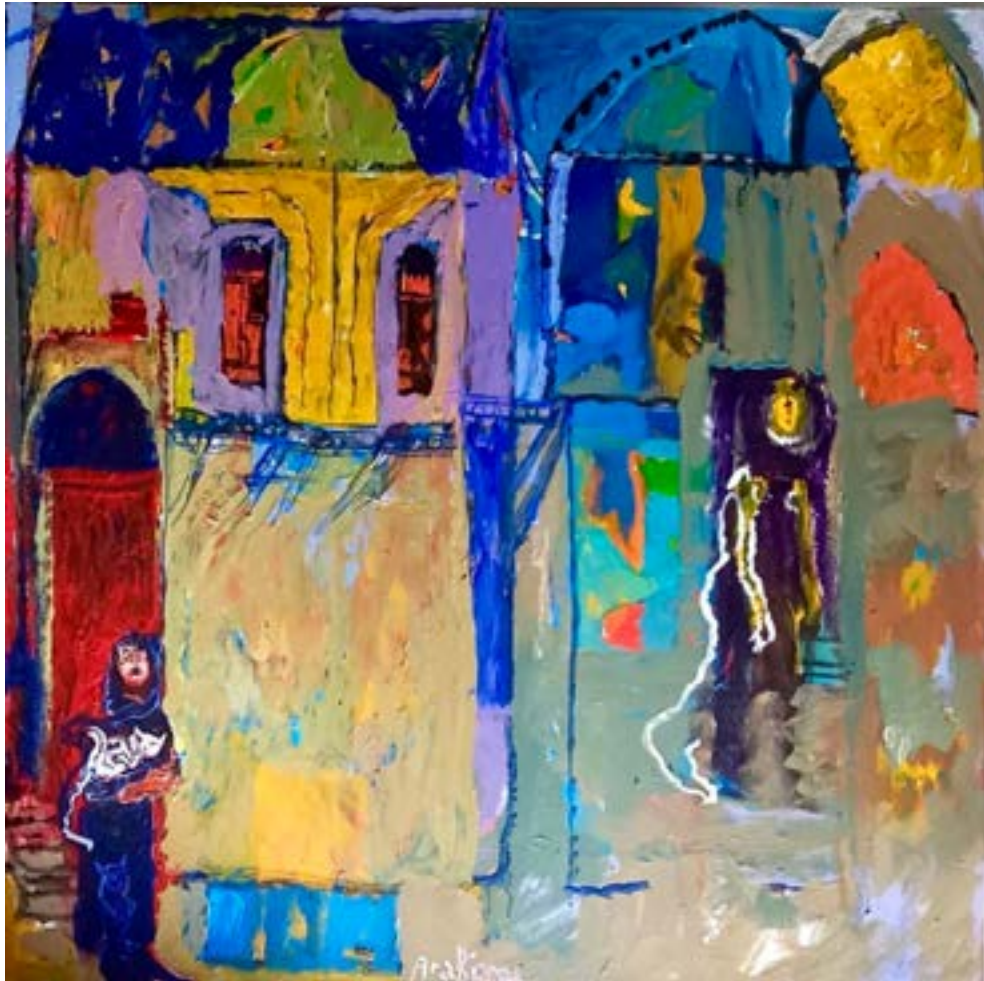
Asaad Arabi Gate of Dreams, 2024 Acrylic on Canvas 150 X 150 cm