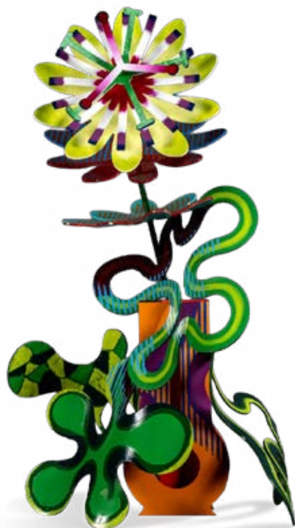
Soraya Abu Nabaa Still Life , 2024 Painted Aluminum 114 X 81 X 53 cm