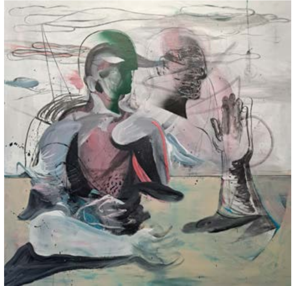
Ousamma Diab Man and Shadow , 2022 Mixed Media on Canvas 100 X 100 cm