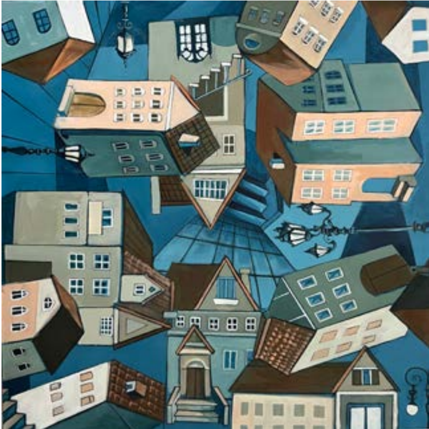
Noor Bahjat Folded Horizon , 2025 Acrylic on Canvas 90 X 90 cm