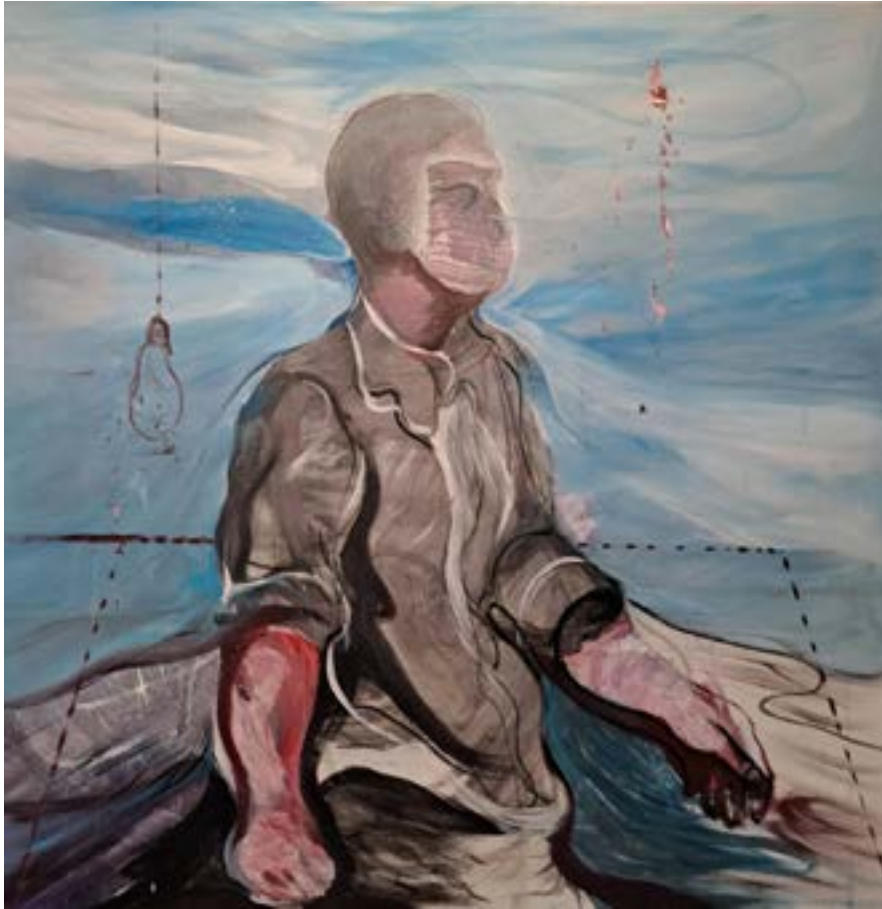
Ousamma Diab On the Way , 2022 Mixed Media on Canvas 100 X 100 cm