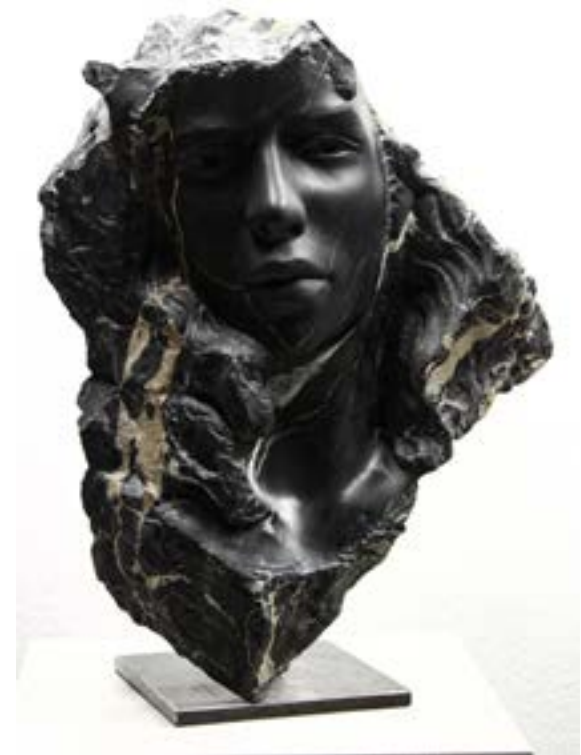
Elias Naman Fragment of Humanity I, F , 2024 Black Portoro marble from Portovenere (Cinqueterre) 45 X 35 x 25 cm