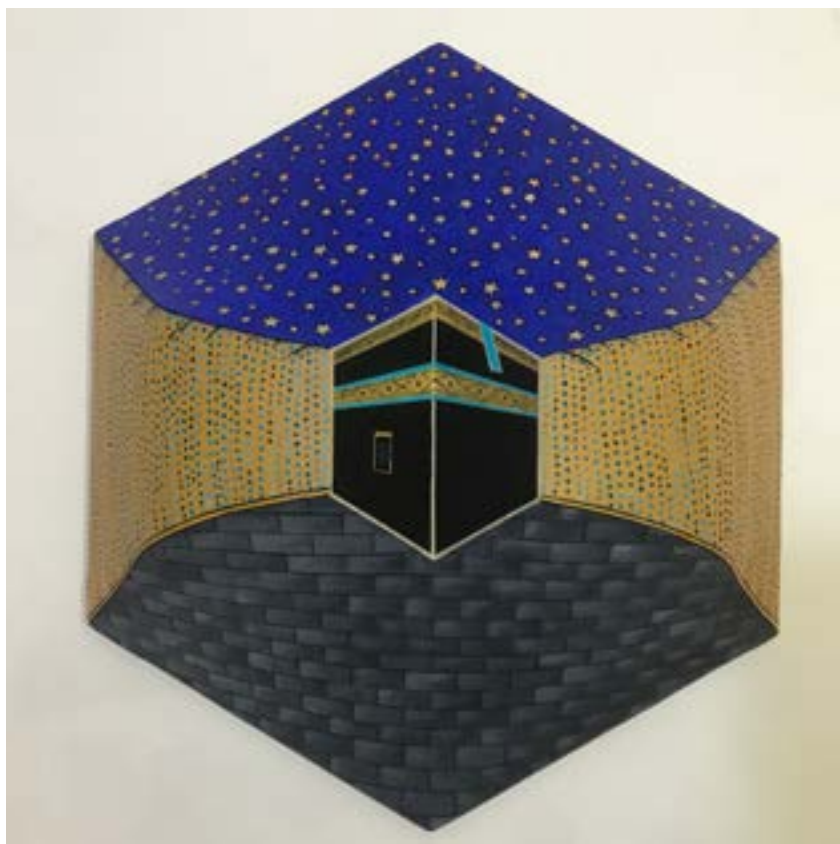
James Mathews Siyer i Nebi II , 2020 Acrylic gesso on canvas stretched over wooden structure 63 X 73 X 19 cm