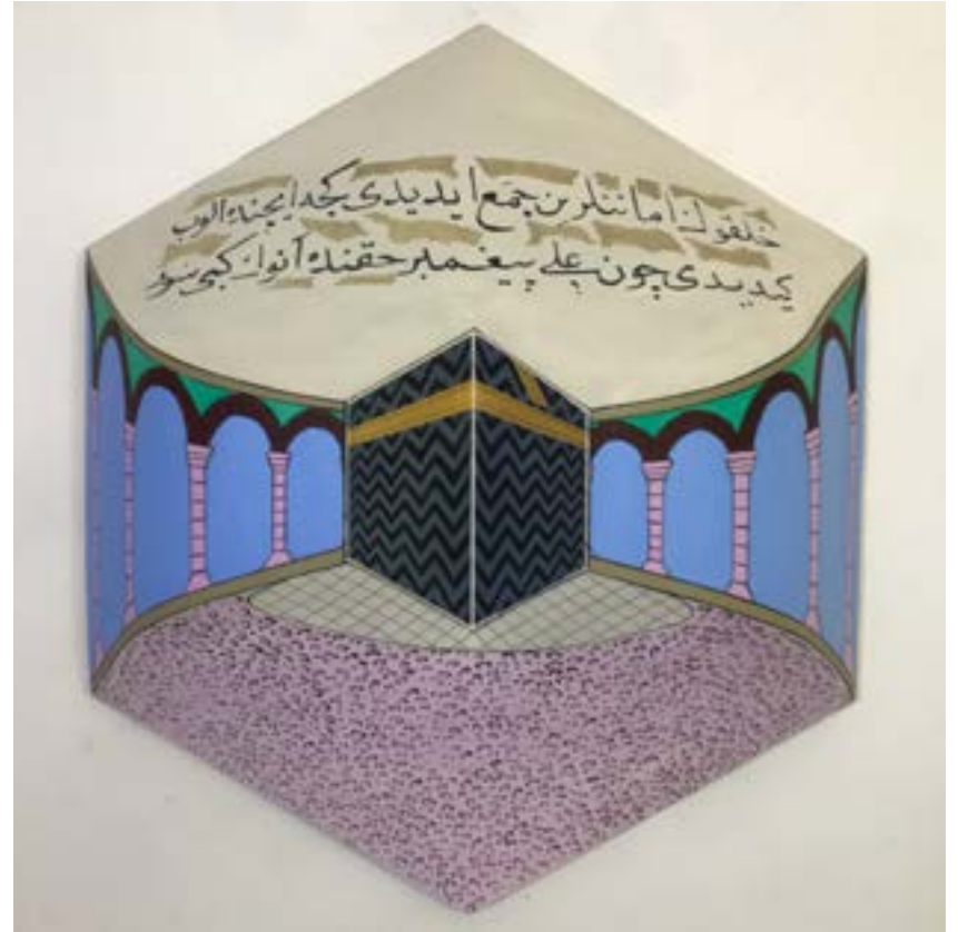
James Mathews Siyer i Nebi IV , 2020 Acrylic gesso on canvas stretched over wooden structure 63 X 73 X 19 cm