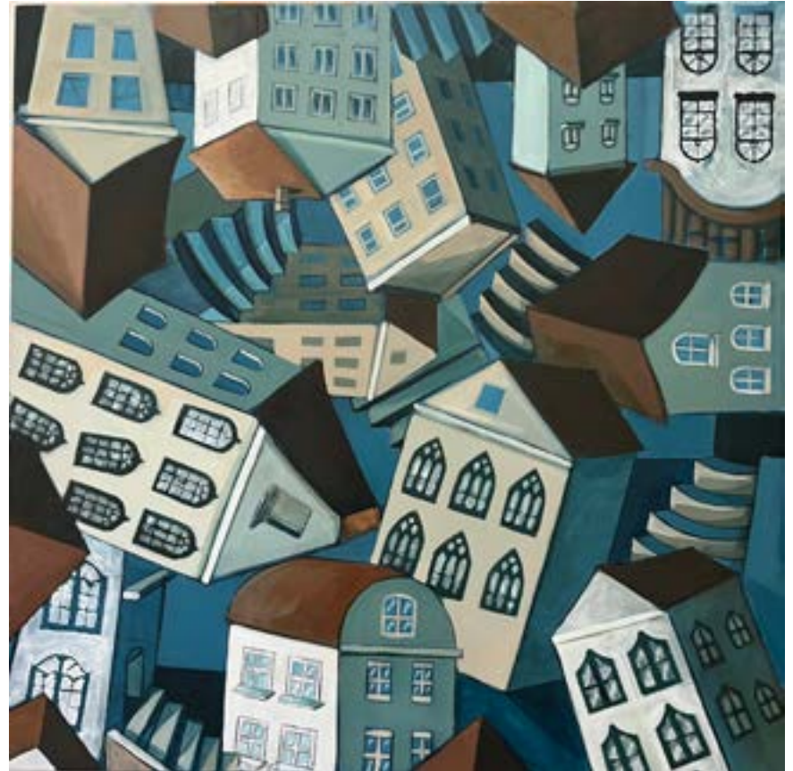
Noor Bahjat Vertigo Skyline, 2025 Acrylic on Canvas 90 X 90 cm