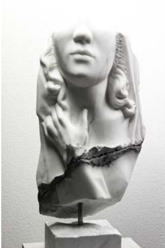
Elias Naman Fragment of Humanity IV, (Front) , 2024 Calacatta marble from Carrara 60 X 30 x 20 cm