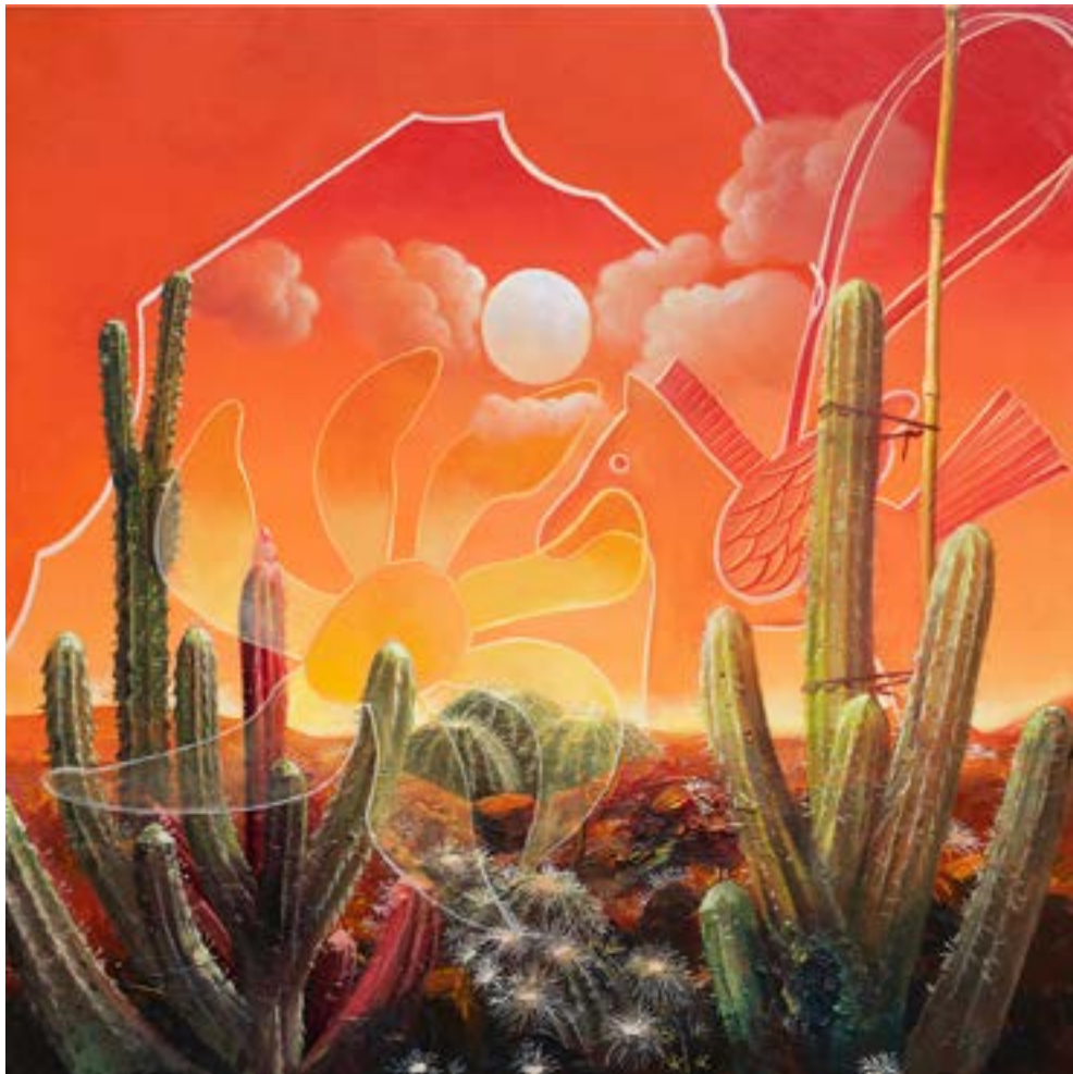
Layal Khawly Untitled, 2023 Oil and Acrylic Paint on Linen 155 X 155 cm