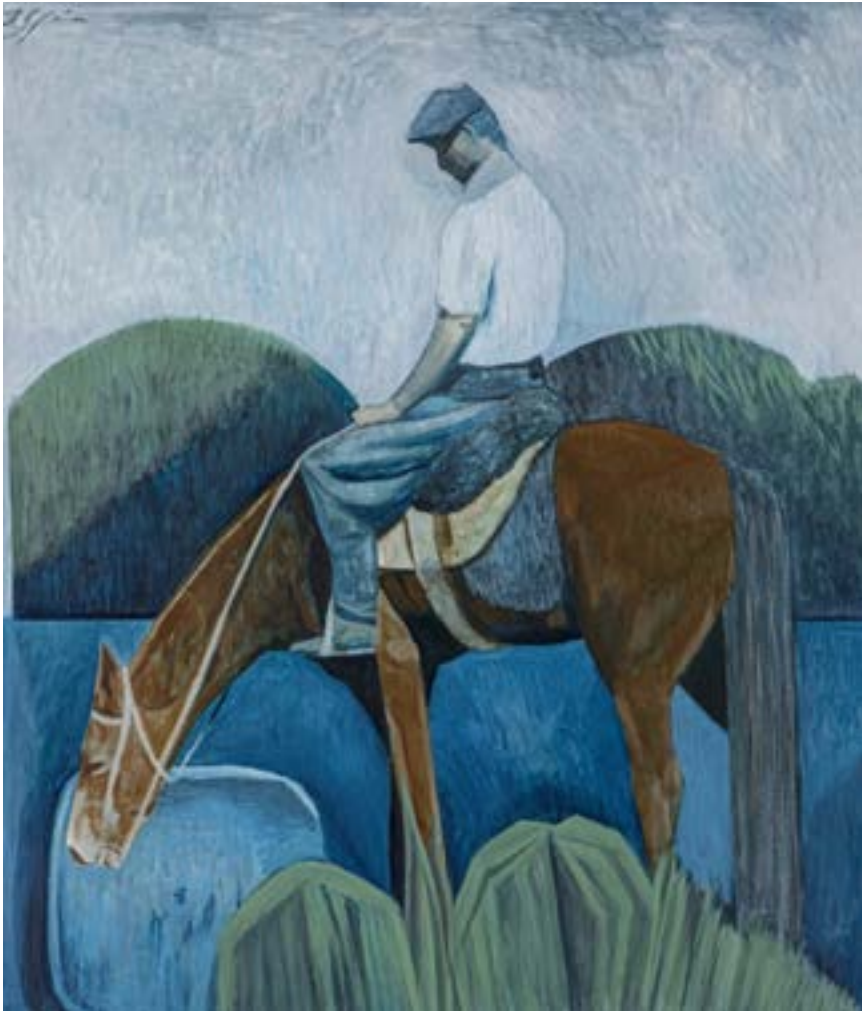
Bruno Sfeir Journey Through the Countryside II , 2023 Acrylic on Canvas 94 X 108 cm