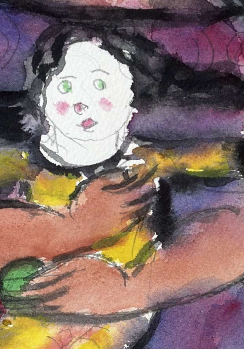
Shalabia Ibrahim Untitled, 2023 Watercolour on Cartoon 41 X 32 cm