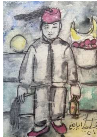
Shalabia Ibrahim Untitled Watercolour on Cartoon 16 X 12 cm each