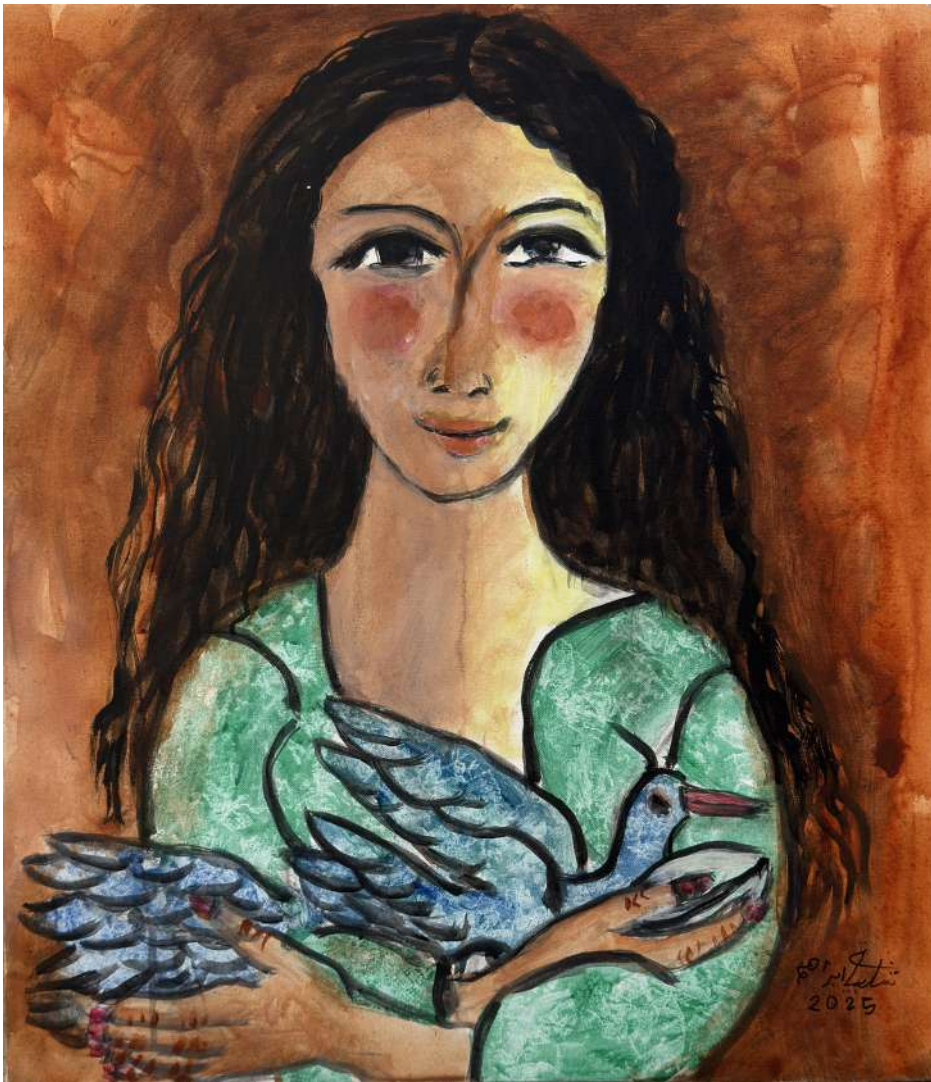
Shalabia Ibrahim Untitled, 2025 Oil on Canvas 69.5 X 59.5 cm