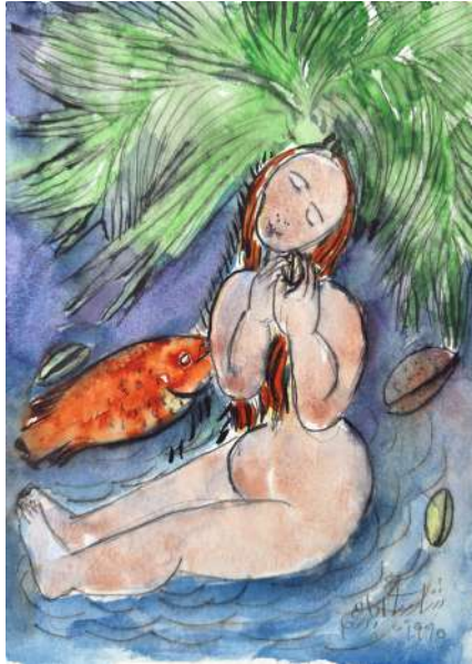
Shalabia Ibrahim Untitled, 1995 Watercolour on Cartoon 21 X 15 cm