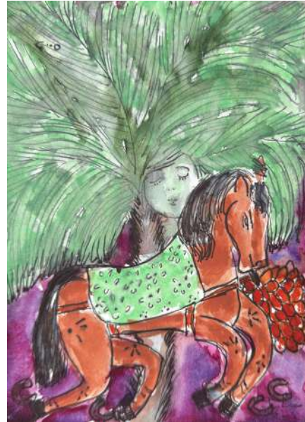
Shalabia Ibrahim Untitled, 2004 Watercolour on Cartoon 21 X 15 cm