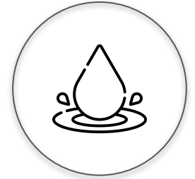
Water dispensing machine