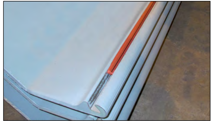
AKILA system: MSP-1 product extruded into the interlock