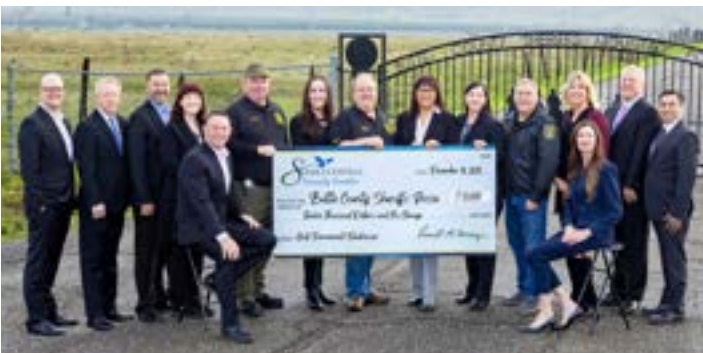
BUTTE COUNTY SHERIFF'S POSSE

Proceeds from our golf tournament were donated to these two worthy organizations!