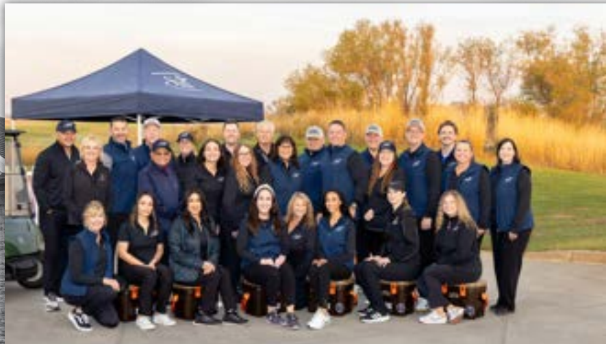
SIERRA CENTRAL GOLF COMMITTEE & VOLUNTEERS