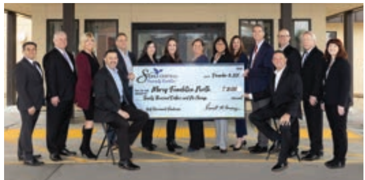
ST. ELIZABETH COMMUNITY HOSPITAL