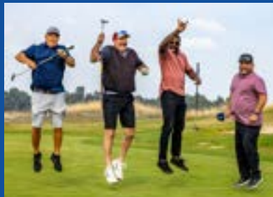
32 teams stepped onto the green to do good, but obviously had some fun too!