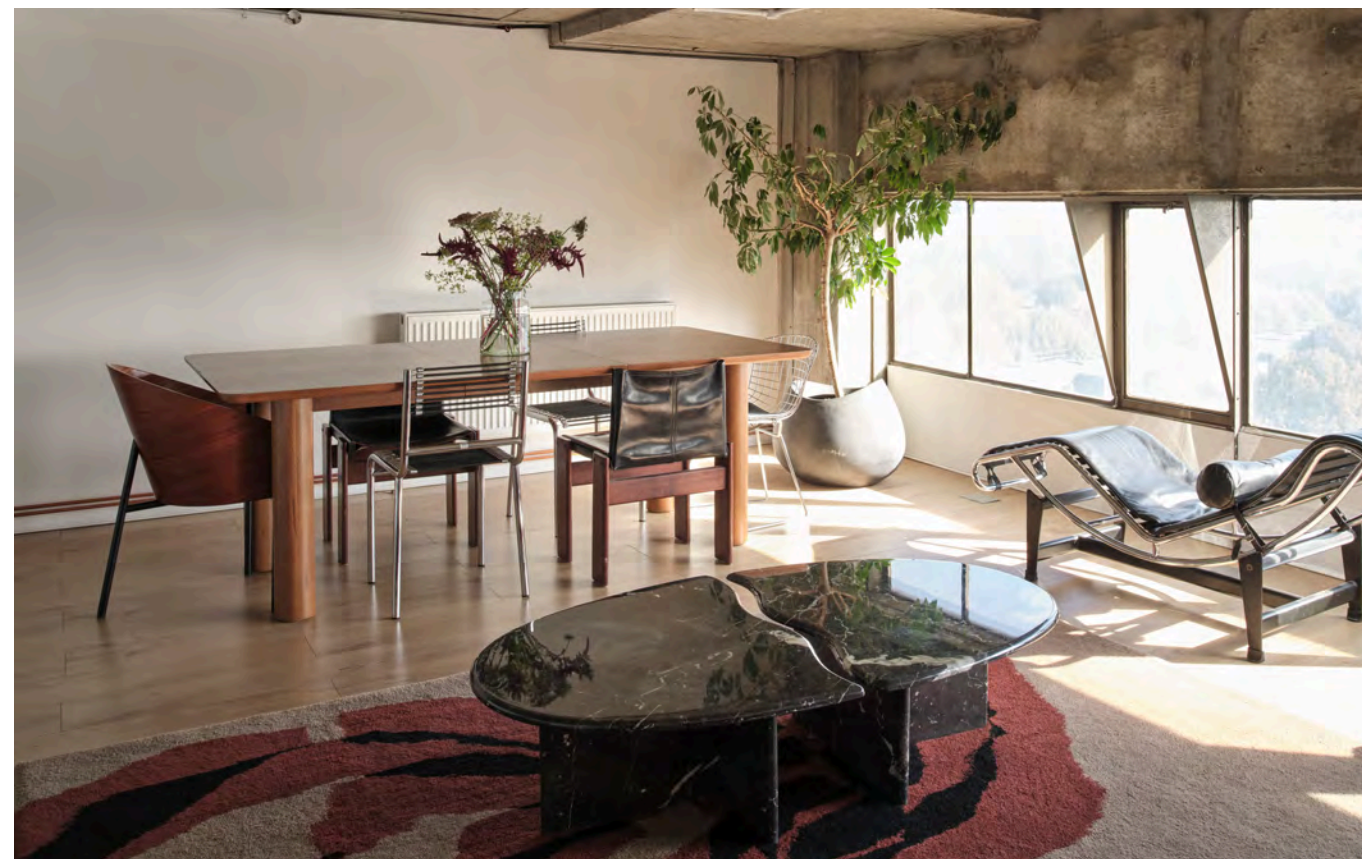
MEZZANINE LEVEL CLIENT AREA