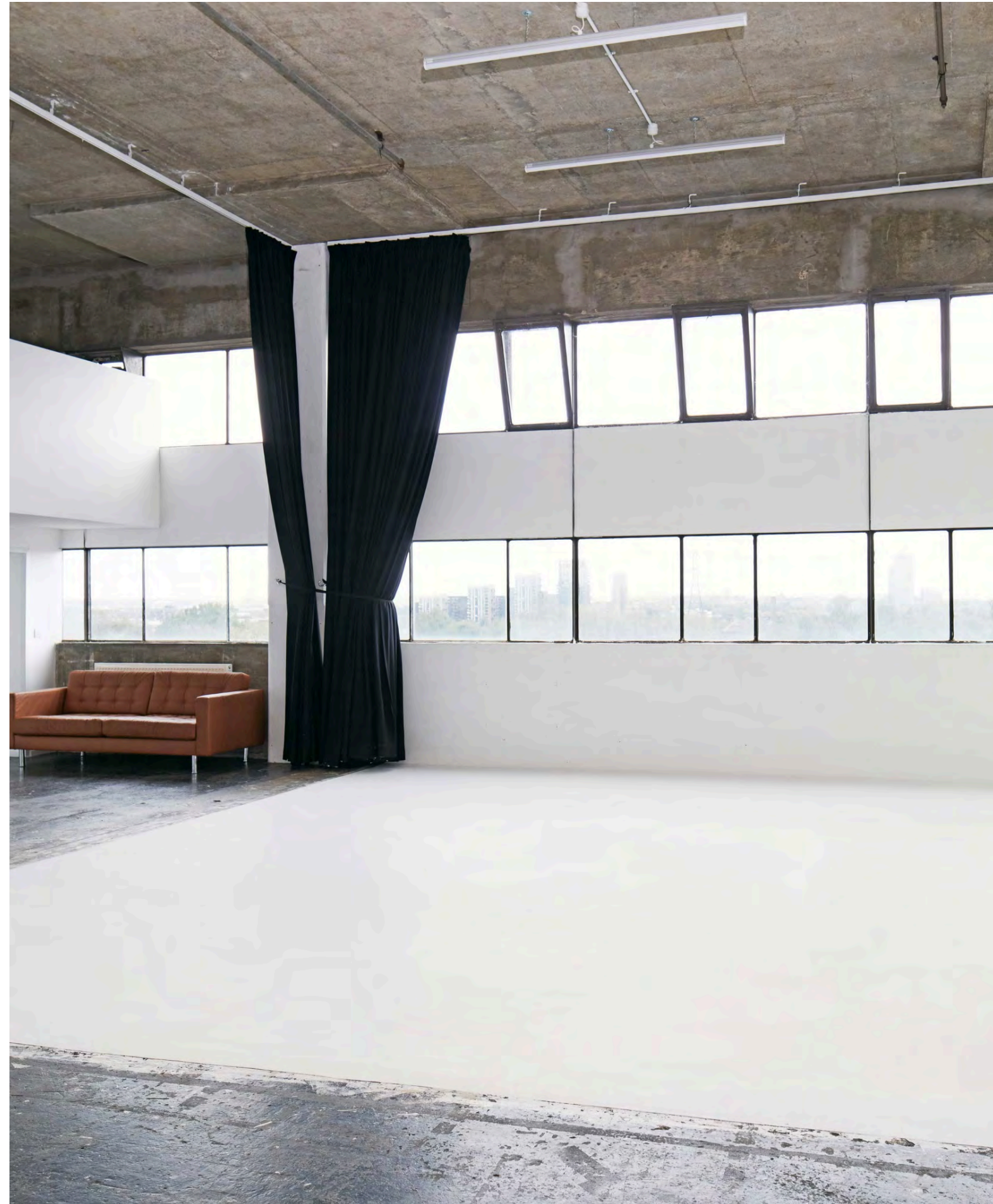
5.5 x 5.5 FLOOR TO CIELING COVE