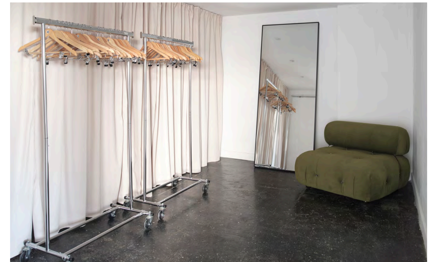
SEPARATE STYLING AREA